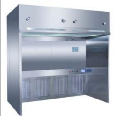
Sampling Dispensing Booth