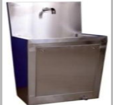
One Way Stainless Steel Surgical Scrub Station