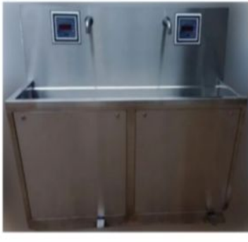
Two Way Stainless Steel Surgical Scrub Station