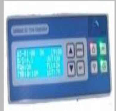
Laminar Air Flow Controllers