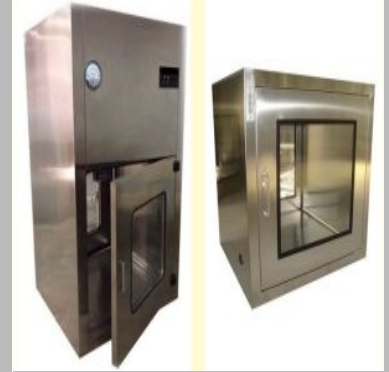
Clean Room Pass Box