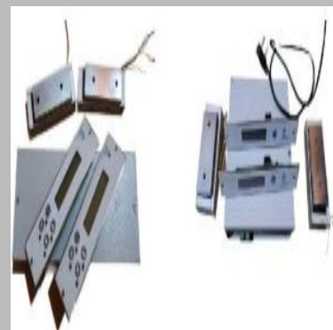
Pass Box Controller