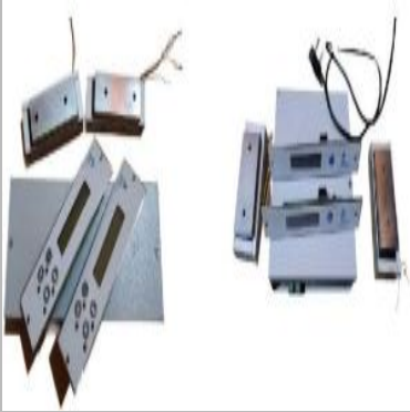
Pass Box Controller

We A3G INDIA are a leading and distinguished Manufacturer, Exporter and Supplier of quality AIR Damper, Cassette AIR Conditioner, Clean Room Equipment, Clean Room Fittings and Furniture and Control Panels.