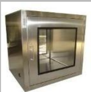
static pass box