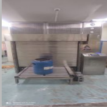
SS 304 De-Dusting Tunnel With Brushing System