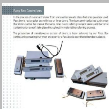
Dynamic Pass Box Controller