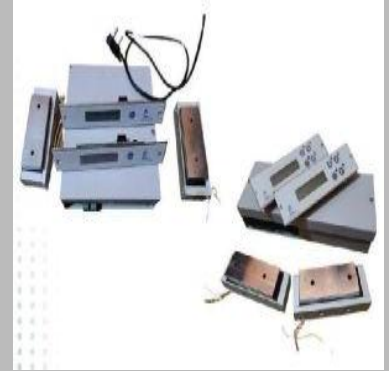
Static Pass Box Controller