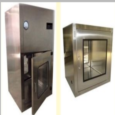
Clean Room Pass Box