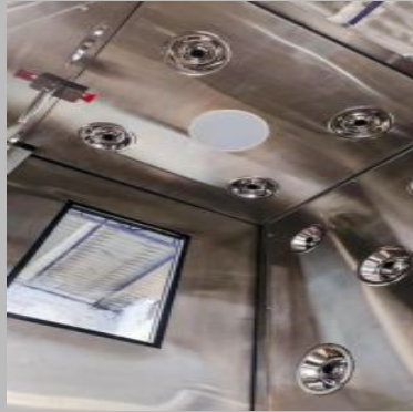
Cleanroom Air Shower Unit