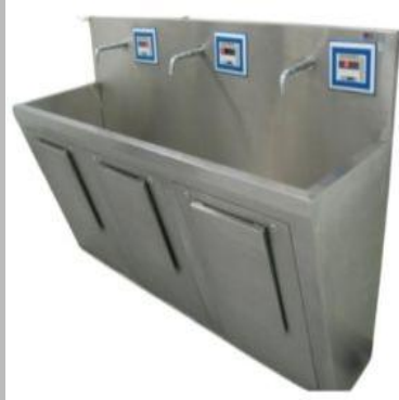
Three Way Stainless Steel Surgical Scrub Station