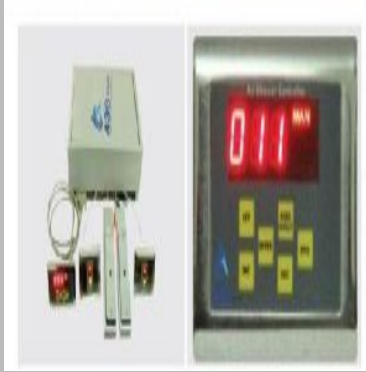
Air Shower Controller