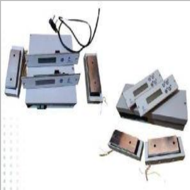
Static Pass Box Controller