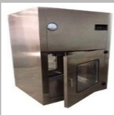
Dynamic Pass Box