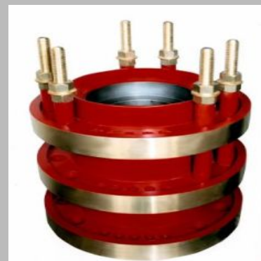
Slip Ring For Kirloskar 1000 HP Motor