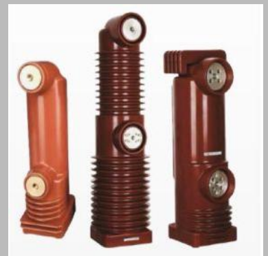
Epoxy Resin Spout For VCB