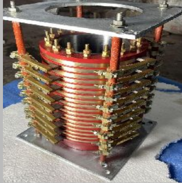
18inch Three Phase Slip Ring