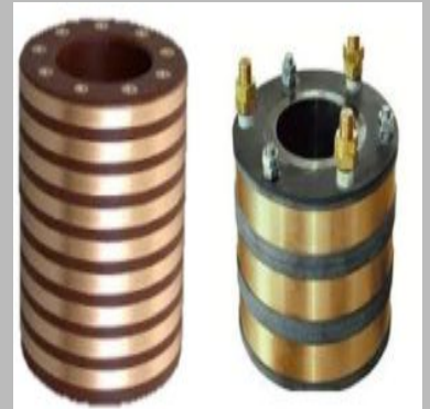
Slip Ring Assembly For Packaging Machine