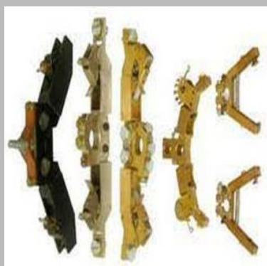
Double Brush Holder With Clamp