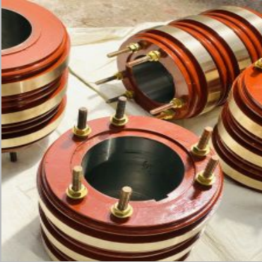
Crompton Greaves Slipring