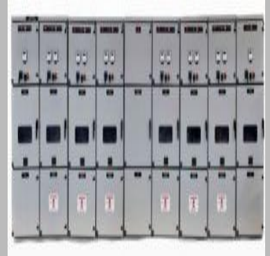
12kV VCB Panel