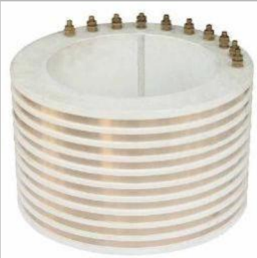
Moulded Slip Ring

Aarco India is known as top Manufacturer, Exporter, Supplier, Retailer and Trader of best Carbon Brushes, Control Panel Accessories, Copper Components, Electric Motors & Components and Electrical Insulator.