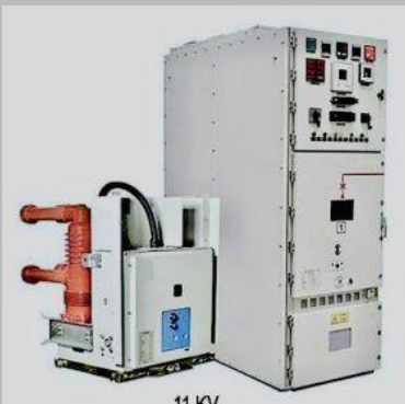
11kV VCB Panel