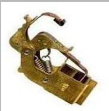
Tandem Brush Holder