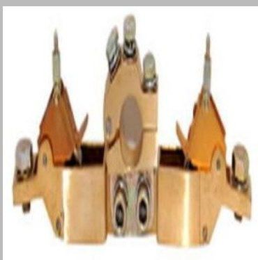
Carbon Brush Holder For NGEF AC Motor