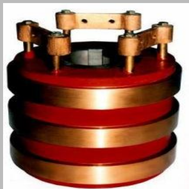
GEC 150 HP Motor Slip Ring