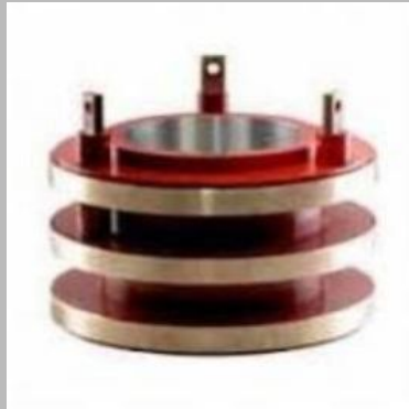
Open Type Slip Ring