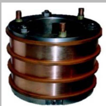
Slip Ring For Bhel HT Motor