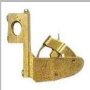
Tandem Brush Holder With Clamp