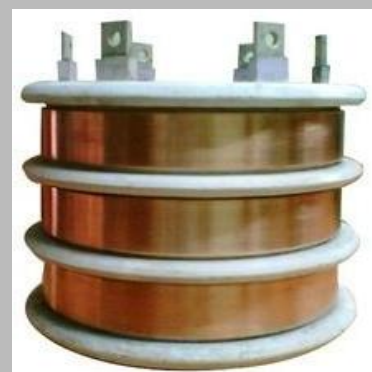
Alstom 1000 HP Motor Slip Ring