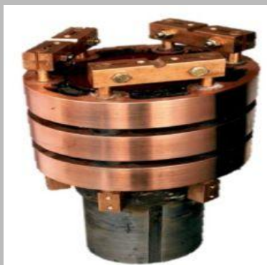
Slip Ring With Clamp