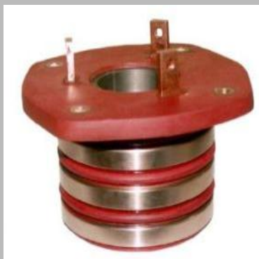
Slip Ring For Water Box Plant