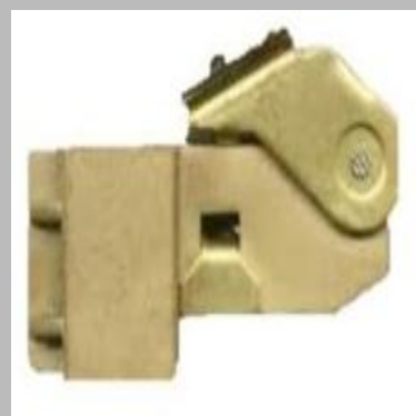
Carbon Brush Holder For IEC DC Motor