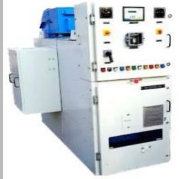
33kV Indoor VCB Panel