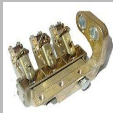
Flange Brush Holder