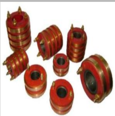
Generator Slip Ring