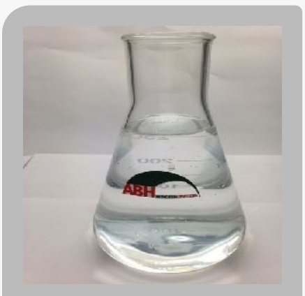
Textile Soaping Agent