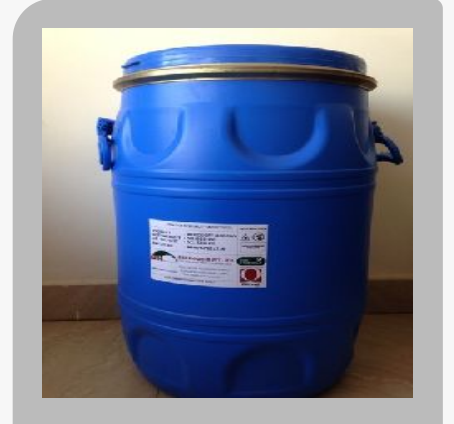
Textile Scouring Agent