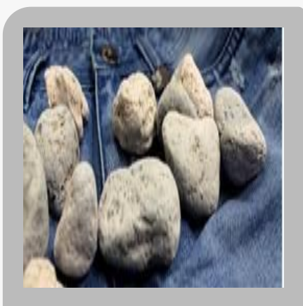
Stone Washing Enzyme