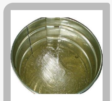
silicone textile softeners