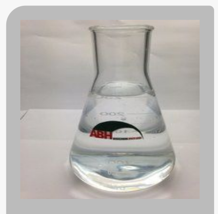
Textile Peroxide Killer