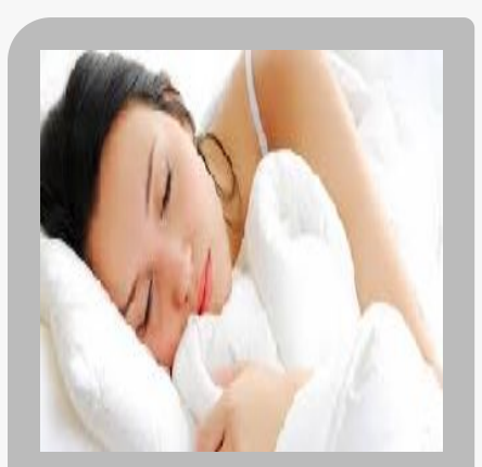
Softeners & amp; Hydrophilic Softeners