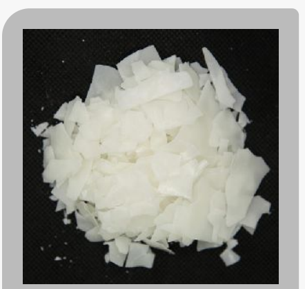
Non Ionic Softener