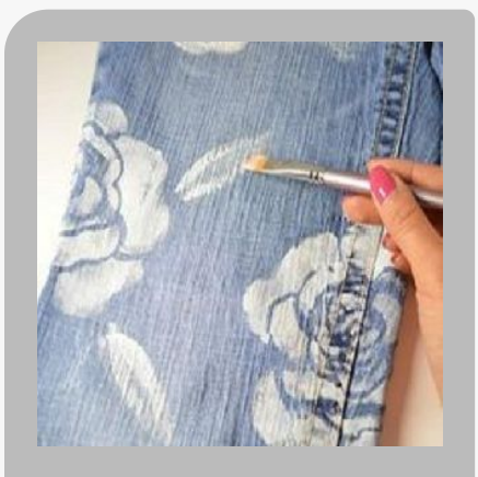
Textile Specialty Chemical