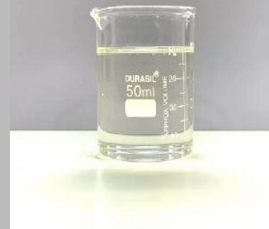
80% Liquid Benzalkonium Chloride