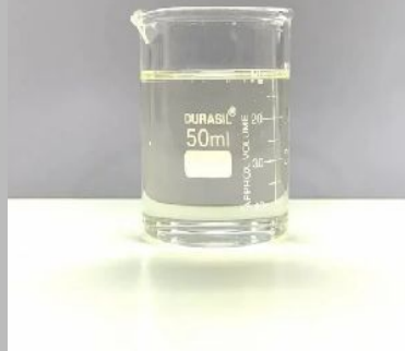
50% Liquid Benzalkonium Chloride