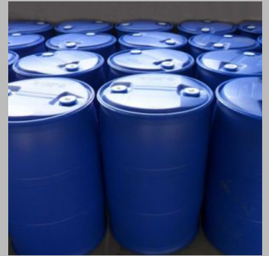
Liquid Drilling Polymer