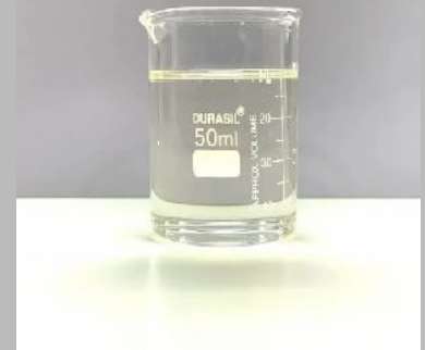
80% Liquid Benzalkonium Chloride