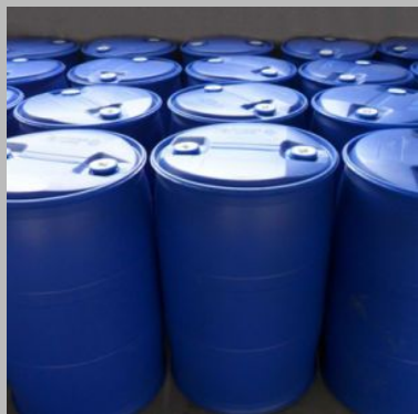
Liquid DEHA Diethylhydroxylamine