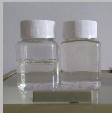
Tetrakis Phosphonium Sulfate