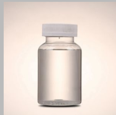
Cationic Polyelectrolyte Liquid