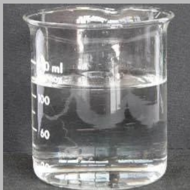
Silver Hydrogen Peroxide