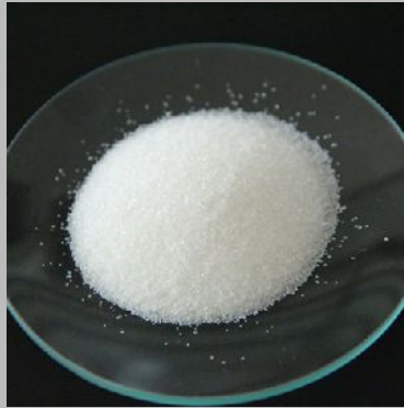
Super Absorbent Polymer