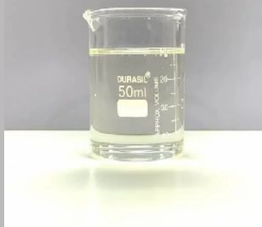
50% Liquid Benzalkonium Chloride