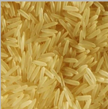
Golden Sella Basmati Rice