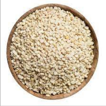
White Urad Dal