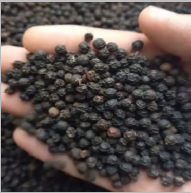
Black Pepper Seeds

We Adi Keshava Enterprises are a leading and distinguished Exporter, Supplier, Retailer and Trader of quality Chilli, Cinnamon, Coconut, Coconut Oil and Cooking Oil.