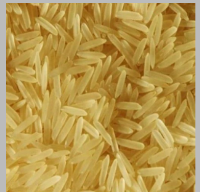
Golden Sella Basmati Rice