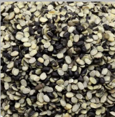
Black Urad Dal