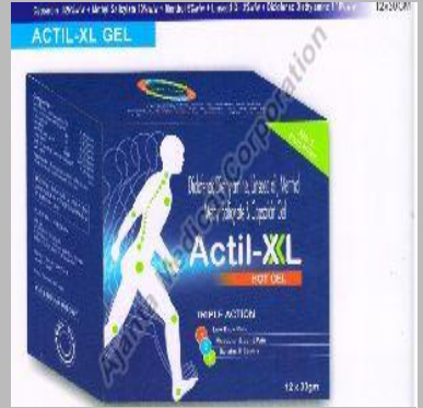
ACTIL XL HOT GEL 30GM