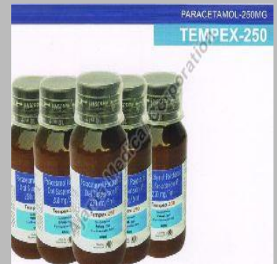
TEMPEX 250 60 ML

PARACETAMOL 120MG + LEVOCETIRIZINE 2.5MG + PHENYLEPHRINE 5MG SYNEX-3