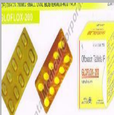
GLOFLOX 200 TAB