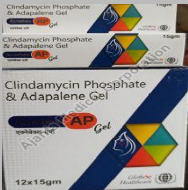
ACNEBEX AP GEL 15 GM