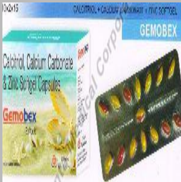
GEMOBEX SOFT GEL CAP