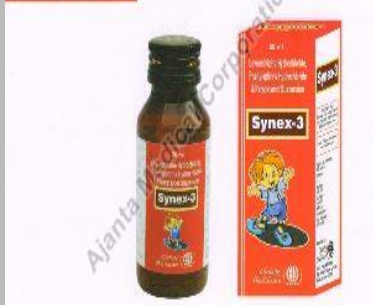
SYNEX 3 SYRUP 50ML

PARACETAMOL 120MG + LEVOCETIRIZINE 2.5MG + PHENYLEPHRINE 5MG SYNEX-3