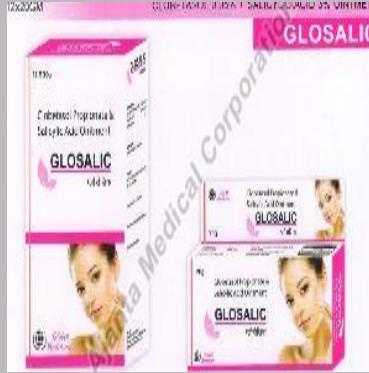
GLOSALIC OINTMENT 20GM