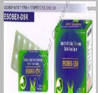
ESOBEX DSR CAP