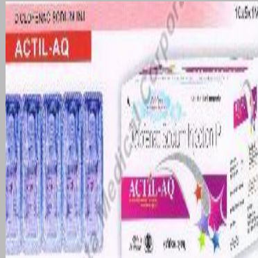
ACTIL AQ 1ML AMP