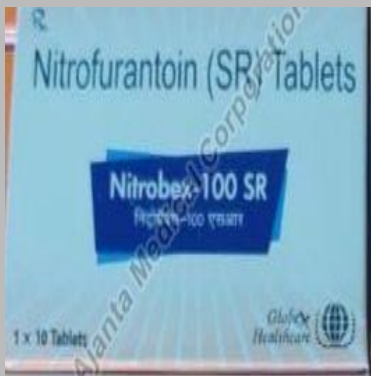
NITROBEX 100 SR TAB