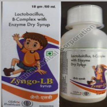
ZYNGO LB SYRUP 60ML