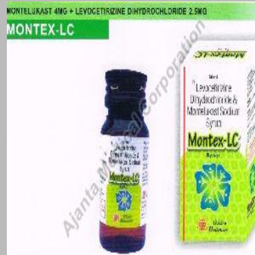
MONTEX LC 30 ML