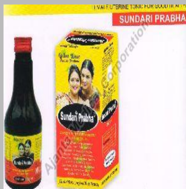
SUNDARI PRABHA 300ML