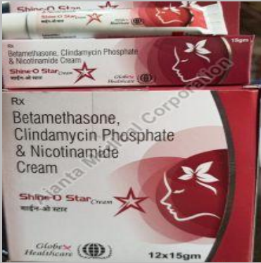
SHINE O STAR CREAM 15 GM