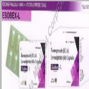
ESOBEX L CAP