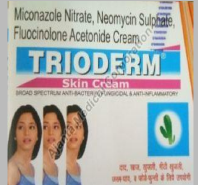
Trioderm Skin Cream