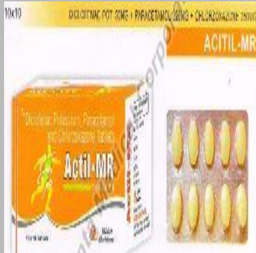
ACTIL MR TAB