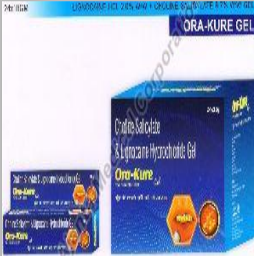
ORA KURE GEL 10GM