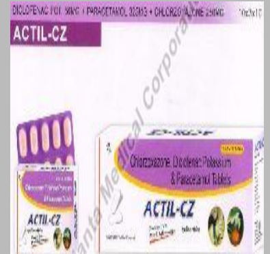
ACTIL CZ TAB