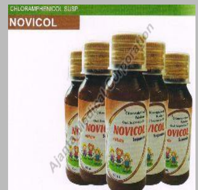
NOVICOL SYRUP 60 ML