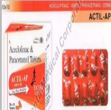
ACTIL AP TABLET

We Ajanta Medical Corporation are a leading and distinguished Manufacturer, Exporter, Supplier, Retailer, Trader, Distributor and Importer of quality Analgesics, Anti fungal & anti bacterial soap, ANTI FUNGAL CREAM, Caps, Hats & Headwears and FAIRNESS + ANTI MARKS CREAM.