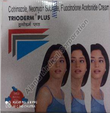
Trioderm Plus Cream