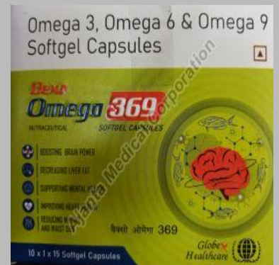
BEXO OMEGA 369 SOFT GEL CAP