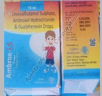
AMBROX LS DROPS 15ML