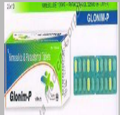
GLONIM P TAB