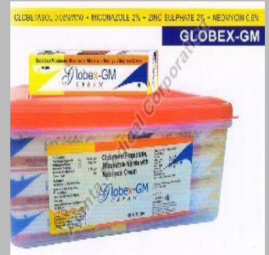
GLOBEX GM 10GM