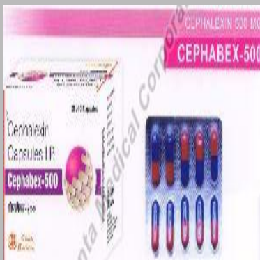
CEPHABEX 500 CAP