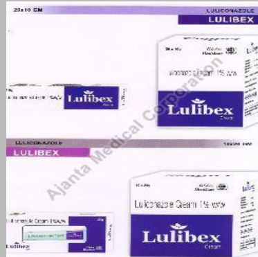
LULIBEX CREAM 10GM/20GM