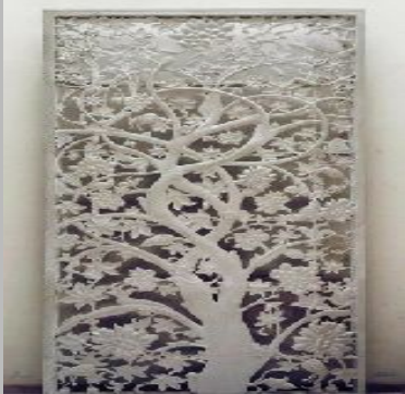
Designer Marble Jali