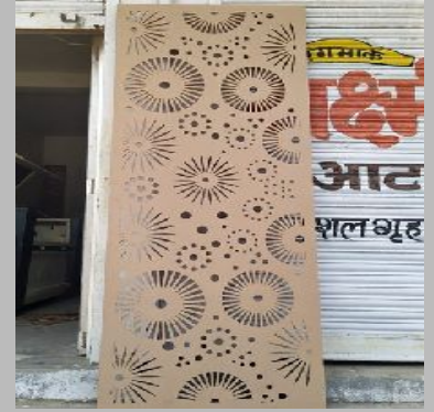
MDF Jali Cutting Services