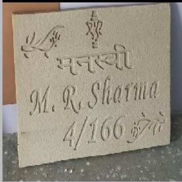
Sandstone Name Plate