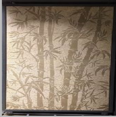
Stone Carved Wall Panel