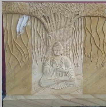
3D stone carving