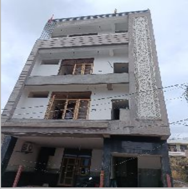
stone cutting services

We Akshita Designing Studio are a leading and distinguished Manufacturer, Exporter, Supplier, Retailer, Trader, Distributor, Importer, Buying House and Service Provider of quality Building Material, Cladding Stone, Cnc and Lathe Machinery, CNC Cutting Services and Construction Services.