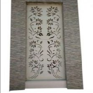
White Sandstone Jali