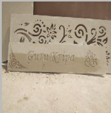
Decorative Sandstone Jali