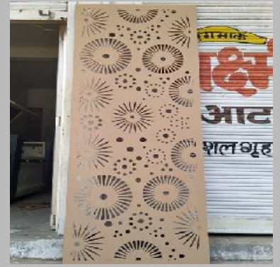
MDF Jali Cutting Services