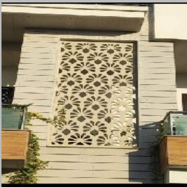
2D Stone Jali