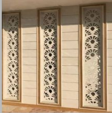
Elevation Stone Jali