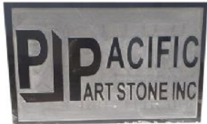
Granite Stone Name Plate