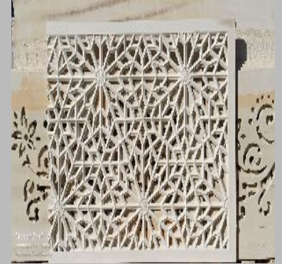
3D Stone Jali