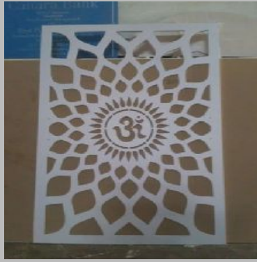
Designer MDF Jali