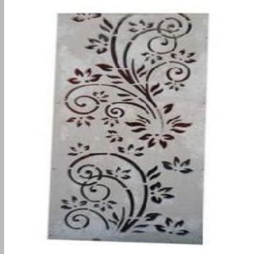
White Marble Jali