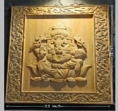
Machine Sawn Sandstone