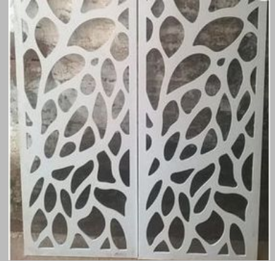
PVC WPC Jali