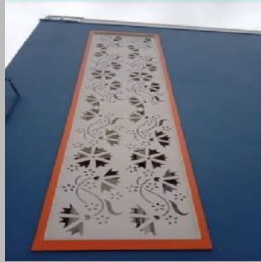
Exterior WPC Jali