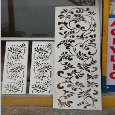
Designer WPC Jali