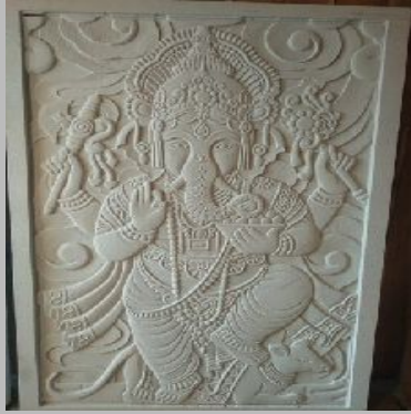
Stone Engraving Services