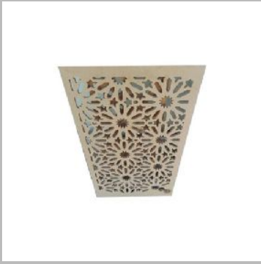
White MDF jali