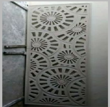
Balcony Sandstone Jali