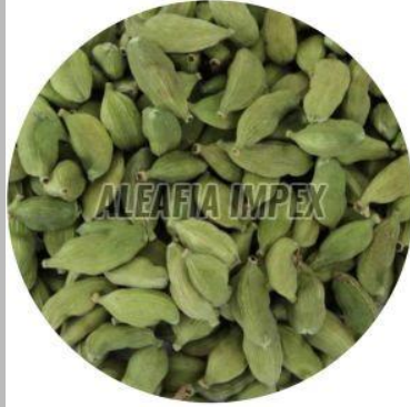
6-7 Mm Green Cardamom