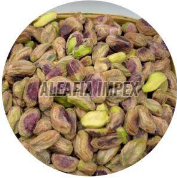
Irani Pistachio Nuts Without Shell