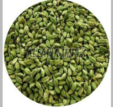
7-8 Mm Green Cardamom