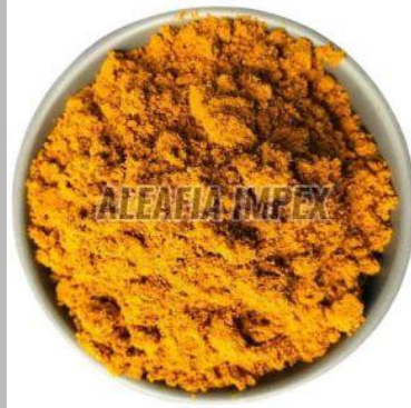
Pav Bhaji Masala