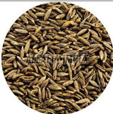
Shahi Cumin Seeds