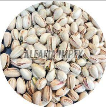
California Pistachio Nuts With Shell