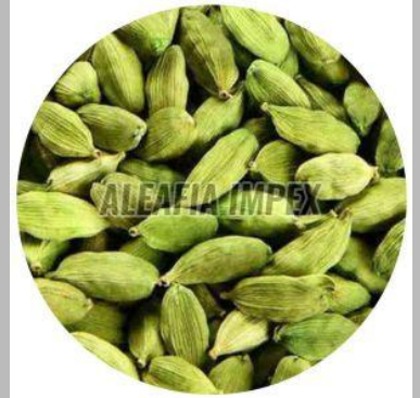
8.5 Mm Green Cardamom