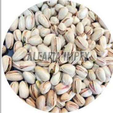
Irani Pistachio Nuts With Shell