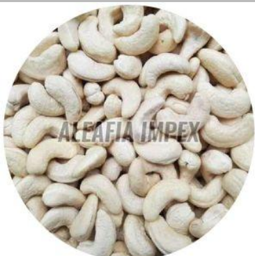
W210 Cashew Nuts