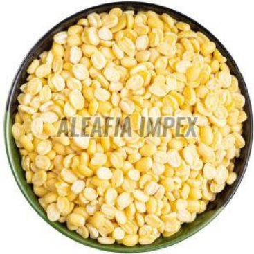
Yellow Moong Dal