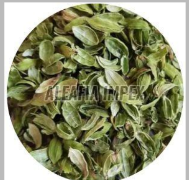
Green Cardamom Husk