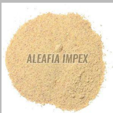
White Pepper Powder