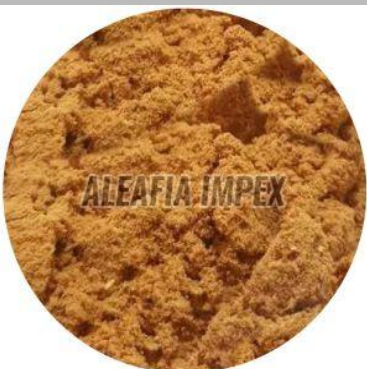
Fish Curry Masala