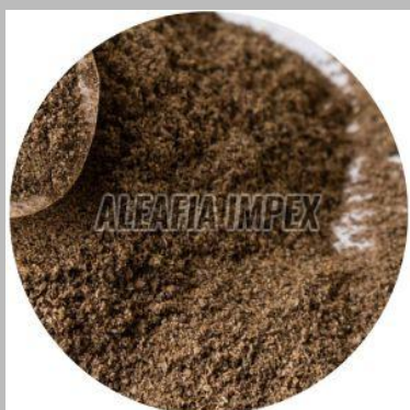
black pepper powder