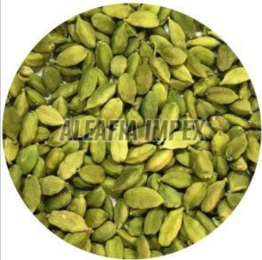
7.5-8.5 Mm Green Cardamom