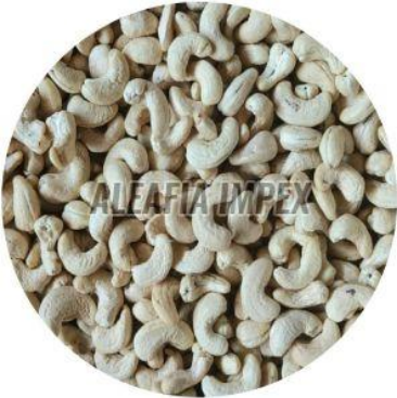
W400 Cashew Nuts