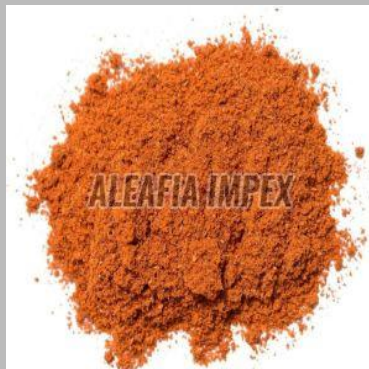
Egg Curry Masala