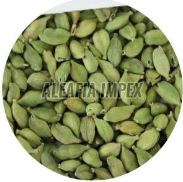
5-6 Mm Green Cardamom

We Aleafia Impex are a leading and distinguished Exporter, Supplier, Trader and Distributor of quality Agricultural Waste, Ajwain, Almond, Almond Nuts and Ayurvedic & Herbal Powders.