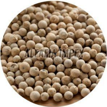
White Pepper Seeds