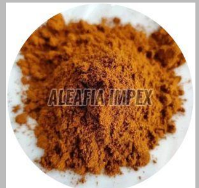
Chicken Curry Masala