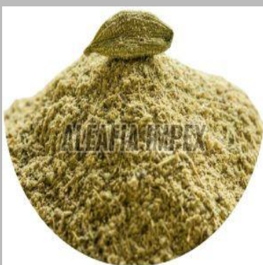
Green Cardamom Powder