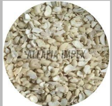
SWP Cashew Nuts