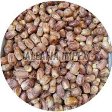
Wet Zahidi Dates