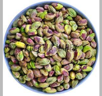
California Pistachio Nuts Without Shell