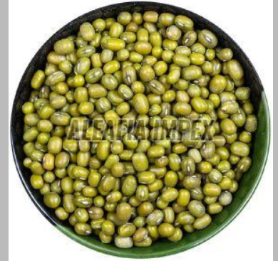
Green Moong Dal