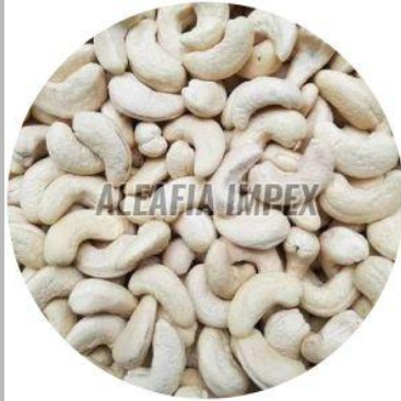
w320 cashew nuts