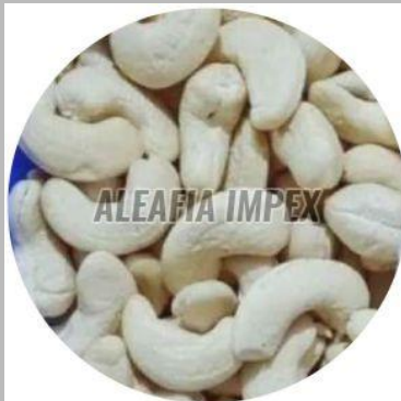
w180 cashew nuts