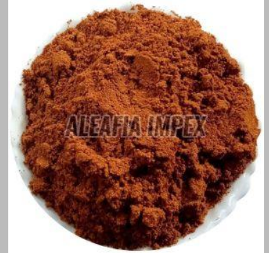
Mutton Curry Masala