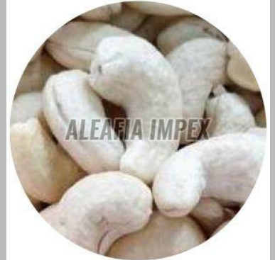
w240 cashew nuts