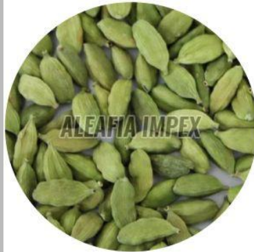
8 Mm Green Cardamom