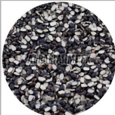
Black Split Urad Dal