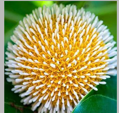
Ruh Kadamb Attar