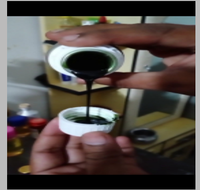
Ruh Khus Attar