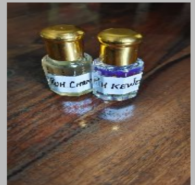
Ruh Kewra Oil