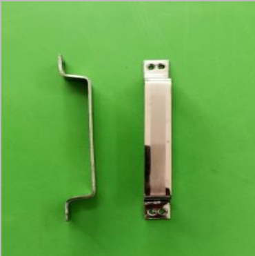
Stainless Steel Handles