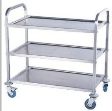
Stainless Steel Trolley