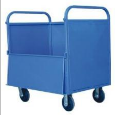
Mild Steel Trolley

We ANM Engineering Work are a leading and distinguished Manufacturer, Exporter, Supplier, Trader and Service Provider of quality Construction Services, Door & Window Fittings, Material Handling Machines & Systems, Metal & Industrial Fabrication and Steel & Steel Products.