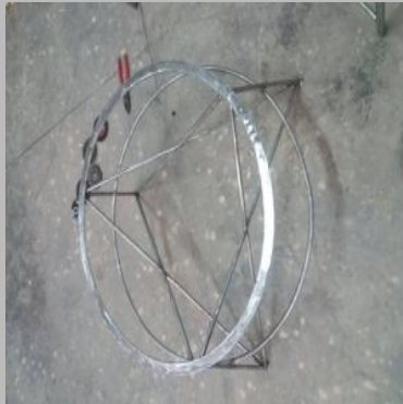
Industrial Fabrication Services