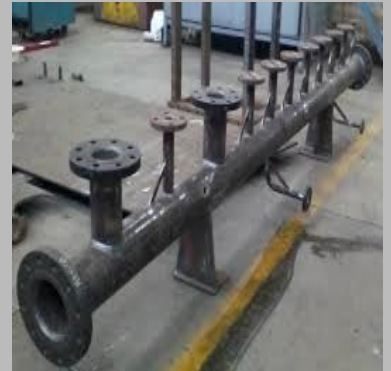
Pipe Fabrication Services