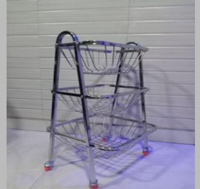
Stainless Steel Pyramid Trolley