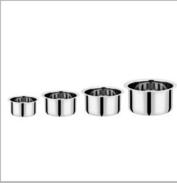
Round Stainless Steel Tope