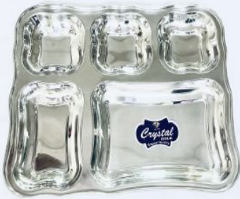
Stainless Steel Zigzag Flower Plate