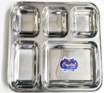
4x1 Square SS Plate