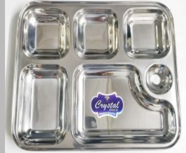
6x1 Square SS Plate