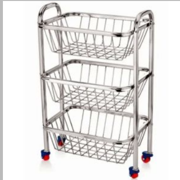
SS Kitchen Multipurpose Trolley