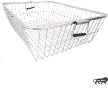
Stainless Steel Square Pipe Square Basket