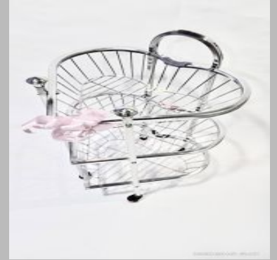
Stainless Steel Heart Shape Trolley Rack