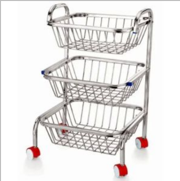
3 Layer Fruit and Vegetable Trolley