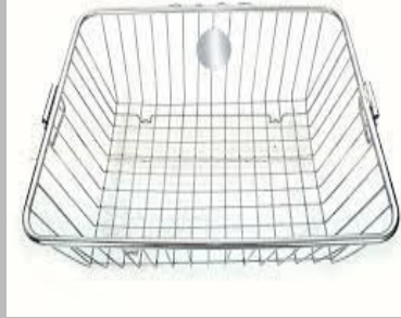
Stainless Steel Round Pipe Square Basket