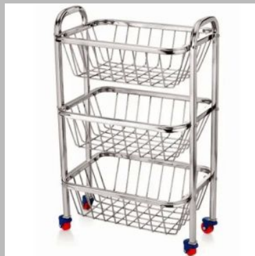
SS Kitchen Multipurpose Trolley