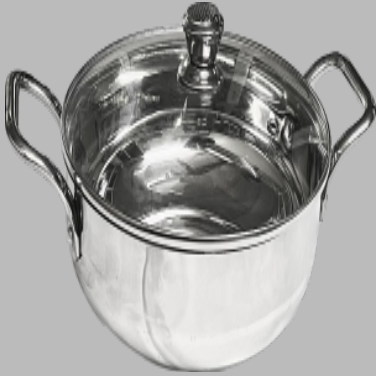
Stainless Steel Kadai with Glass Lid