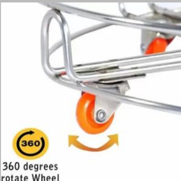
Stainless Steel Cylinder Trolley