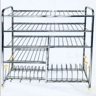
Stainless Steel Kitchen Racks

We Anmol Enterprise are a leading and distinguished Manufacturer, Exporter and Supplier of quality Carts & Trolleys, Cloth Pegs & Hangers, Cooking Range, Cup Holder and Display Racks.