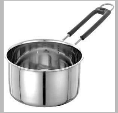
26 Gauge Stainless Steel Sauce Pan