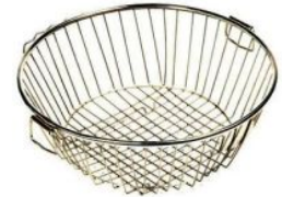
Stainless Steel Round Pipe Round Basket