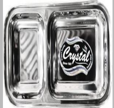
2 In 1 Stainless Steel Plate