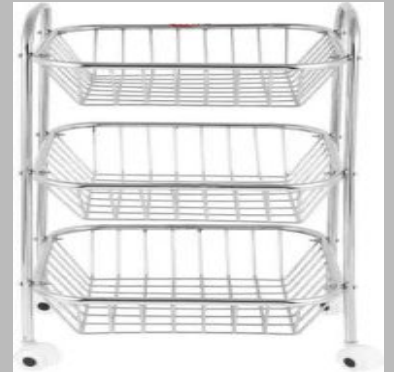
Stainless Steel Square Kitchen Trolley