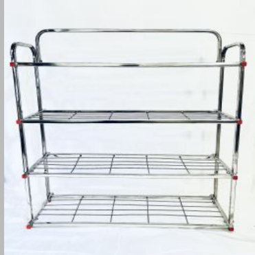
Premium Stainless Steel Shoe Rack