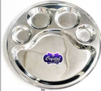
Stainless Steel Smiley Plate