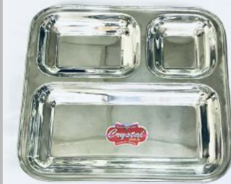
3x1 SS Plate