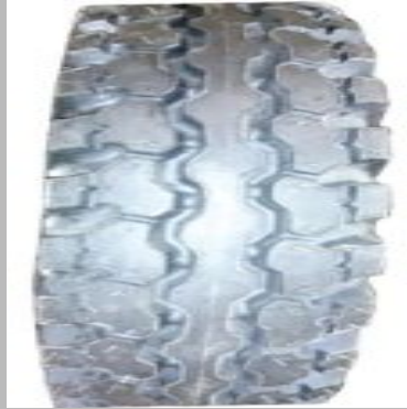
4.00/8 Tuffer Three Wheeler Tyre