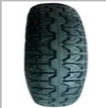
3.75/12 Energy+ E Rickshaw Tyre