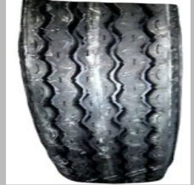
4.00/8 Miller Three Wheeler Tyre