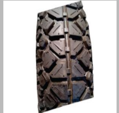
90/90 12 Mile-X Scooter Tyre