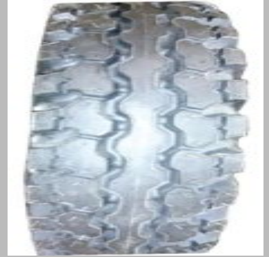
4.00/8 Tuffer Three Wheeler Tyre