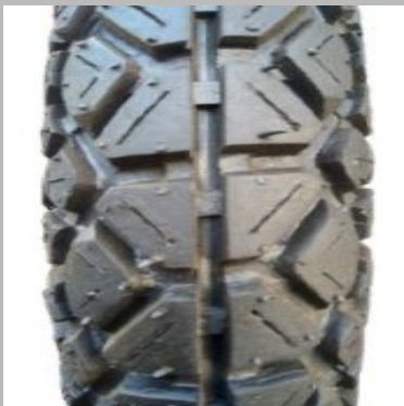
3.75/12 Mile-X E Rickshaw Tyre