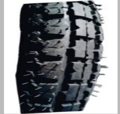
3.00/14 Mileage Bike Tyre