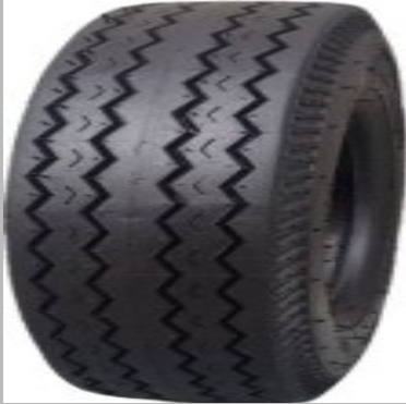
4.50-10 Zipper Three Wheeler Tyre