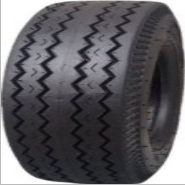
4.50-10 Zipper Three Wheeler Tyre

We AMSTRONG are a leading and distinguished Manufacturer and Supplier of quality Commercial Vehicle Tyre, Electric Motorcycle Part, Scooters and Two Wheeler Tyre.