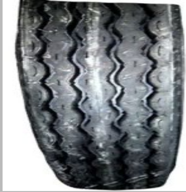
4.00/8 Miller Three Wheeler Tyre