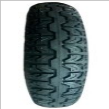
3.75/12 Energy+ E Rickshaw Tyre