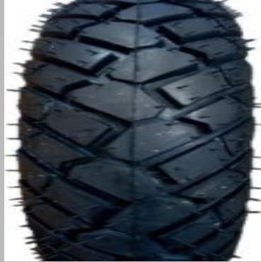
90/100-10 TL Gripwell Bike Tyre