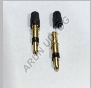
Brass High Pressure Inner Valve