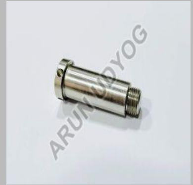
Stainless Steel Studs