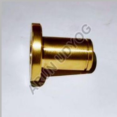
Brass Plain Bush