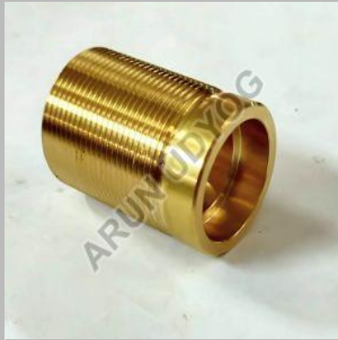
Brass Threaded Bush