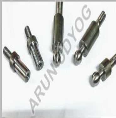
Mild Steel Studs