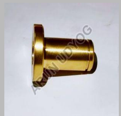
Brass Plain Bush