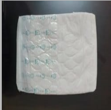
Loose Adult Diaper