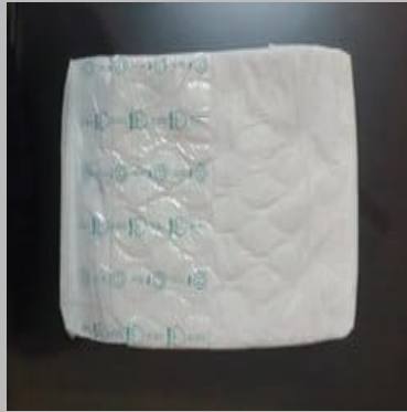
Loose Adult Diaper