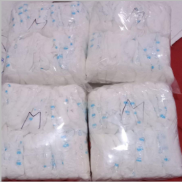
Unisex White Disposable Adult Diaper