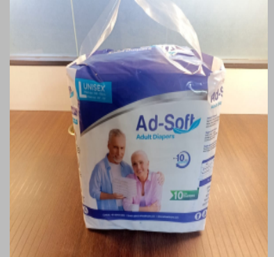
Ad-Soft Adult Diaper