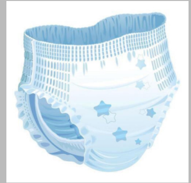
Disposable Baby Diaper