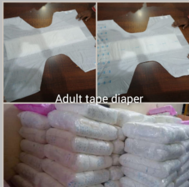
Adult Tape Diaper