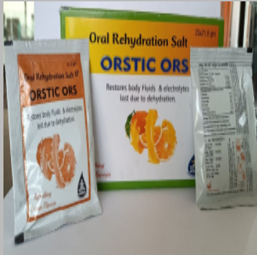
ORS Powder Sachet