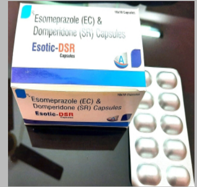
Esomeprazole Domperidone Capsule