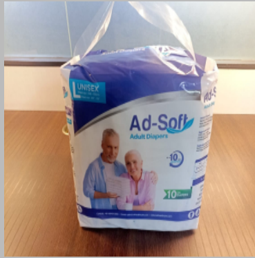
Ad-Soft Adult Diaper