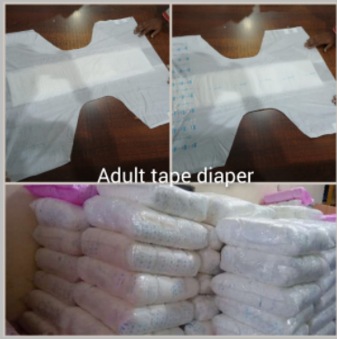
Adult tape diaper