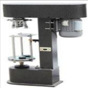
Metal Locking Capping Machine