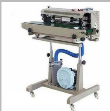
Air Flushing Continuous Band Sealing Machine