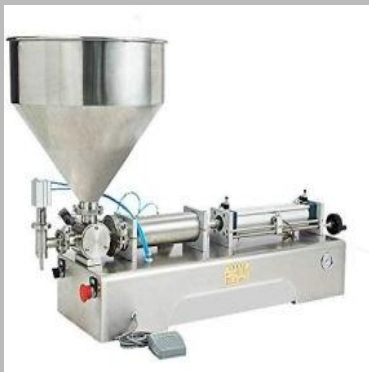
Paste Filling Machine