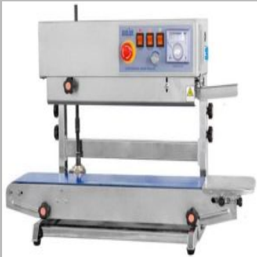
Vertical Continuous Band Sealing Machine