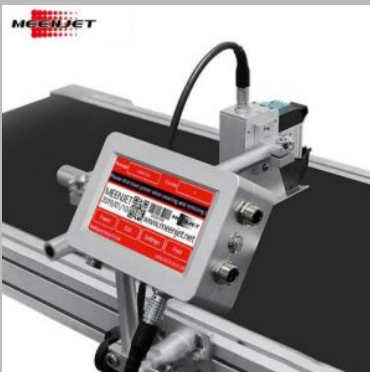
Industrial Online Inkjet Printer