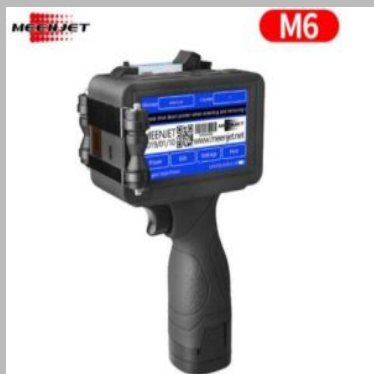
M6 Handheld Thermal Inkjet Printer

We AV Technologies are a leading and distinguished Exporter, Supplier, Manufacturer, Trader, Distributor and Importer of quality Band Sealer, Batch Coding Machine, Conveyors & Conveyor Components, Granule Packing Machine and Hand Trucks.