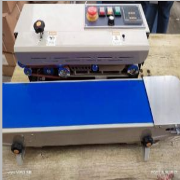
continuous band sealers