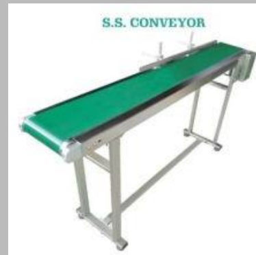
flat belt conveyor