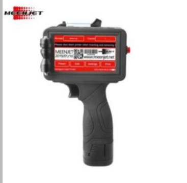
M7 Handheld Thermal Inkjet Printer