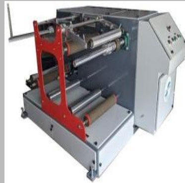
Doctoring Rewinding Machine