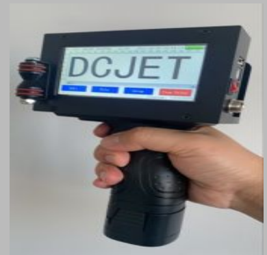
Handheld Inkjet Printer