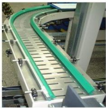
Stainless Steel 304 Slat Chain Conveyor