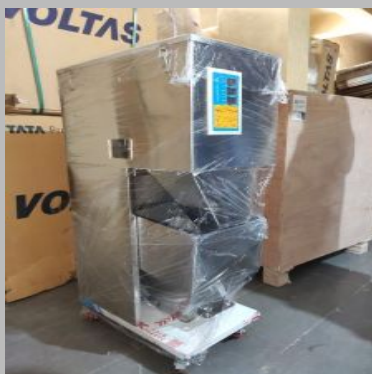
Automatic Granule Filling Machine