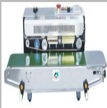
Continuous Band Sealer With Nitrogen Flash