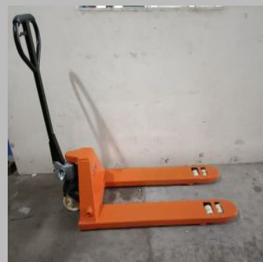
hand pallet truck