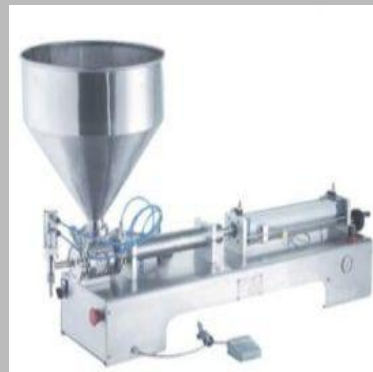
Cream Filling Machine