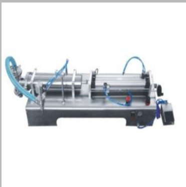
Single Head Liquid Filling Machine