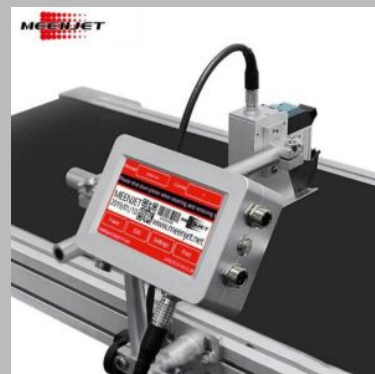
Industrial Online Inkjet Printer