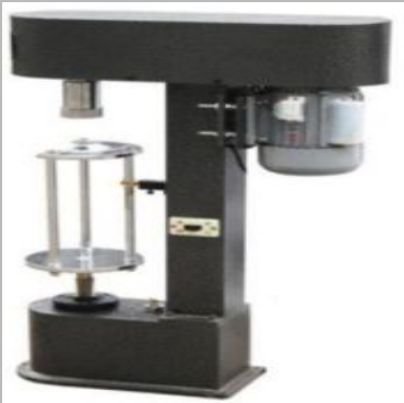
Plastic Locking Capping Machine