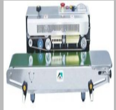
Continuous Band Sealer With Nitrogen Flash