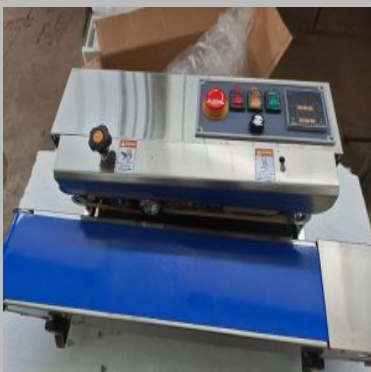
band sealing machine