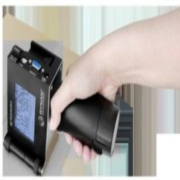
Ryan B1040h Handheld Inkjet Printer