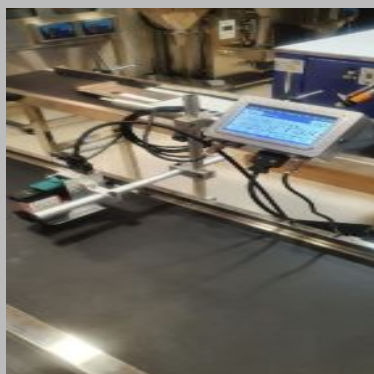
Mx0 Inkjet Batch Coding Machine Meenjet