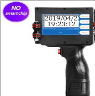
Handheld Thermal Inkjet Printer