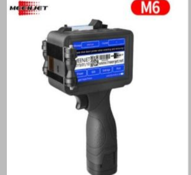
M6 Handheld Thermal Inkjet Printer