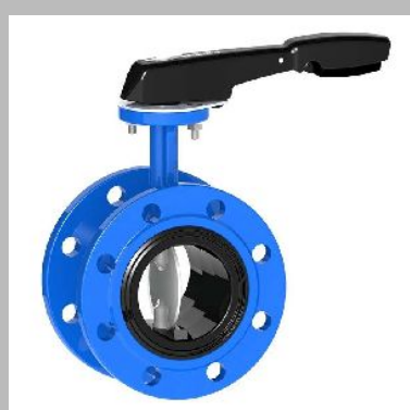
Double Flange Wafer Type Damper Butterfly Valve