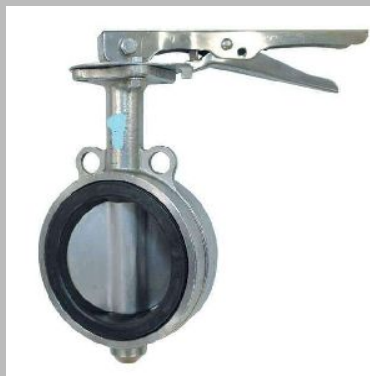
Investment Casting Butterfly Valve