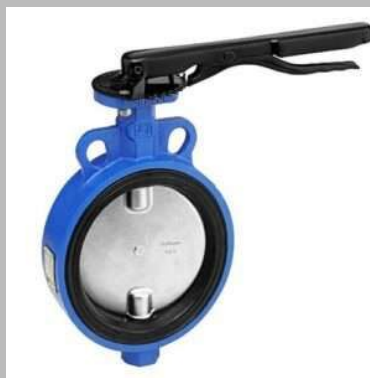
Moulded EPDM Seat Butterfly Valve