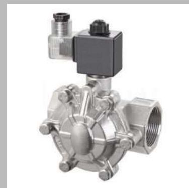
Pneumatic Solenoid Valve