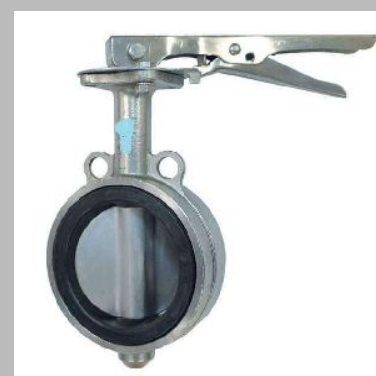
Investment Casting Butterfly Valve