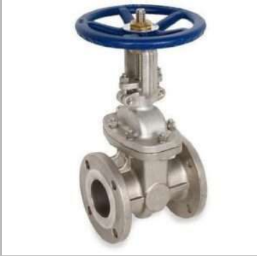
IC Class 150 Bolted Bonnet Gate Valve