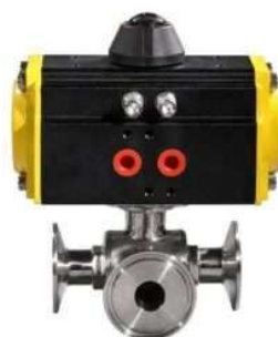
Pneumatic Actuator TC END Ball Valve