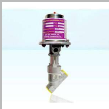
Pneumatic Y Type Control Valve