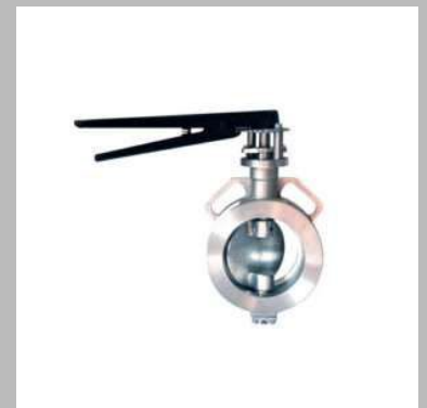
Wafer Type Spherical Disc Butterfly Valve