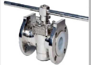
ptfe teflon plug valves