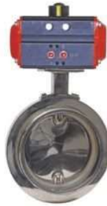
Stainless Steel Pneumatic Actuated Butterfly Valve