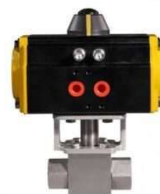
Pneumatic Actuator High Pressure Ball Valve