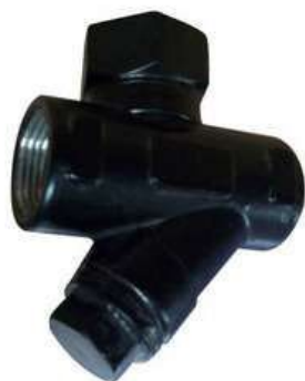
Thermodynamic Steam Trap