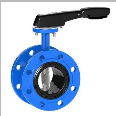
Double Flange Wafer Type Damper Butterfly Valve