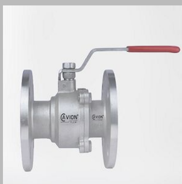
ss ball valves