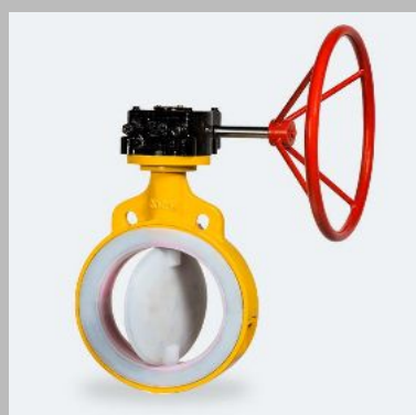
PTFE/Teflon Butterfly Valve