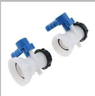
Avion IBC Tank Butterfly Valve

Avion Valves & Pneumatics is known as top Manufacturer, Exporter and Supplier of best Ball Valves, Butterfly Valves, Compression Molded Rubber, Coupling and Electric Motors & Components.