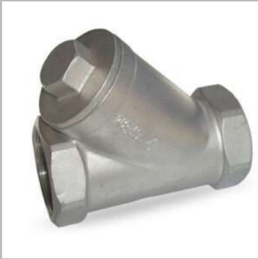
Y Type Strainer Screw End