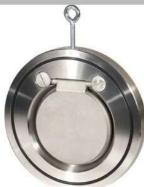
Stainless Steel 304 Wafer Check Valve