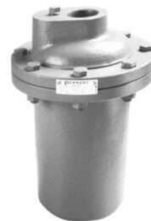
Vertical Inverted Bucket Type Steam Trap