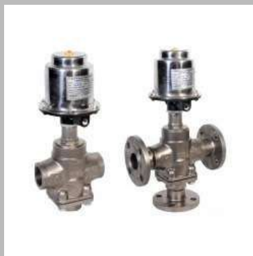
Pneumatic Straight Type Control Valve