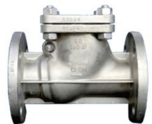
I.C Non Return Class 150 Swing Type Check Valve