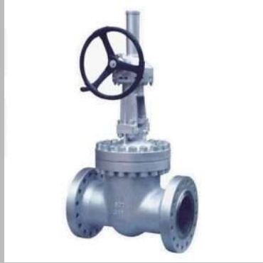
Class 1500 Bolted Bonnet Flanged Gate Valve