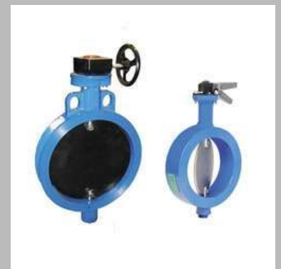
Wafer Type Damper Butterfly Valve