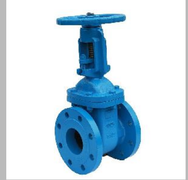
Class 125 Bolted Bonnet Gate Valve