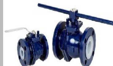
PTFE/Teflon Ball Valves