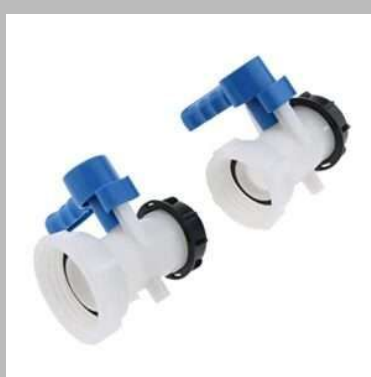
Avion IBC Tank Butterfly Valve