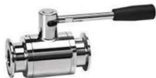
TC END Ball Valve