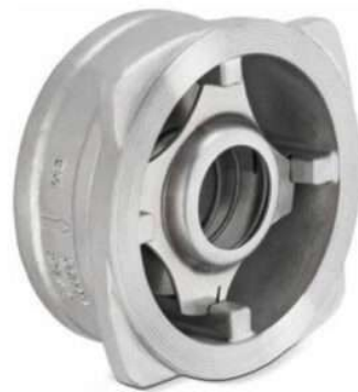
Non Slam Disc Check Valves