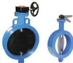
Wafer Type Damper Butterfly Valve