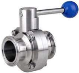
Stainless Steel TC END Butterfly Valve