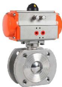
Pneumatic Actuator Wafer Type Ball Valve