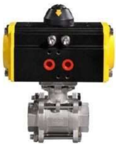
Pneumatic Actuator Operated Ball Valve