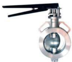
Wafer Type Spherical Disc Butterfly Valve