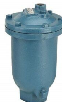
Single Air Valve