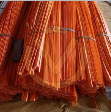
PVC Double Beadings