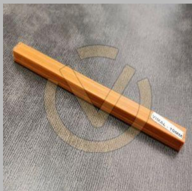
10 Mm PVC Square Furniture Profile