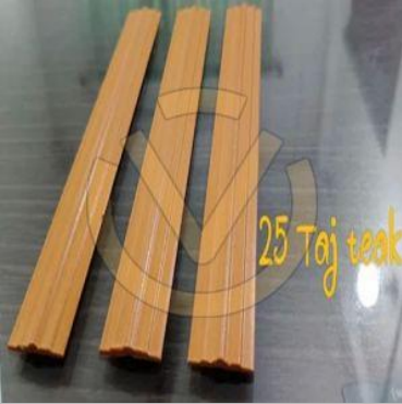
PVC Taj Beadings