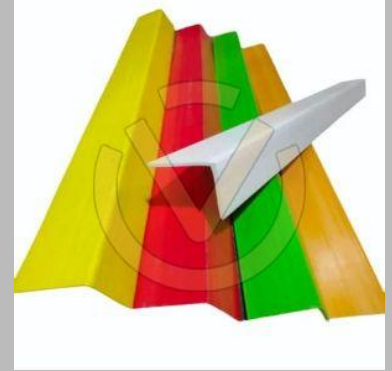
PVC Extruded Profile