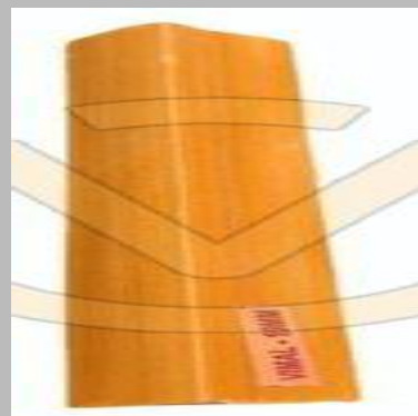
19 Mm PVC Corner Profile