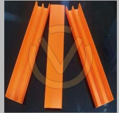
PVC E Channels