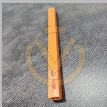
8 Mm PVC Square Furniture Profile