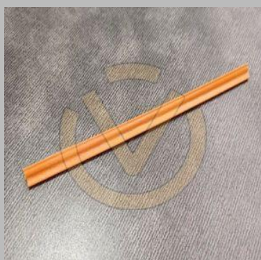
6 Mm PVC Corner Profile