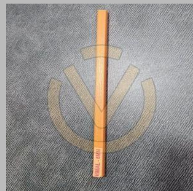
12 Mm PVC Square Furniture Profile