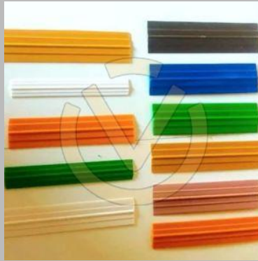
PVC Patti Channels