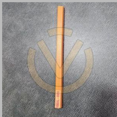
12 Mm PVC Square Furniture Profile