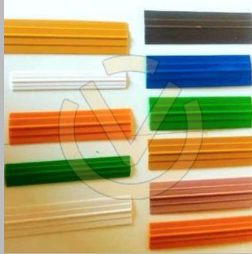
PVC Flat Beadings