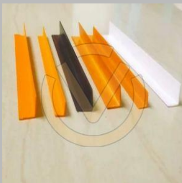
PVC Corner Angles