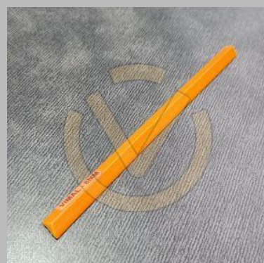
8 Mm PVC Corner Profile