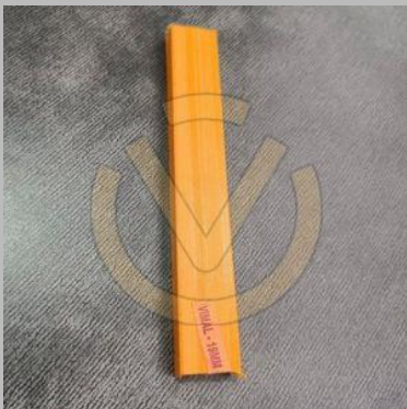
PVC Double Channels