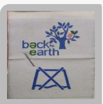
Damask Woven Cloth Label