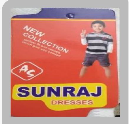
Hard Paper Garment Hang Tag