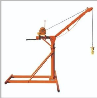
Monkey Hoist Lift Machine