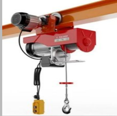
Damar Mini Electric Wire Rope Hoist