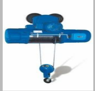
9 Meter Electric Wire Rope Hoist