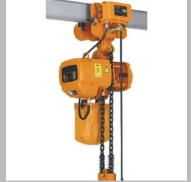
Electric Chain Hoist