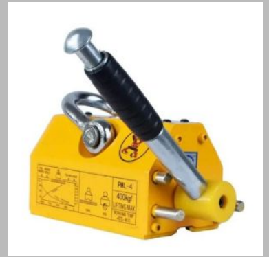
Permanent Magnetic Lifter