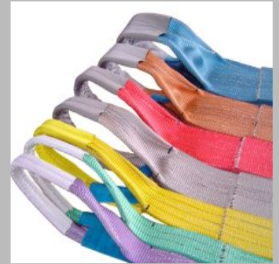
Lifting Belt Duplex Polyester Webbing Sling