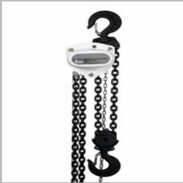
Manual Chain Pulley Block