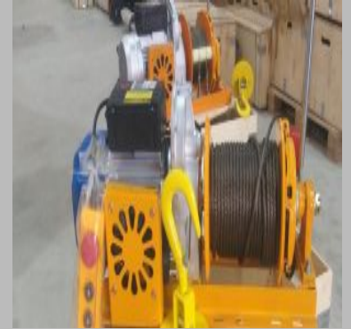
electric mini winch