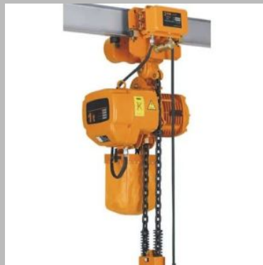
Electric Chain Hoist