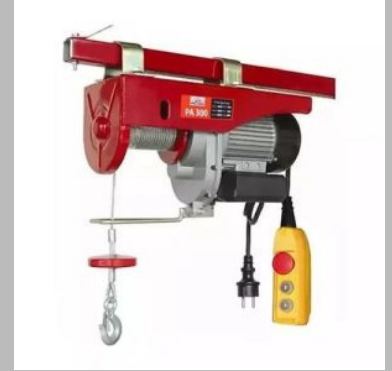
4mm Mini Electric Hoist