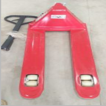
Hand Pallet Truck , For Material Handling

Bajrangi Sales is known as top Exporter, Supplier, Retailer, Trader, Distributor, Importer, Buying House and Manufacturer of best Belts, Chain Blocks, Clamps, Clamps and Clamping Equipment and Connecting Joint.