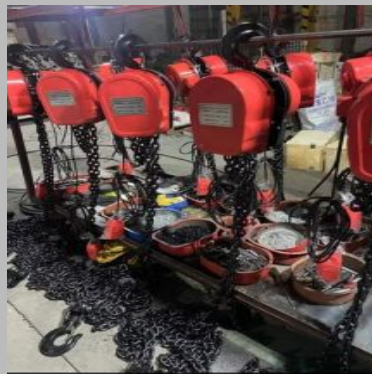
DHY Electric Chain Pulley Block