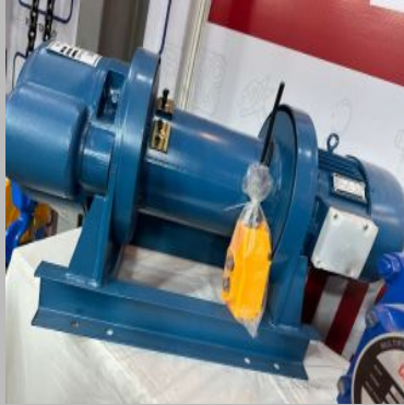
electric winch machine without wire rope