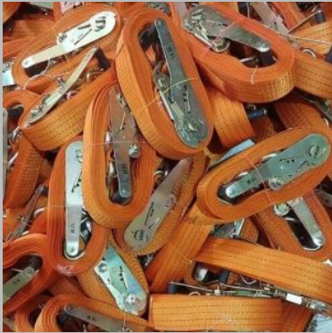
Ratchet Lashing Assembly