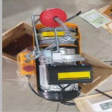
electric min wire rope hoist