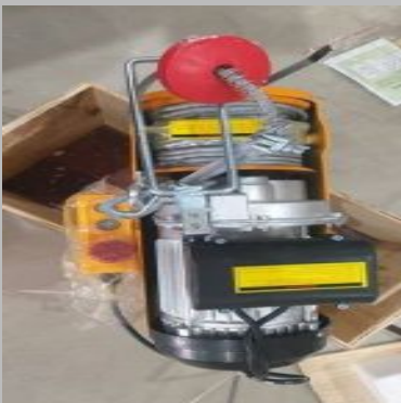
20 Meter Mini Electric Hoist