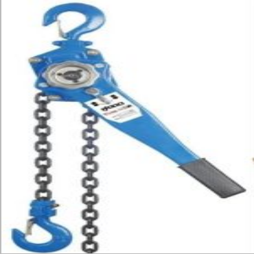
Ratchet Heavy Lever Hoist