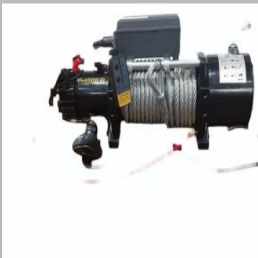
Electric DC Jeep Winch Machine