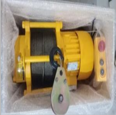
KDC Electric Winch