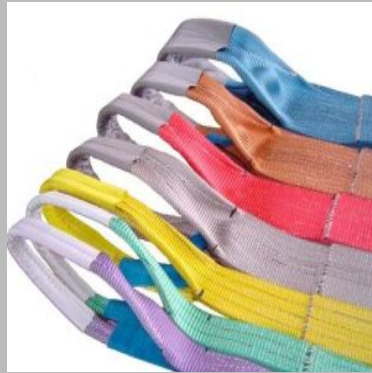
Lifting Belt Duplex Polyester Webbing Slings