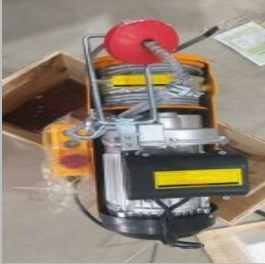
Electric Wire Rope Hoist 2TON