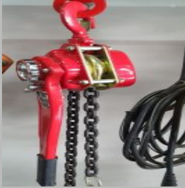
ratchet lever hoist