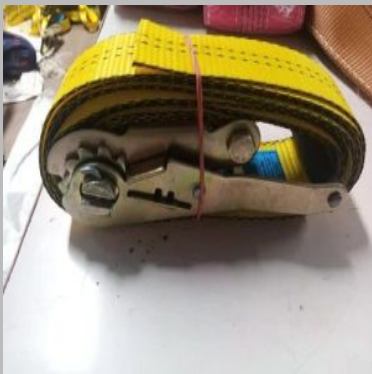
Havi Duty Ratchet Lashing Belt