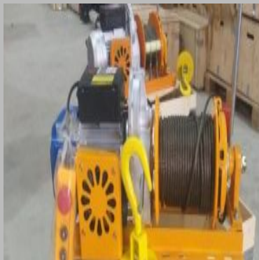
Bajrangi Heavy Duty Electric Winch with Clutch