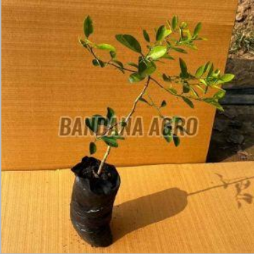
Well Watered Lime Plant