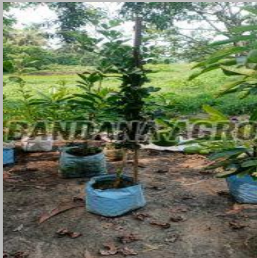
Batabi Lemon Plant