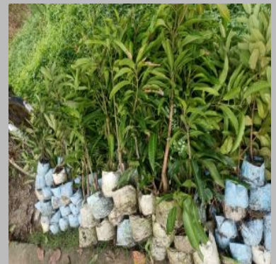
Mango Fruit Plant