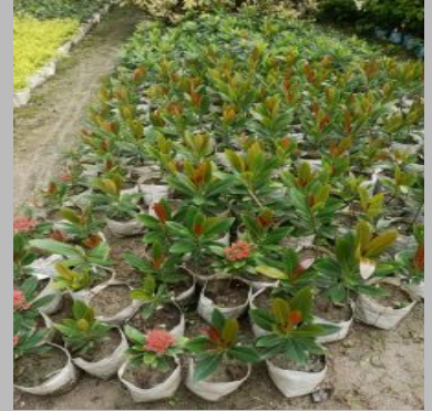
First Love Flower Plants