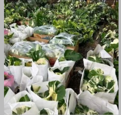
Variegated Monstera Plant