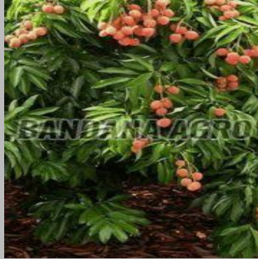
Sweet Litchi Plant