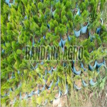
Green Thuja Plant