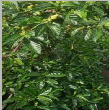
Noni Fruit Plant