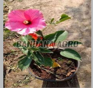
Pink Hibiscus Flower Plant