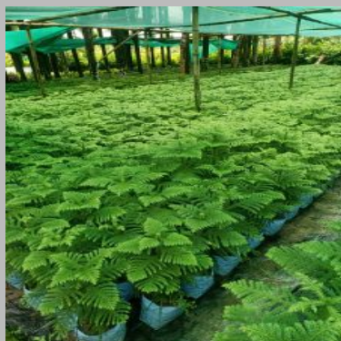
Araucaria Christmas Plant