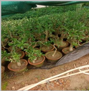
Adenium Flower Plant