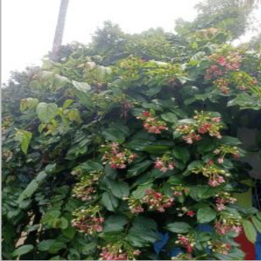
Madhu Malti Plant