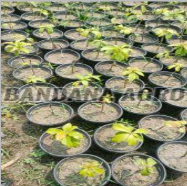
Avocado Fruit Plant