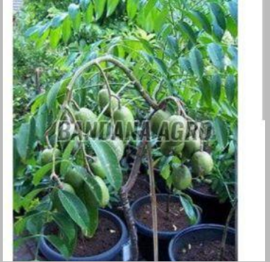
Sweet Lime Plant