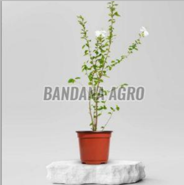
White Hibiscus Flower Plant