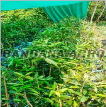
Black Jamun Plant

We Bandana Agro are a leading and distinguished Manufacturer, Supplier, Retailer, Trader and Distributor of quality Decorative Plants, Decorative Pot, Flowering Plants, Fresh Flowers and Plants and Fruit Plants.