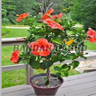
Red Hibiscus Flower Plant