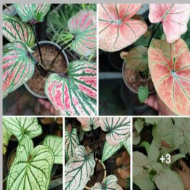
Sale Post Caladium Plants