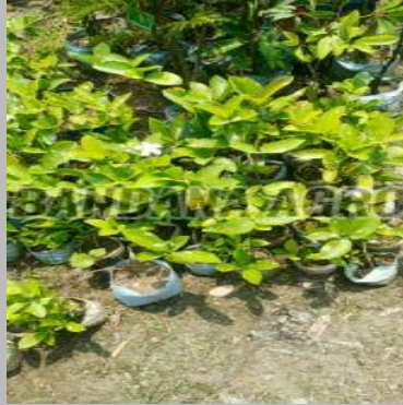
Jasmine Flower Plant