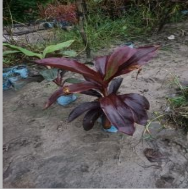
Dracaena Rosia Plants