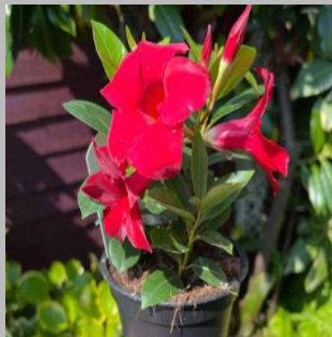
Mandevilla Flower Plants