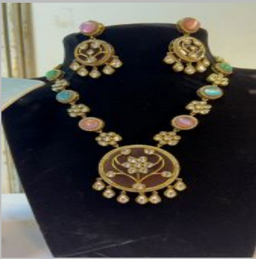
Thewa Jewellery Sets