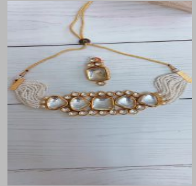
Kundan Imitation Necklace Set