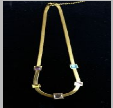
Fancy Artificial Chain