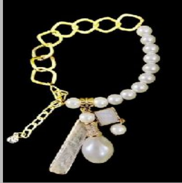
Handcrafted Pearls Bracelet