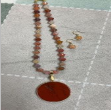
Semi Precious Stone Jewelry Set