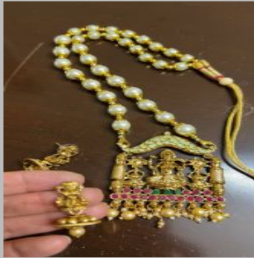
Temple Jewellery Set