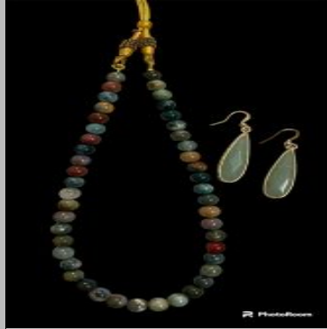
Semi Precious Stones Jewellery Set