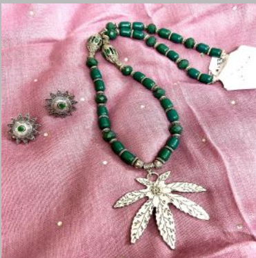
Maple Leaf Necklaces Set