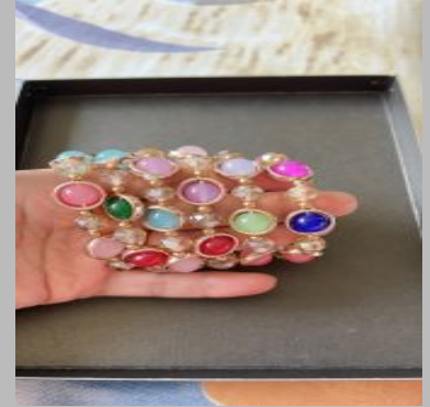
Fashion Beaded Bracelets