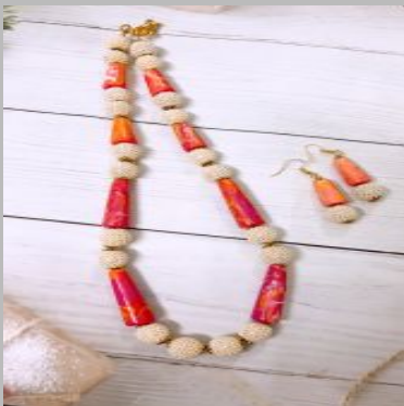
Designer Fashion Jewellery Set