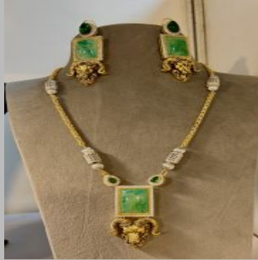
Sabyasachi Inspired Necklace Set