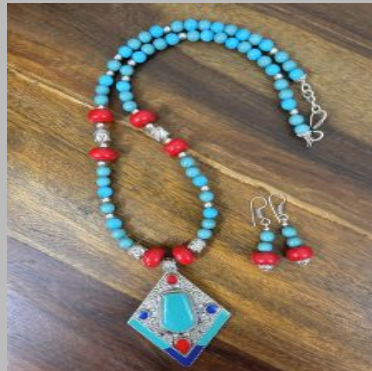
Green and blue necklace set