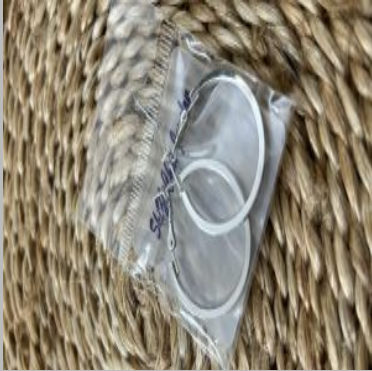
Stylish Silver Hoop Earring Set