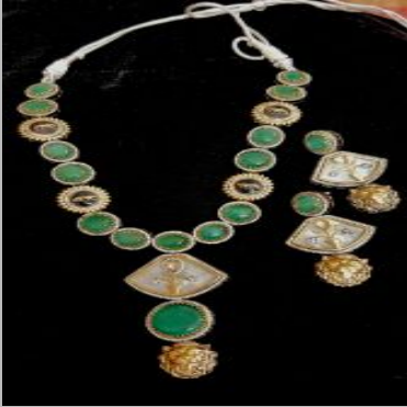
Sabyasachi Inspired Stone Engraved Necklace Set