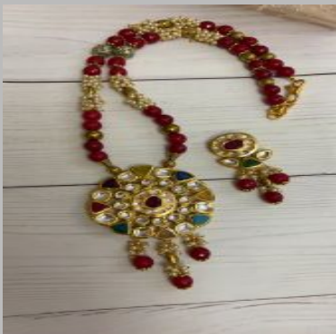
Navratan Jewelry Set