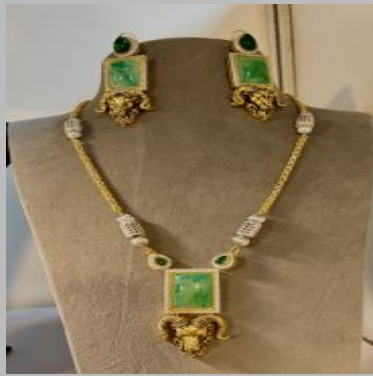
Sabyasachi Inspired Necklace Set