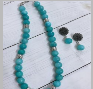
Agates Necklace Set