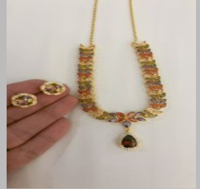
Multicolour Traditional Necklace Set