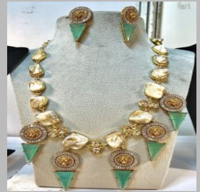
Sabyasachi Inspired Necklace Sets