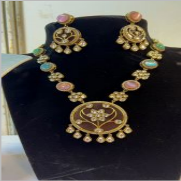
Thewa Jewellery Sets