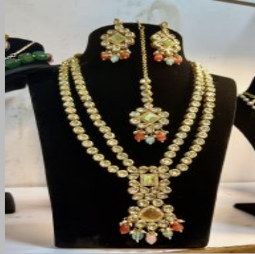
Gold Plated Rani Haar