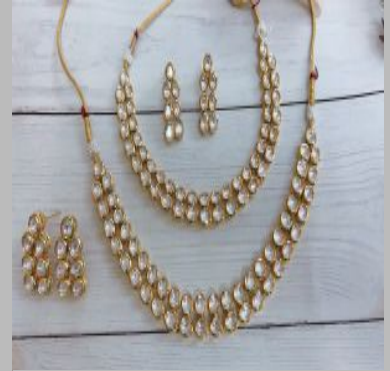
Kundan Choker Necklace Set