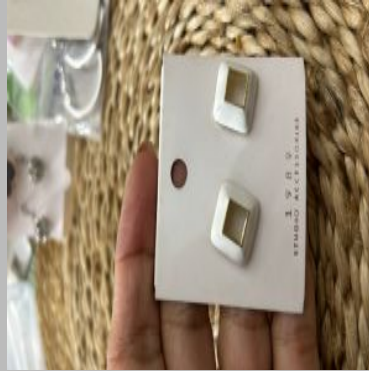
White Fashion Ear Tops Set