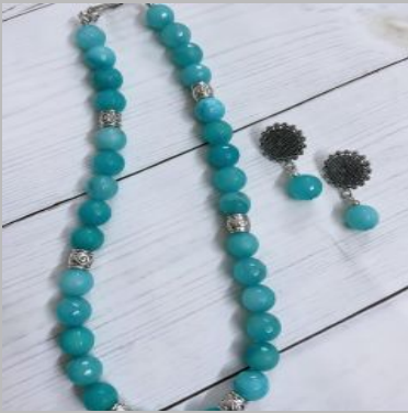
Agates Necklace Set

Beads & Beauty is known as top Retailer and Supplier of best Artificial Earrings, Artificial Jewelry, Beaded Necklace, Beads and Bracelet.