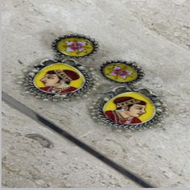
Raja Rani Earring Set