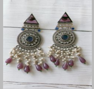
Big Hanging Earring Set