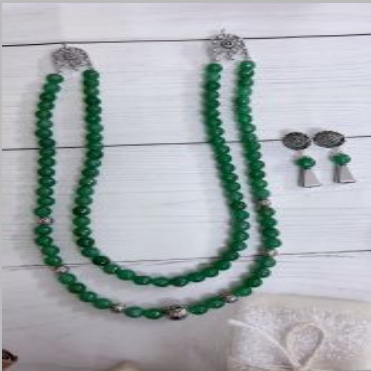
Green Agate Necklace Set