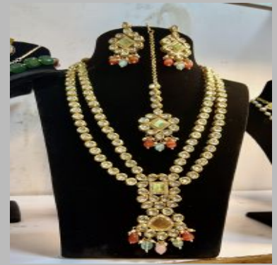
Gold Plated Rani Haar