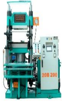
BLY 2424G Rubber Molding Machine