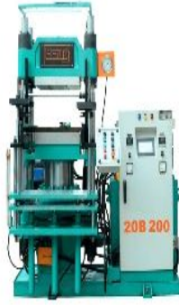
BLY 2424H Rubber Molding Machine