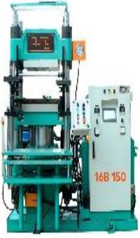
Rubber Press Machine