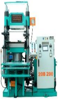
BLY 2424F Rubber Molding Machine