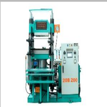
BLY 1212D Rubber Molding Machine