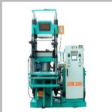
BLY 1616A Rubber Molding Machine