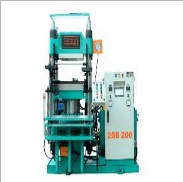
BLY 1212A Rubber Molding Machine

Bently Rubmech Engineering is known as top Manufacturer, Supplier, Exporter, Retailer and Trader of best Hydraulic Machines, Molding Machines, Pharmaceutical Machines & Equipment, Pressing Machine and Rubber Processing Machinery.