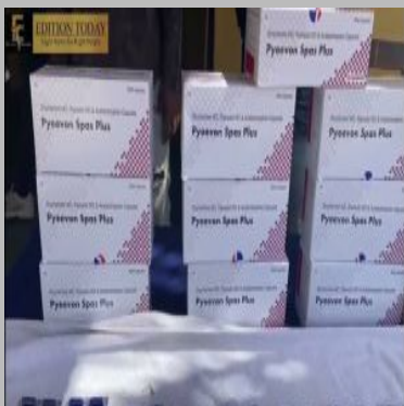
Pyeevon Spas Plus Capsules