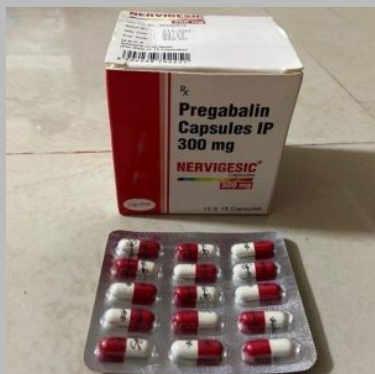
Pregabalin 300mg Capsule