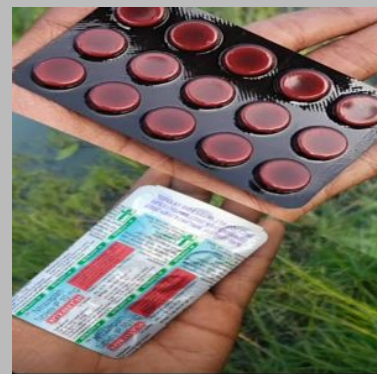
Nitravet 10 Tablet