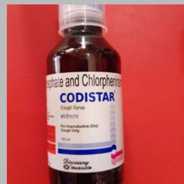
Codistar Codiene Phosphate