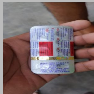
Tapal 100mg Tablet