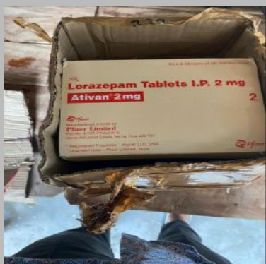
Ativan 2mg Tablets