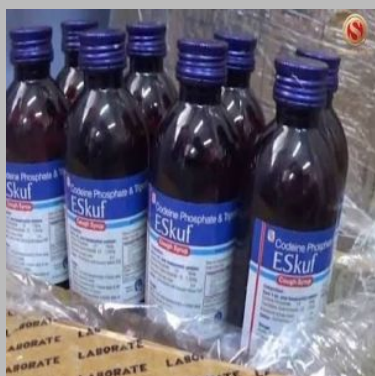
Escuff Cough Syrup