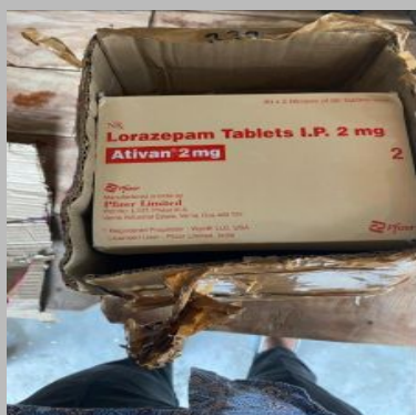
Ativan 2mg Tablets