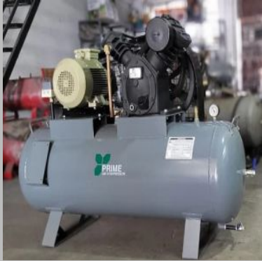
Two Stage Air Compressor