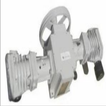
Reciprocating Oil Free Compressor