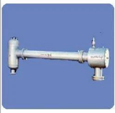
Compressor After Cooler