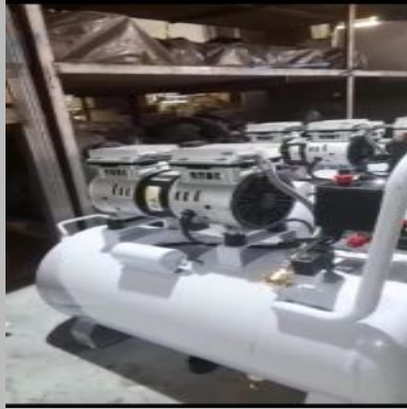
Oil Free Compressor