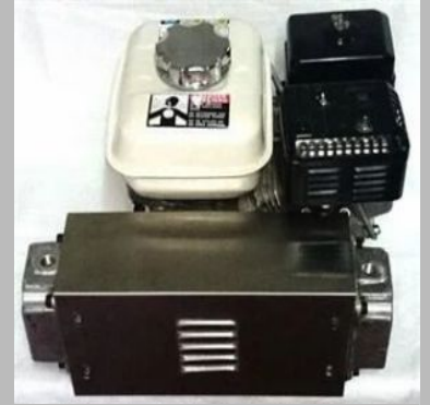
Engine Driven Oil Free Compressor