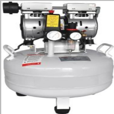
Dental Air Compressors