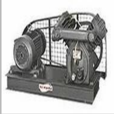
Single Stage Air Compressor