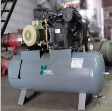
Two Stage Air Compressor