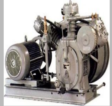
Multi Stage High Pressure Compressor