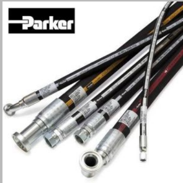
parker hose pipe