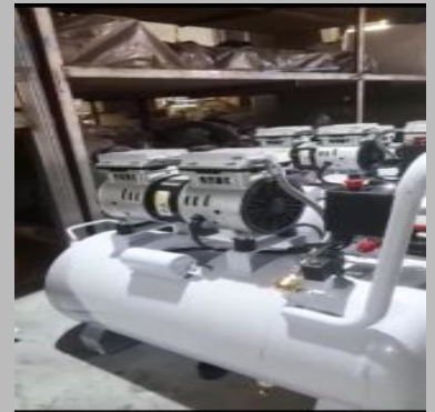
Oil Free Compressor