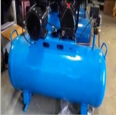
reciprocating air compressor