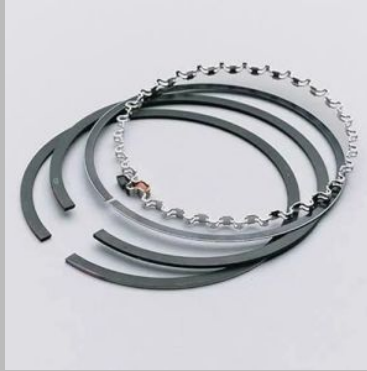
Compressor Piston Rings