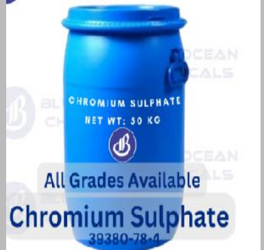
Basic Chromium Sulphate