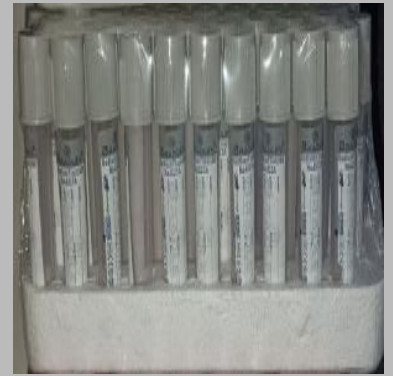
Sodium Fluoride Tube