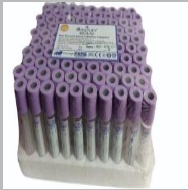
Vacuum Blood Collection Tube