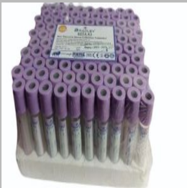
Non Vacuum Blood Collection Tube