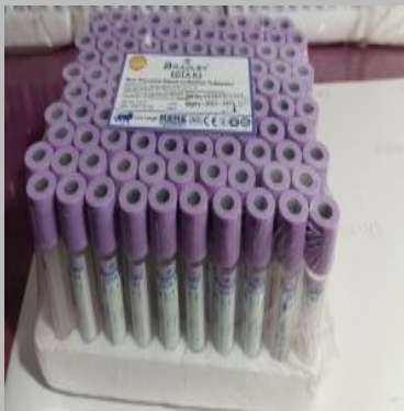
vacuum blood collection tubes