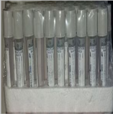
Sodium Fluoride Tube