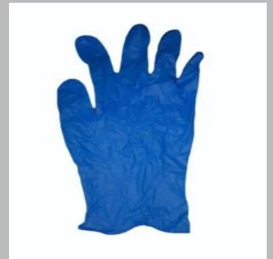
Blue Nitrile Gloves