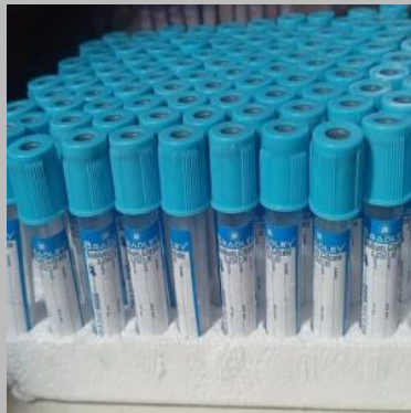
Sodium Citrate Tube