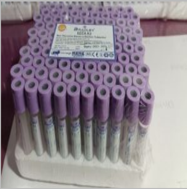
vacuum blood collection tubes