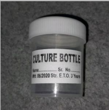
Cell Culture Bottle