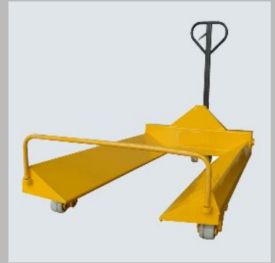
Reel Pallet Truck