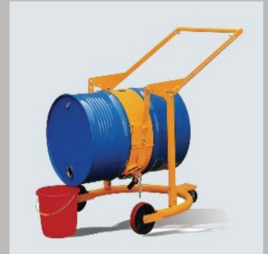
Drum Carrier Cum Tilter