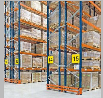
Heavy Duty Pallet Rack