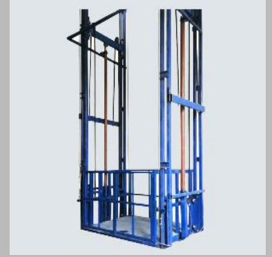
Double Mast Goods Lift