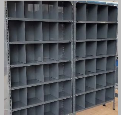
Pigeon Hole Rack