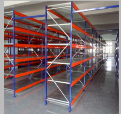
heavy duty racks