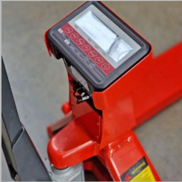
Weighing Scale Pallet Truck