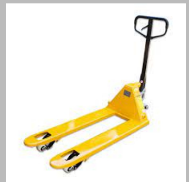
hand pallet trucks