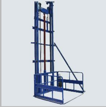
Wall Mounted Goods Lift