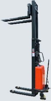
Semi Electric Stacker