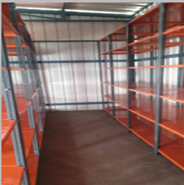
Iron Storage Rack