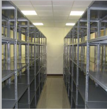
iron slotted angle rack