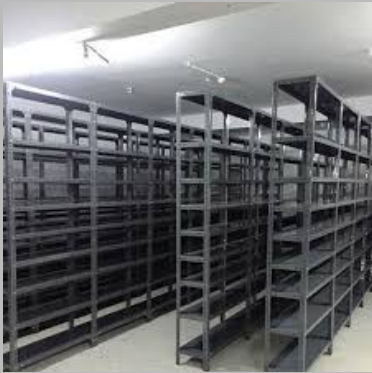
Slotted Angle Racks