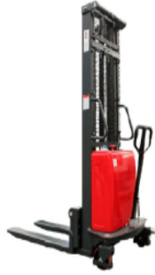
Semi Electric Hydraulic Stacker