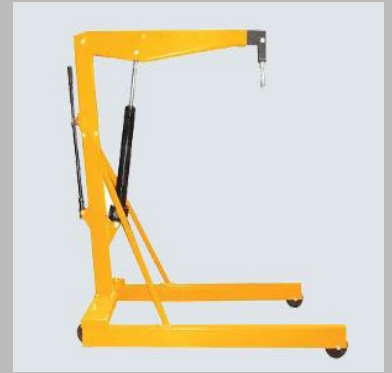
Manual Mobile Floor Crane