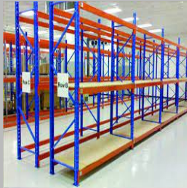
heavy duty steel rack