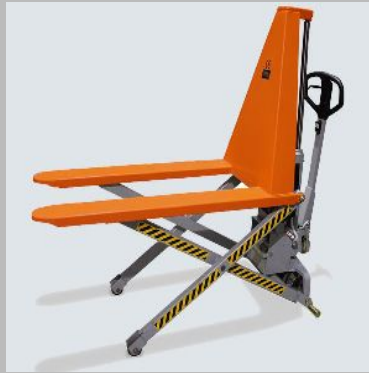
Scissor Lift Pallet Truck