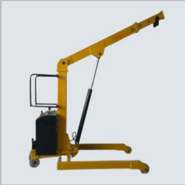
Semi Electric Floor Crane