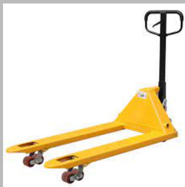
Hydraulic Hand Pallet Truck