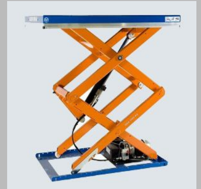
Scissor Lift Table