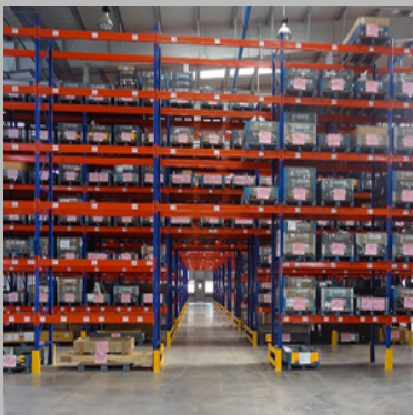
Heavy Duty Rack