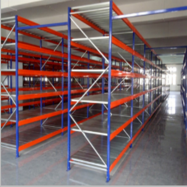
heavy duty racks

We Brightway Engineers are a leading and distinguished Manufacturer, Supplier, Exporter, Retailer, Trader, Distributor and Importer of quality Automotive Spare Parts, Drum Handling Equipment, Electric Stacker, File Racks and Goods Lift.