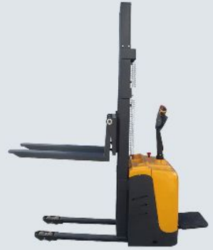
Fully Electric Stacker