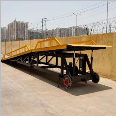
Mobile Dock Ramp