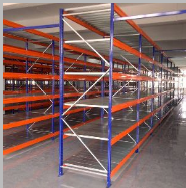
Heavy Duty Panel Rack