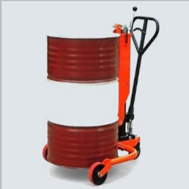
Hydraulic Drum Carrier