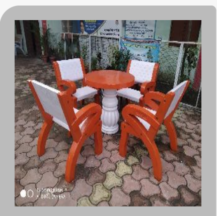
rcc precast bench