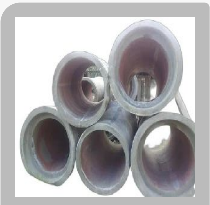
600mm NP2 RCC Hume Pipe