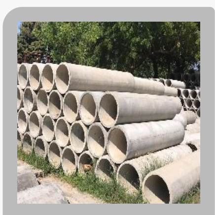
rcc hume pipes