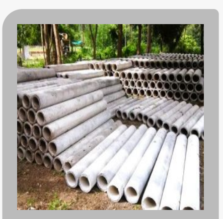
150 MM NP2 Plain End RCC HUME PIPE