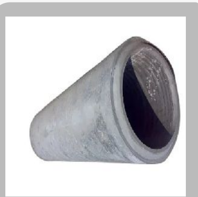
600mm NP3 RCC Hume Pipe