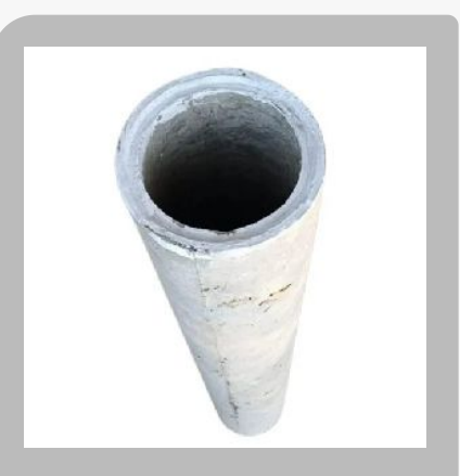
300mm NP3 RCC Hume Pipe