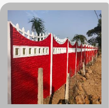
precast compound wall