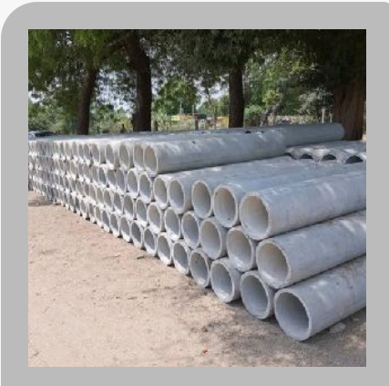
300mm NP2 RCC Hume Pipe