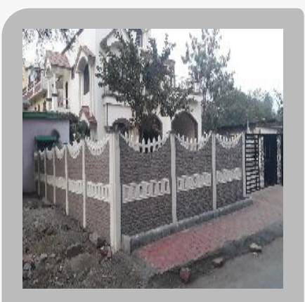
concrete boundary wall