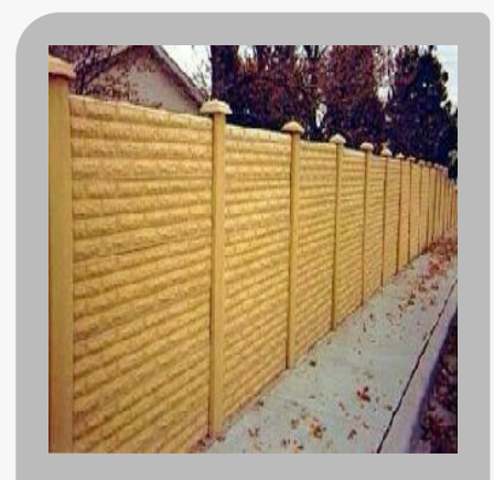
precast boundary wall