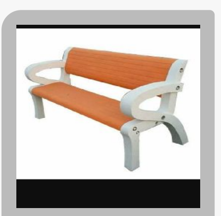
rcc garden bench WITH ARMREST