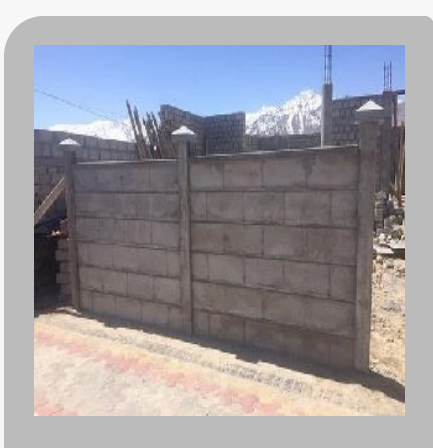
Rcc Compound Boundary Wall

We Chandragupt Buildcon Pvt Ltd are a leading and distinguished Manufacturer and Supplier of quality Compound Wall, Manufacturing & Assembling Services, Outdoor Benches and Sewerage and Drainage Products.