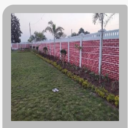
Readymade Boundary Wall