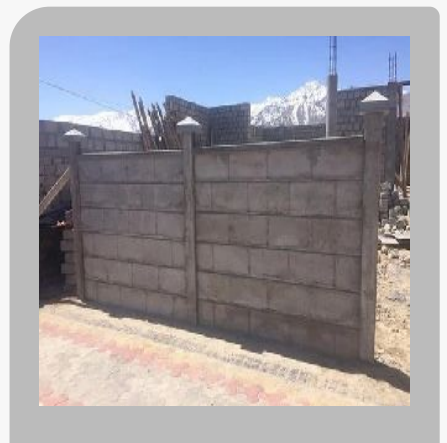
Rcc Compound Boundary Wall