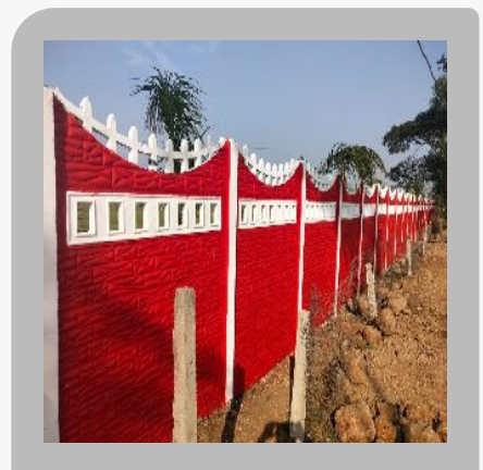
precast compound wall