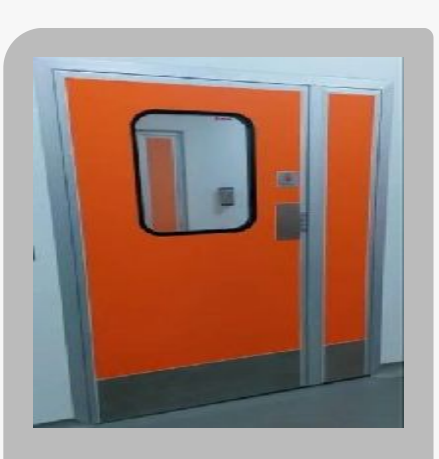
PUF Panel Door