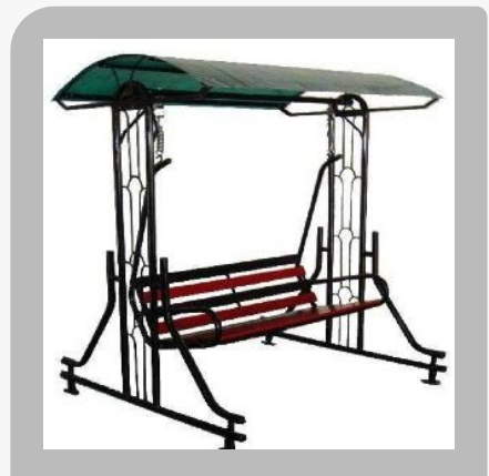
Mild Steel Swings