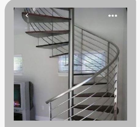
Stainless Steel Spiral Staircase Railings