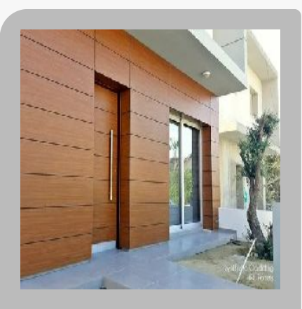
HPL Cladding Panel