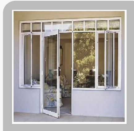
Aluminium Door and Window