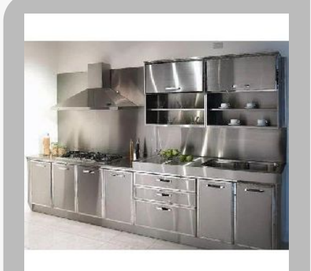
Stainless Steel Modular Kitchen