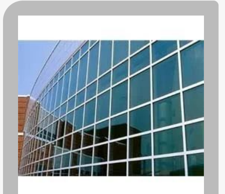
Glass Cladding Panel