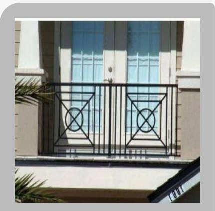
Mild Steel Balcony Railing