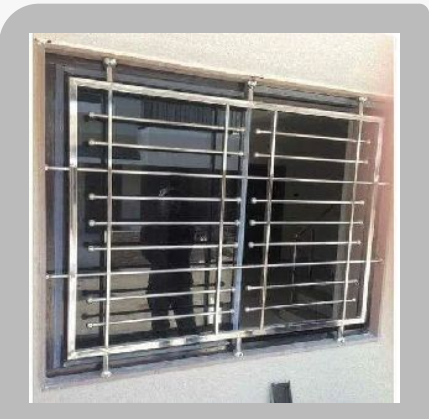
Stainless Steel Window