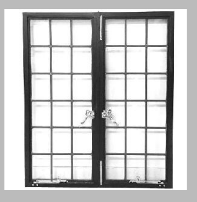
Mild Steel Window