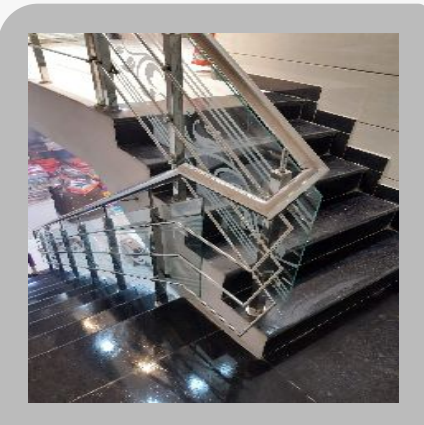
Stainless Steel Stair Railings