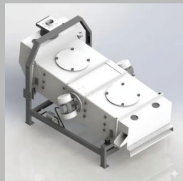
Vibro Classifier 3 Deck