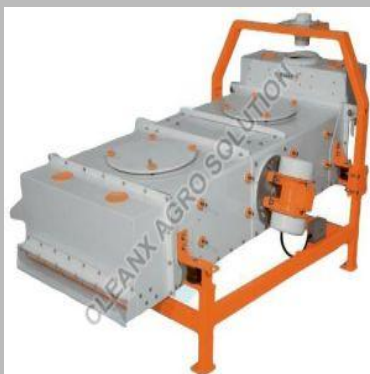
Double Deck Vibro Classifier