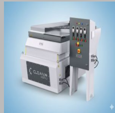
VFD Operated Gravity Separator