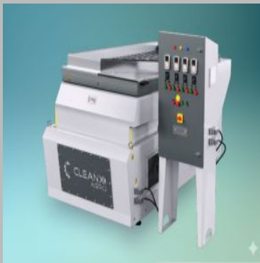
Five Fan Gravity Separator