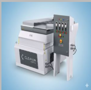
VFD Operated Gravity Separator