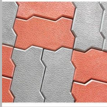
Concrete Zig Zag Paver Block