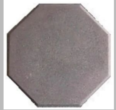
Concrete Octagon Paver Block