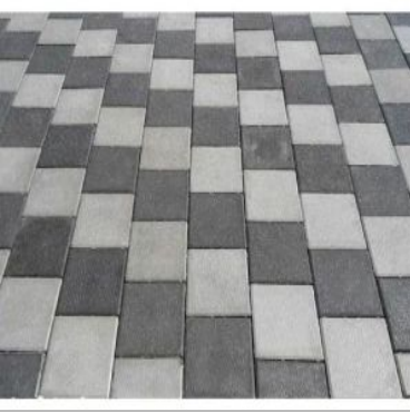
Concrete Rectangular Paver Block