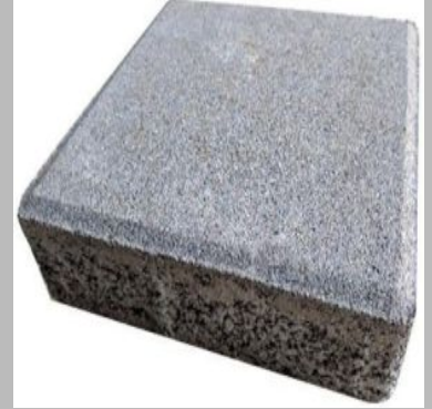
Concrete Square Paver Block