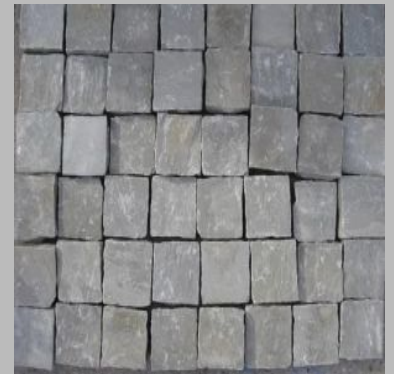
Natural Stone Cobble