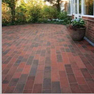
Concrete Pencil Paver Block