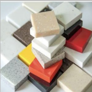
acrylic solid surface