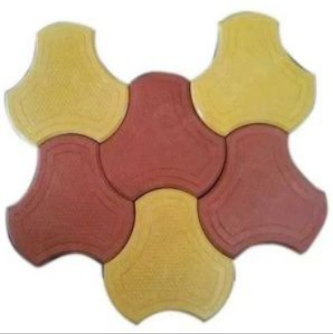
Concrete Milano Paver Block