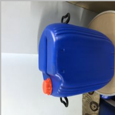
Rocket Type HM HDPE Drum