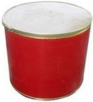
Red Color Fibre Drum