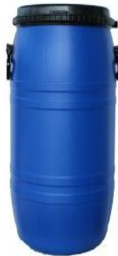
HM HDPE Full Open Top Drum