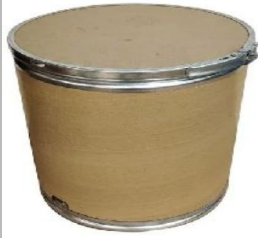
Poly Coated Fibre Drum