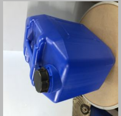
HM HDPE Jerry Can Drum