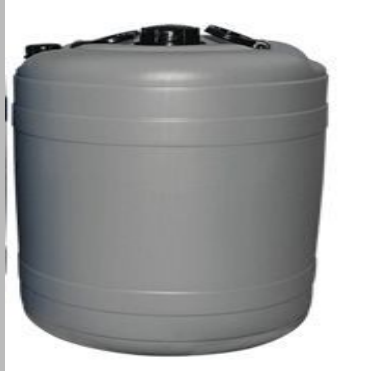
Narrow Mouth HM HDPE Drum