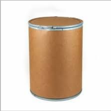
Paper Board Drum