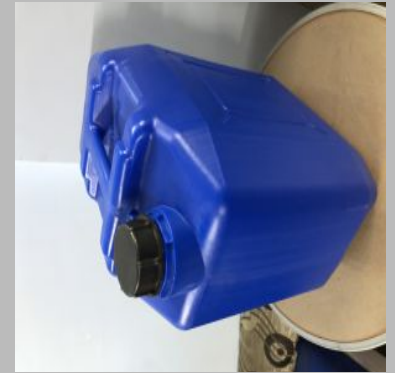
HM HDPE Jerry Can Drum