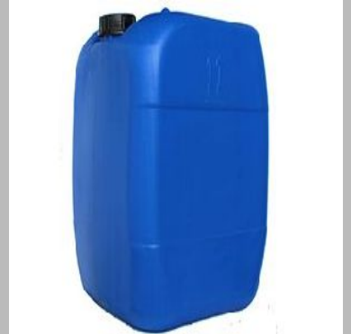
HM HDPE Square Carboy