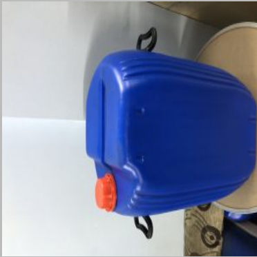
Rocket Type HM HDPE Drum