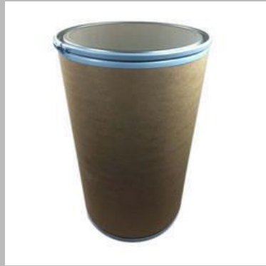
Corrugated Brown Plain Paper Drum