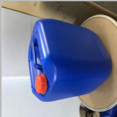
Mouser Type HM HDPE Drum