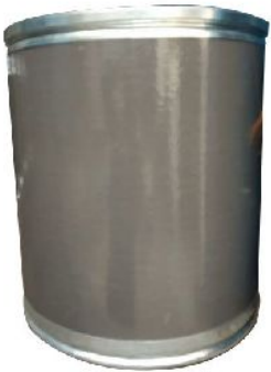
Inside Aluminium Coated Fibre Drum