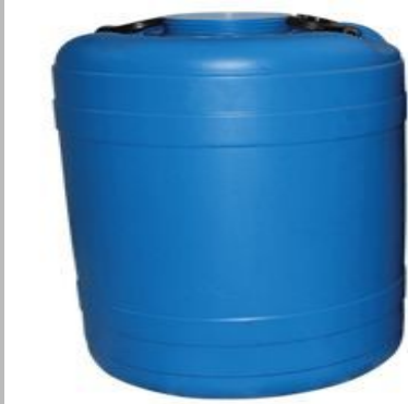
Wide Mouth HM HDPE Drum

CREATIVE PACKERS is known as top Manufacturer and Supplier of best Barrels, Drums, Laboratory Equipments, Plastic Drums and Storage Drums, Tanks & Containers.