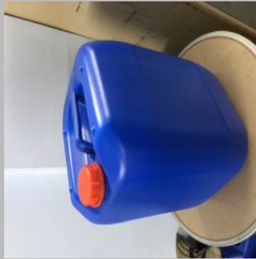
Mouser Type HM HDPE Drum