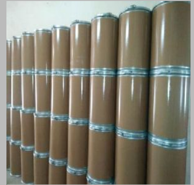
Color Coated Kraft Paper Drum