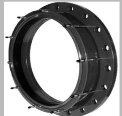
Ductile Iron Adaptors