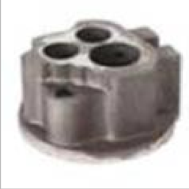
Cast Iron Cylinder Housing