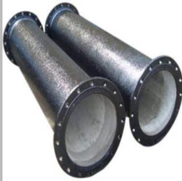
Ductile Iron Double Flanged Pipe- DIDF