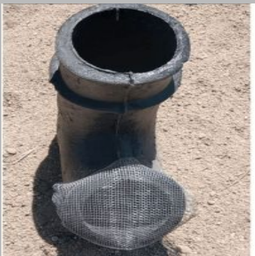
Cast Iron Cowl Pipe