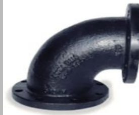
Ductile Iron All Flanged Bend