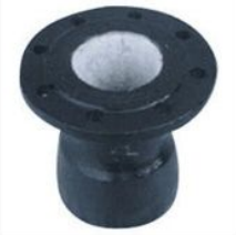
Ductile Iron Flanged Socket Tail Piece