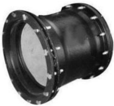
Ductile Iron Collar- Mj