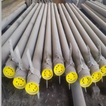
Cast Iron Earthing Pipe