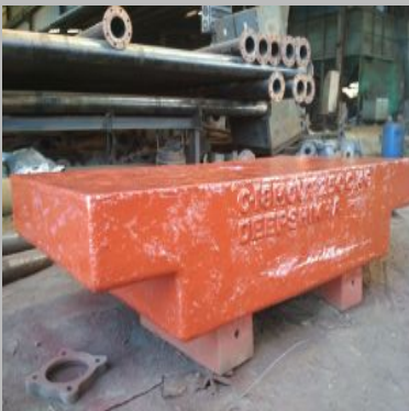
Cast Iron Filler & Counter Weight