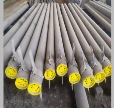
cast iron earthing pipes