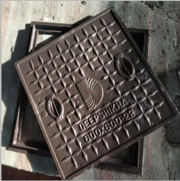
Square Manhole Cover