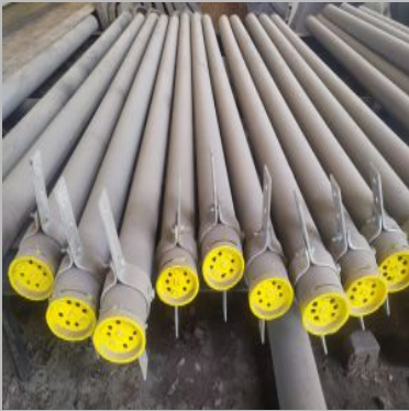
Cast Iron Earthing Pipe

Deepshikha Castings Pvt. Ltd. is known as top Manufacturer, Exporter, Supplier and Retailer of best Adaptors, Plugs and Sockets, Bollards, Ductile Iron Fittings, Electrical Panels & Distribution Box and Flanges.