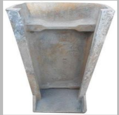
Cast Iron Brick Holder