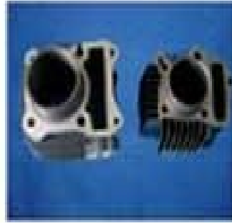
Motorcycle Cast Iron Cylinder