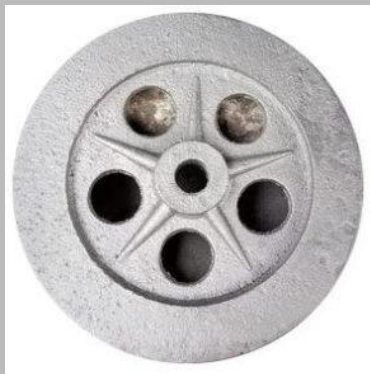
Cast Iron Flywheel