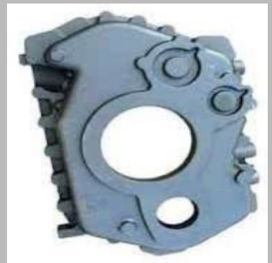
Cast Iron Gear Box