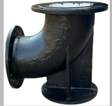
Ductile Iron Flanged Duckfoot Bend