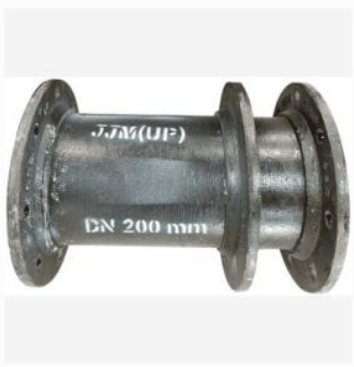
Ductile Iron Puddle Pipe