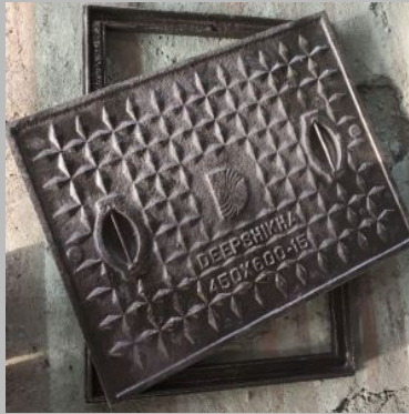
Rectangular Manhole Cover