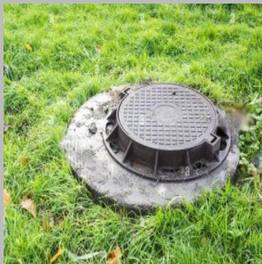
Circular Manhole Cover