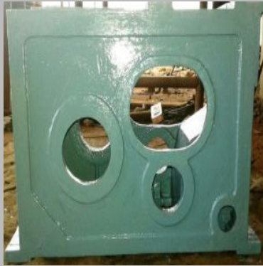
Main Body Rice Mill