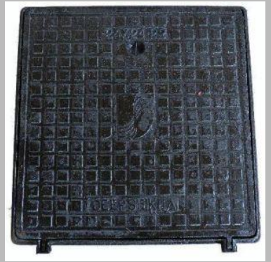
Hinged Type Manhole Cover