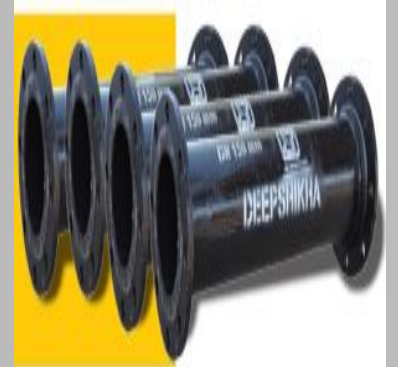
Cast Iron Double Flanged Pipe - CIDF