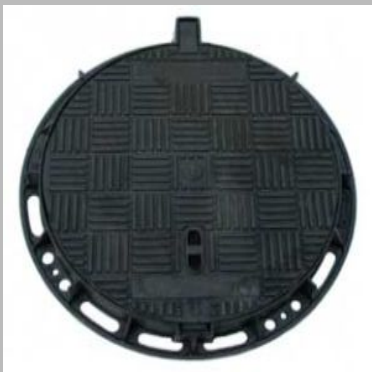
Ductile Iron Manhole Cover