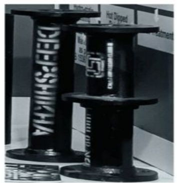
Cast Iron Puddle Pipe