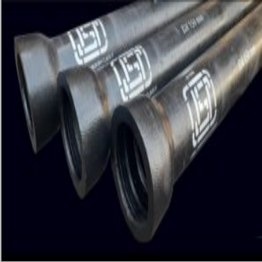
Cast Iron Socket and Spigot Pipe