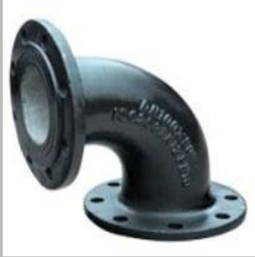
Cast Iron Flanged Bend