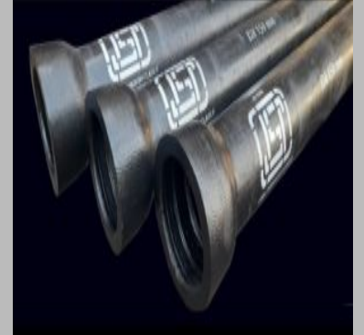
Centrifugally Cast Iron Socket and Spigot Pipe