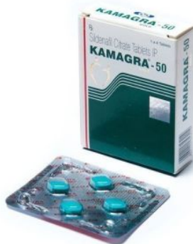
Kamagra 50mg Tablets