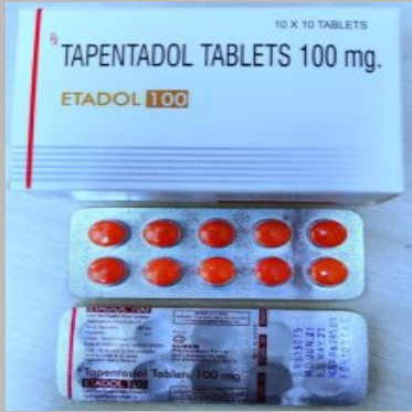
Etadol 100mg Tablets