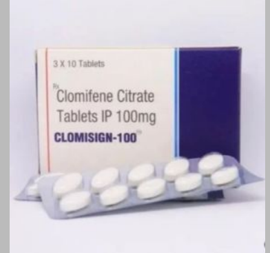
Clomisign 100mg Tablets