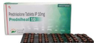
Predniheal 10mg Tablets