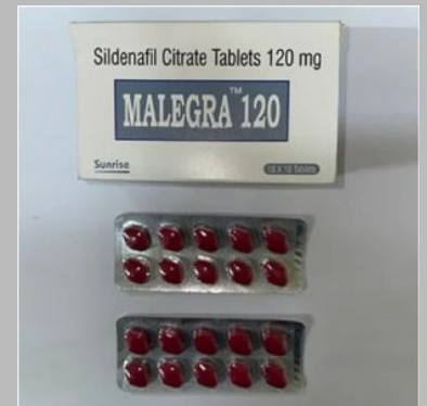
Malegra 120mg Tablets