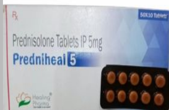
Predniheal 5mg Tablets