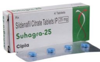
Suhagra 25mg Tablets