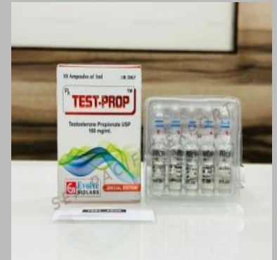
Test-Prop 100mg Injection