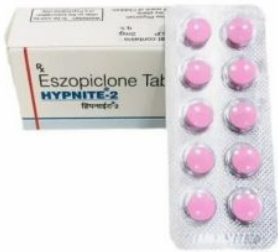
Hypnite 2mg Tablets