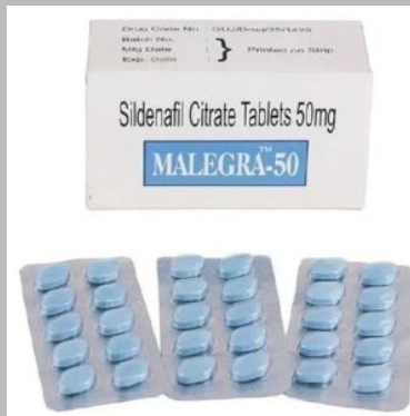
Malegra 50mg Tablets