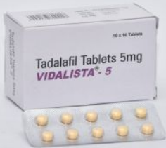
Vidalista 5mg Tablets