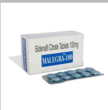
Malegra 100mg Tablets