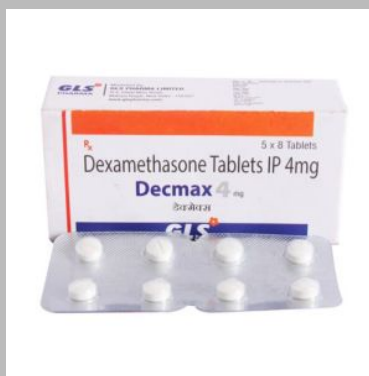
Decmax 4mg Tablets