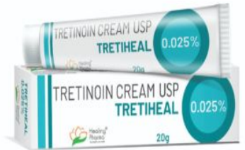
Tretiheal 0.025% Cream