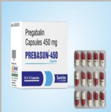
Prebasun 450mg Capsules