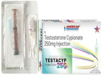
Testacyp 250mg Injection