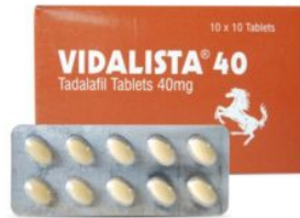
Vidalista 40mg Tablets