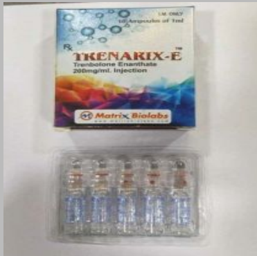
Trenarix E 200mg Injection