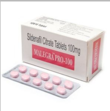
Malegra Pro-100mg Tablets