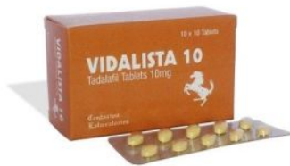
Vidalista 10mg Tablets