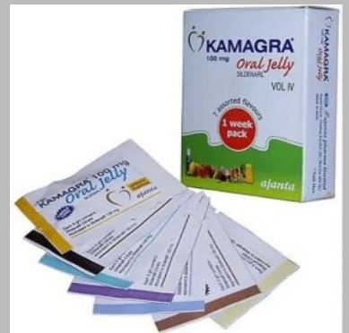
Kamagra Oral Jelly Vol. 4