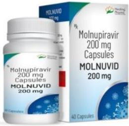
Molnuvid 200mg Capsules