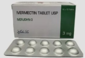
Iverjohn 3mg Tablets