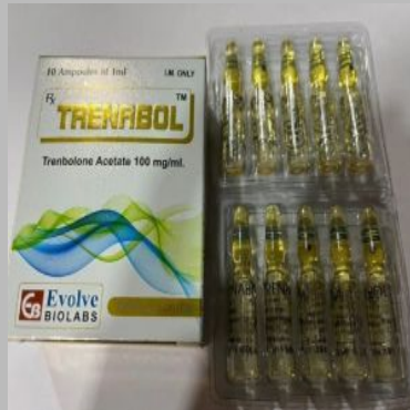
Trenabol 100mg Injection