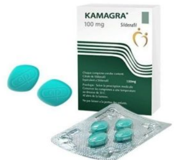
Kamagra 100mg Tablets