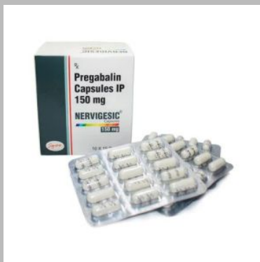
Nervigesic 150mg Capsules