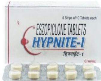
Hypnite 1mg Tablets