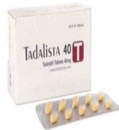
Tadalista 40mg Tablets