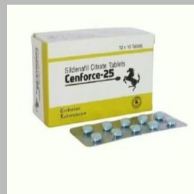
Cenforce 25mg Tablets