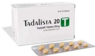
Tadalista 20mg Tablets