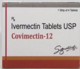
Covimection 12mg Tablets