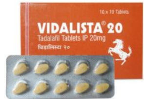
vidalista 20mg tablets