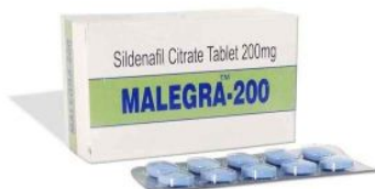
Malegra 200mg Tablets