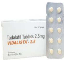
Vidalista 2.5mg Tablets