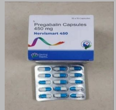
Nervismart 450mg Capsules