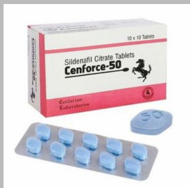
Cenforce 50mg Tablets