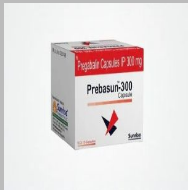
Prebasun 300mg Capsules