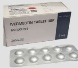
Iverjohn 6mg Tablets