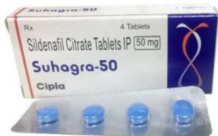
Suhagra 50mg Tablets