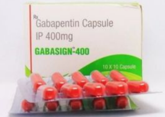
Gabasign 400mg Capsules