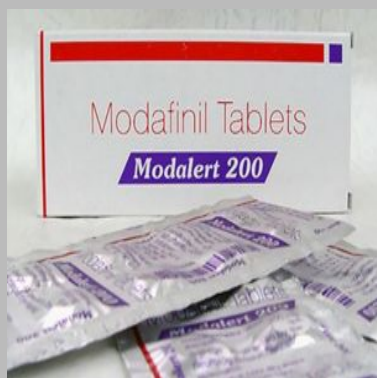
modalert 200mg tablet

Divine Biosciences is known as top Exporter and Supplier of best Anti Infective Medicines & Drugs, Antibiotic Drugs, Antidiabetic Medicine, Antiepileptic Drugs and Antifungal Injection, Tablet & Syrup.