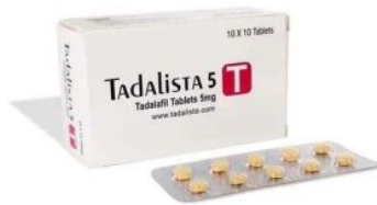
Tadalista 5mg Tablets