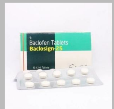
Baclosign 25mg Tablets