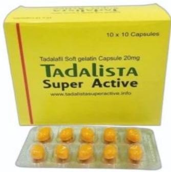
Tadalista Super Active 20mg Capsules