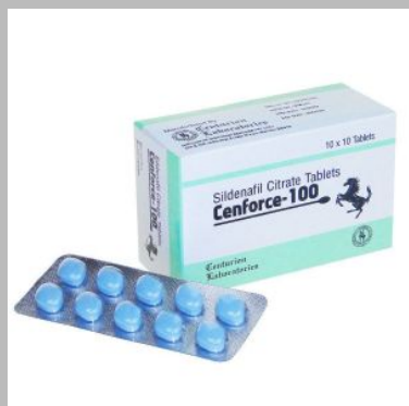
Cenforce 100mg Tablets