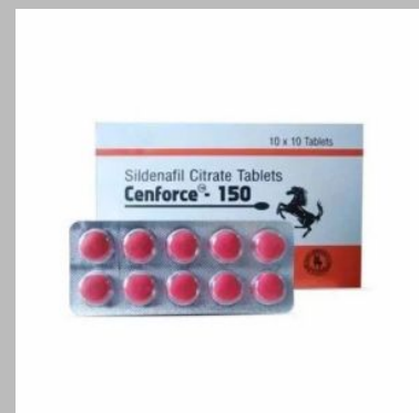
Cenforce 150mg Tablets