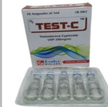
Test-C 250mg Injection