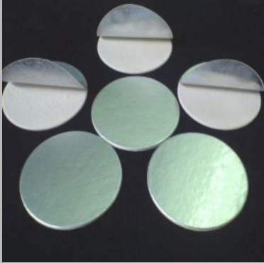
Glass Jars Induction Sealing Wad