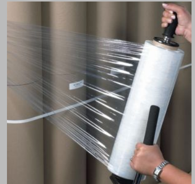
LDPE Stretch Films