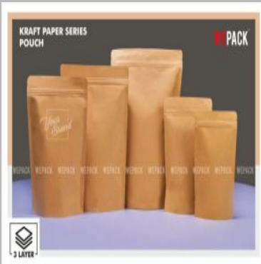
Kraft Paper Stand Up Zipper Pouches

We DOLPHIN LABELS are a leading and distinguished Manufacturer, Exporter and Supplier of quality AIR Spray Gun, Bubble Wrap, Coding Machine, Garbage and Waste Bags and Glass Bottles.