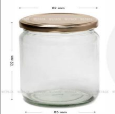
555ml Round Glass Jar