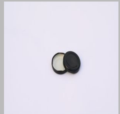
Metal 43mm Lug Cap