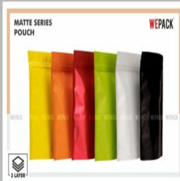
Plain Matte Stand Up Zipper Pouch