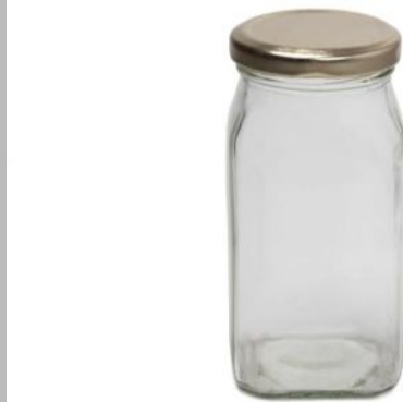
500ml Square Honey Glass Jar