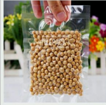
Plain Vacuum Pouch