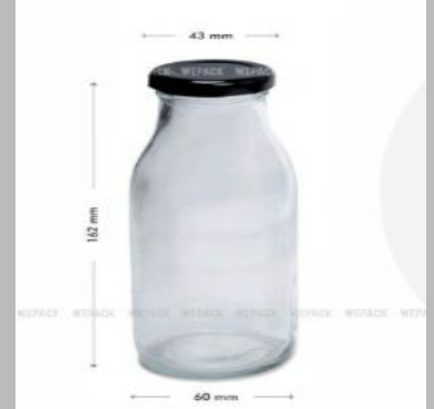
300ml Glass Milk Bottle