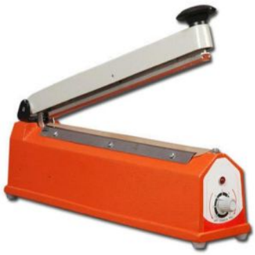
Manual Hand Sealing Machine