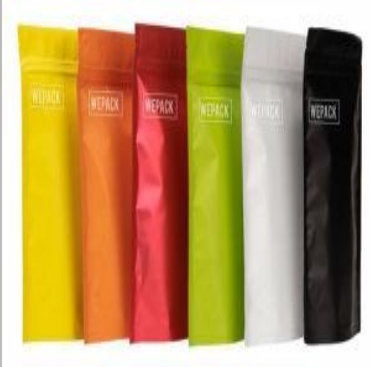
Stand Up Zipper Pouches