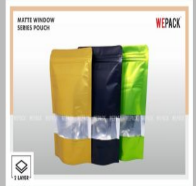
3 Layer Stand Up Zipper Pouch