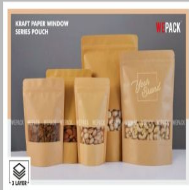
Kraft Paper Window Brown