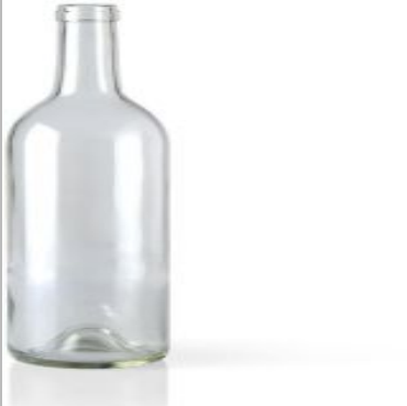
750ml Glass Wine Bottle