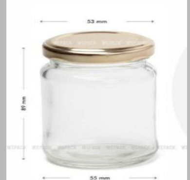
40ml Round Glass Jar