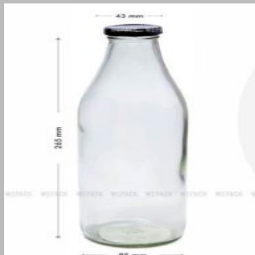
1000ml Glass Milk Bottle