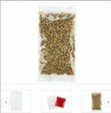
Plain Poly Pouch