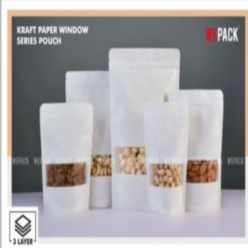
White Kraft Paper Window Stand Up Zipper Pouch