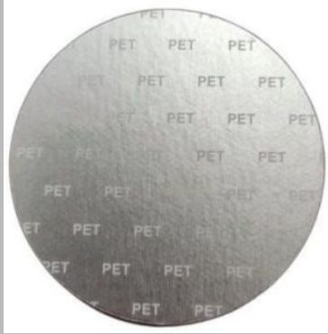
PET Induction Sealing Wad