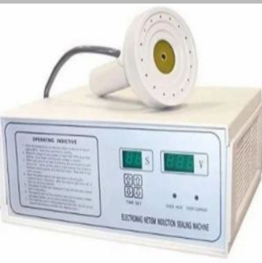
500C Manual Induction Sealing Machine