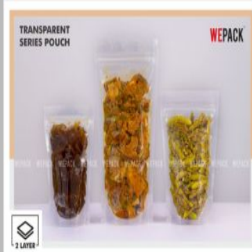
Transparent Stand Up Zipper Pouch