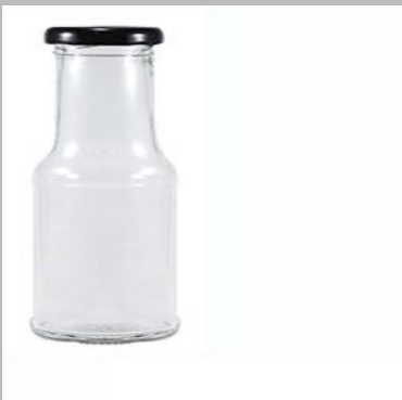
200ml Glass Milk Bottle