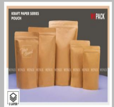
Brown Kraft Paper Stand Up Zipper Pouch