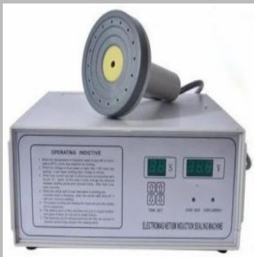
500A Manual Induction Sealing Machine