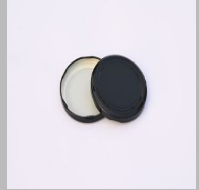
Metal 82mm Lug Cap