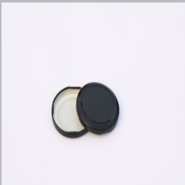
Metal 63mm Lug Cap