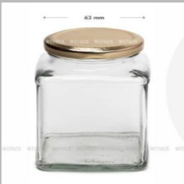
400ml Square ITC Glass Jar