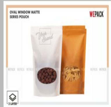
Oval Window Matte Stand Up Zipper Pouch