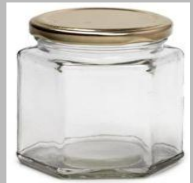
400ml Hexagonal Glass Jar