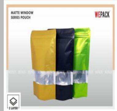
Rectangle Window Matte Stand Up Zipper Pouch