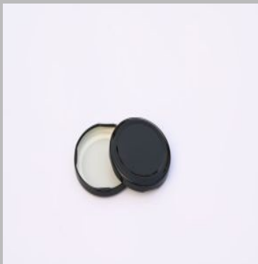
Metal 53mm Lug Cap