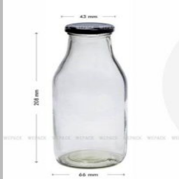
500ml Glass Milk Bottle