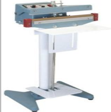
Foot Sealing Machine