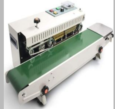
Continuous Band Sealing Machine