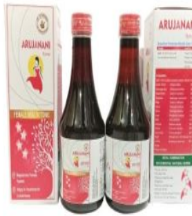
200ml Arujanani Syrup