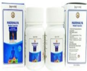
DP Ayurveda Hadshalya Hadjod Capsule