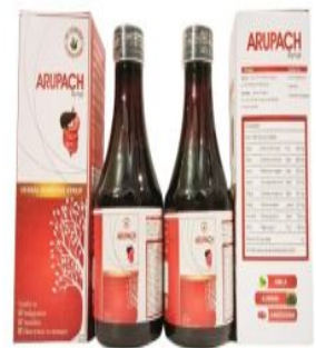
200ml Arupach Syrup