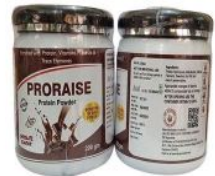
Proraise Chocolate Protein Powder