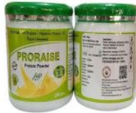
Proraise Elaichi Protein Powder