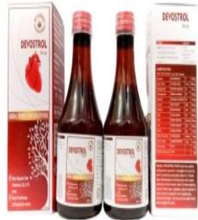
200ml Devostrol Syrup