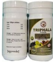
DP Ayurveda Triphala Powder