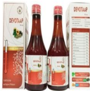
200ml Devotaap Syrup