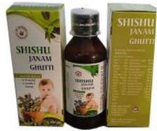
Shishu Janam Ghutti