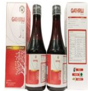
200ml Gathiruj Syrup