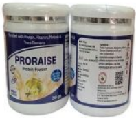
Proraise Vanilla Protein Powder