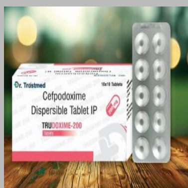
Cefpodoxime Dispersible Tablets