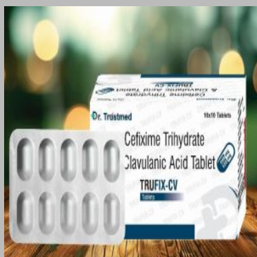
Cefixime Trihydrate Clavulanic Acid Tablets