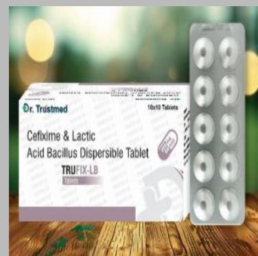
Cefixime & Lactic Acid Bacillus Dispersible Tablets