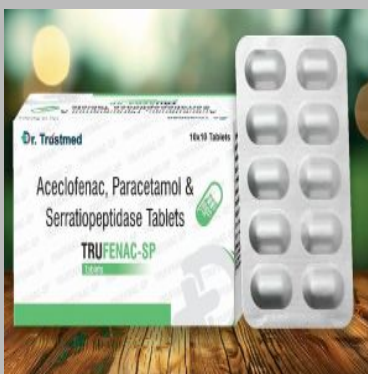
Aceclofenac, Paracetamol & Serratiopeptidase Tablets