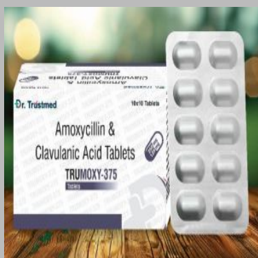
Amoxicillin & AMP; Clavulanic Acid 375 Tablets