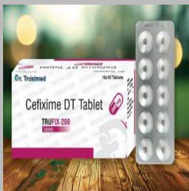
Cefixime Dt Tablets