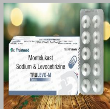
Montelukast Sodium & Levocetirizine Tablets