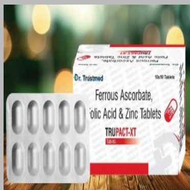
Ferrous Ascorbate, Folic Acid & Zinc Tablets