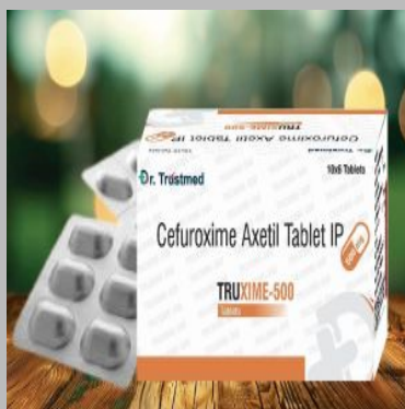
Cefuroxime Axetil Tablets