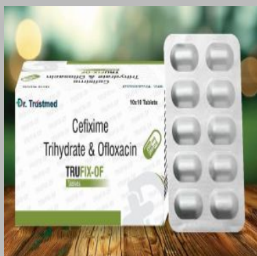
Cefixime Trihydrate & Ofloxacin Tablets