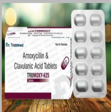
Amoxicillin & Clavulanic Acid 625 Tablets