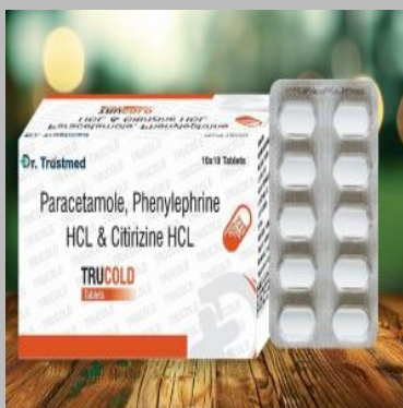
Paracetamol Phenylephrine HCL & AMP; Citirizine HCL Tablets