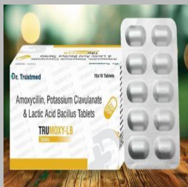
Amoxycillin, Potassium Clavulanate & Lactic Acid Bacillus Tablets