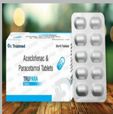
Aceclofenac & Paracetamol Tablets