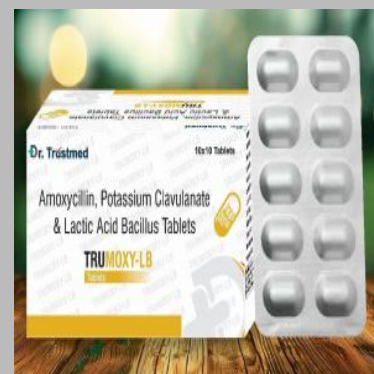
Amoxicillin, Potassium Clavulanate & Lactic Acid Bacillus Tablets