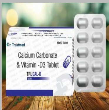
Calcium Carbonate & Vitamin D3 Tablets