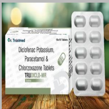
Diclofenac Potassium, Paracetamol &AMP; Chlorzoxazone Tablets