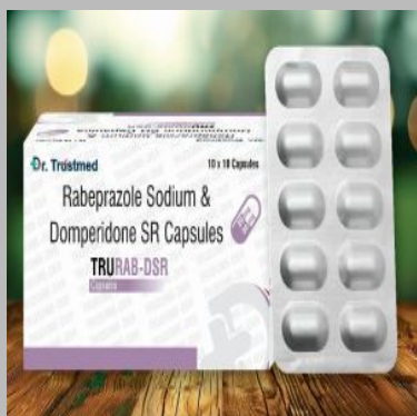
Rabeprazole Sodium & Domperidone SR Capsules