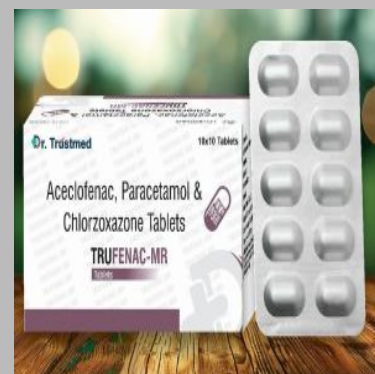
Aceclofenac, Paracetamol & Chlorzoxazone Tablets