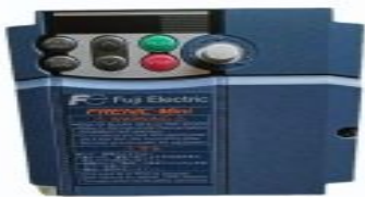
Fuji Lift Mini AC Drive