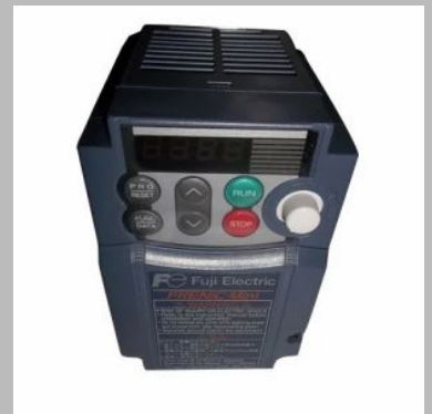
Frenic Mini AC Drive