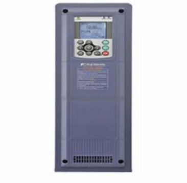
Fuji AC Drive HVAC