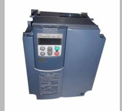
Fuji AC Drive Frenic Mega