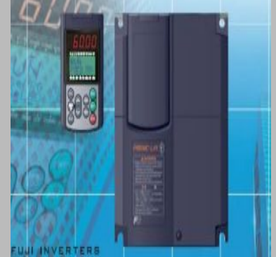
Fuji Frenic Lift AC Drive