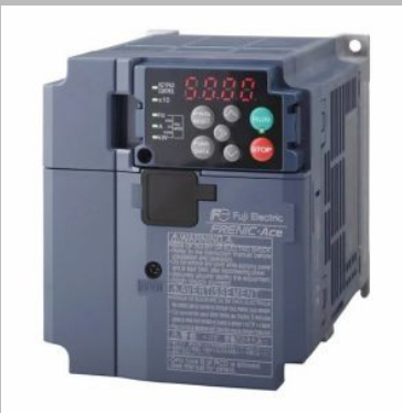
Fuji Lift Drive 7.5 KW 10 HP