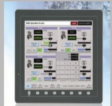
Fuji HMI V812 Series