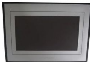
Fuji Human Machine Interface