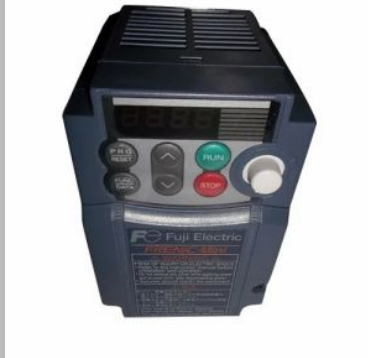
Frenic Mini AC Drive