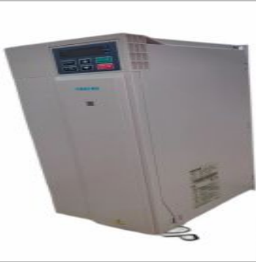
Veichi AC Drive AC310 Series