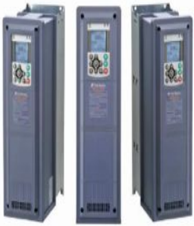
Fuji VFD AC Drive