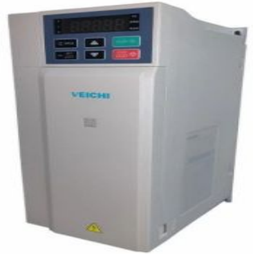
Veichi AC Drive AC300 Series

DS Automation and Controls is known as top and Distributor of best Automation System, Automotive Lights, Circuit Breaker, Electric Motors & Components and Electrical & Electronic Goods Repair.