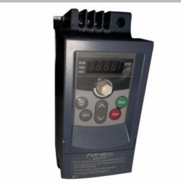
FVR Micro AC Drive