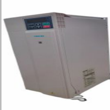
Veichi AC Drive AC310 Series