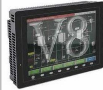
Fuji HMI V8 Series