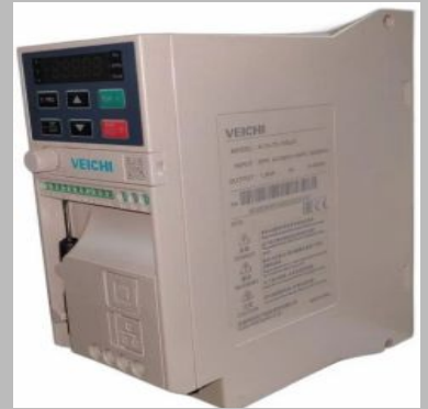
Veichi AC Drive Ac10 Series