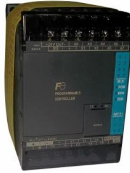
Fuji Programmable Controller