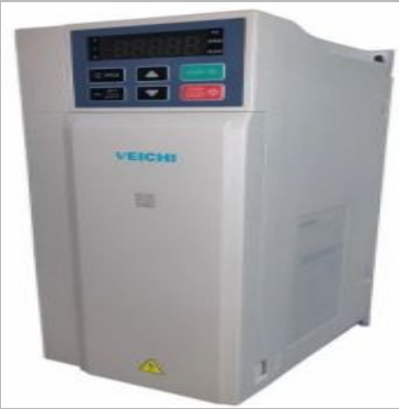
Veichi AC Drive AC300 Series