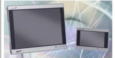
Electric Human Machine Interface