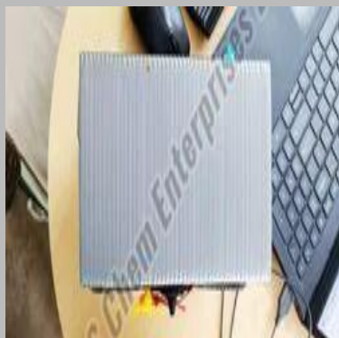
Water Hardness Testing Kit