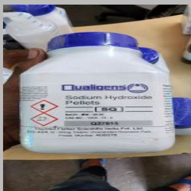
Sodium Hydroxide Naoh