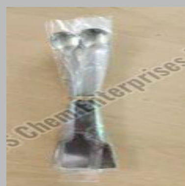
Stainless Steel Spatula