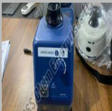
Mini Vortex Mixer