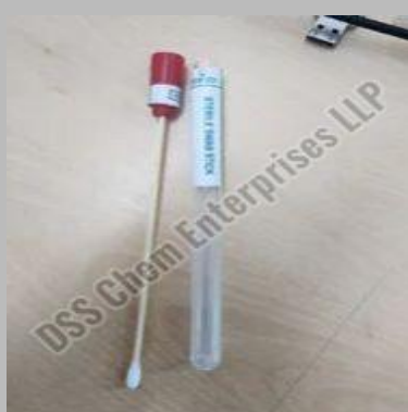
Sterile Swab Stick