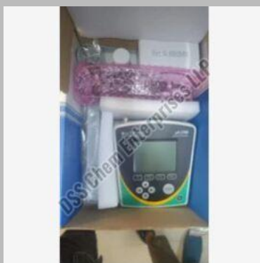
Eutech PH Meter 2700