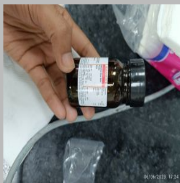
Methylene Blue Dyes