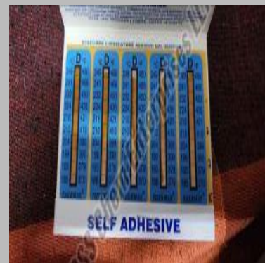
Thermax Temperature Strip