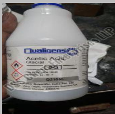
Acetic Acid Glacial