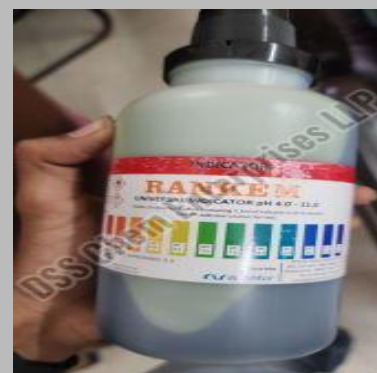
Universal Indicator Solution