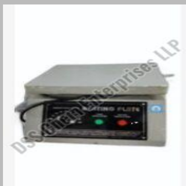
Laboratory Hot Plate