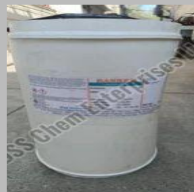
Rankem Acetone Chemical