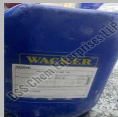
Wacker Silicone Hs