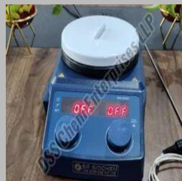
Magnetic Stirrer With Hotplate