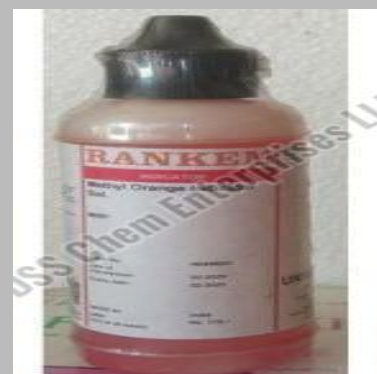
Methyl Orange Indicator