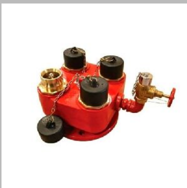
Four Way Collecting Head