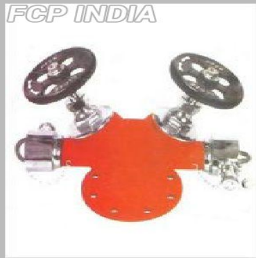
Double Outlet Type Stainless Steel Landing Valve