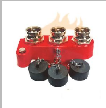
Three Way Collecting Head