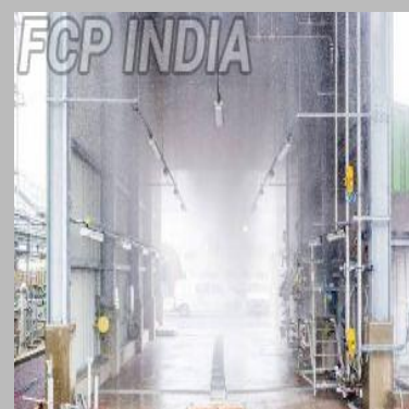
Water Spray System Solution