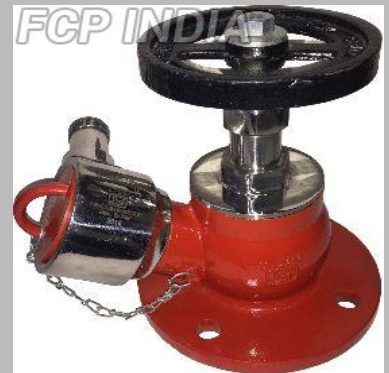
A Type Gunmetal Single Valve