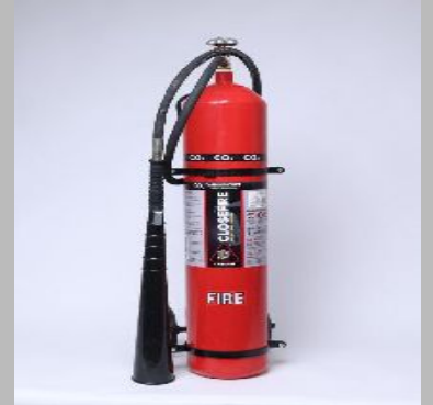
9 kg co2 fire extinguisher