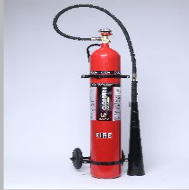
6.5Kg CO2 FIRE EXTINGUISHER