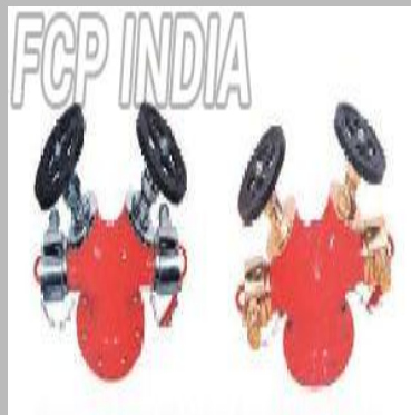
double outlet landing valve