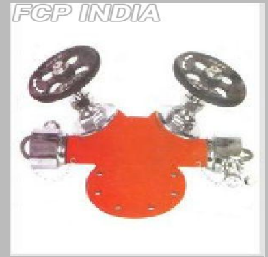
Double Outlet Type Stainless Steel Landing Valve