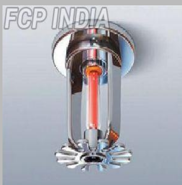
Sprinkler System Solution