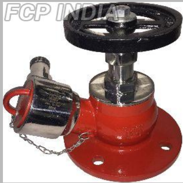
A Type Gunmetal Single Valve

We FCP INDIA are a leading and distinguished Manufacturer, Supplier, Trader, Distributor and Service Provider of quality Agriculture Equipment and Supplies, Blankets, Computer Monitor, Coupling and Drums.