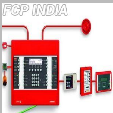
Fire Alarm System Solution