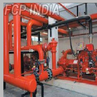
Hydrant System Solution