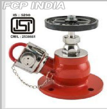
A Type Stainless Steel Single Valve