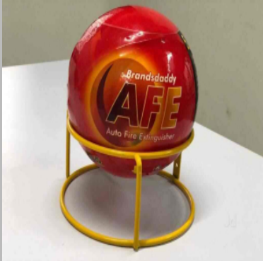
fire ball extinguisher