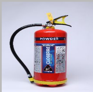
6 Kg ABC Fire Extinguisher