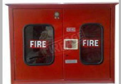
Fire Hose Box