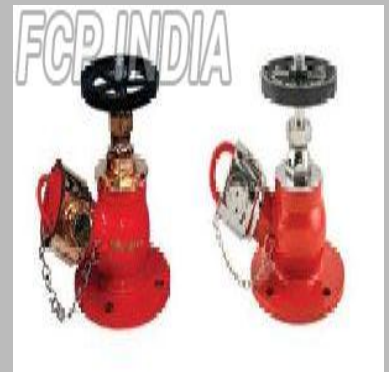
Single Landing Valve