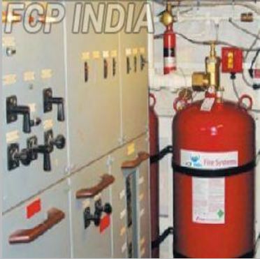
Automatic Co2 Flooding System Solution