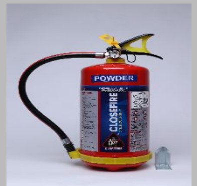
4kg Abc Dry Powder Fire Extinguisher