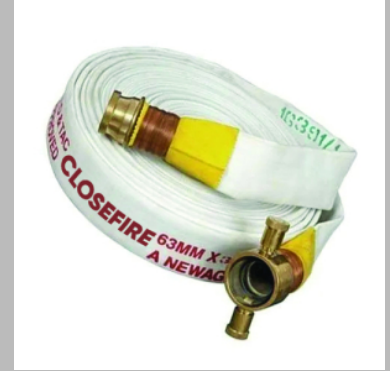
4.5 KG CO2 Fire Extinguisher