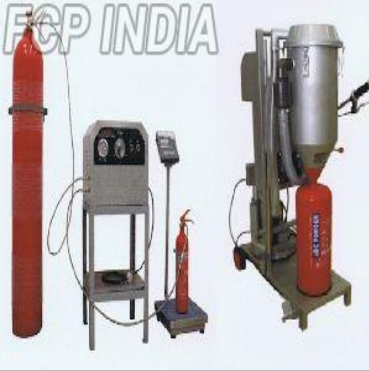
Fire Extinguisher Refilling Service