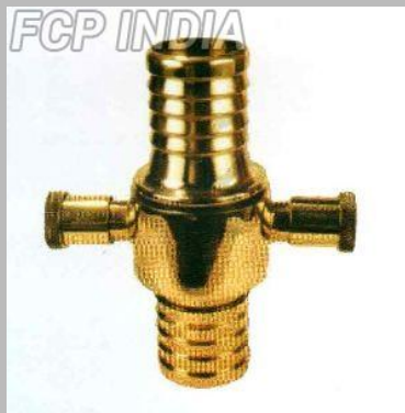
Gunmetal Delivery hose Couplings