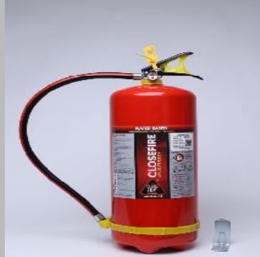
9L Water Co2 Fire Extinguisher