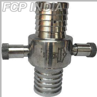
Double Outlet Type Gunmetal Landing Valve