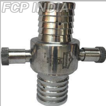
Double Outlet Type Gunmetal Landing Valve