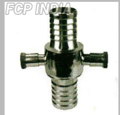
Stainless Steel Delivery hose Couplings