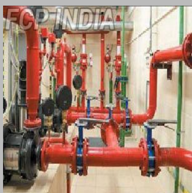
Wet Chemical System Solution