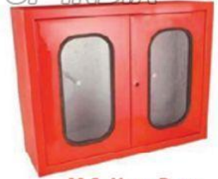
M.S. Hose Box