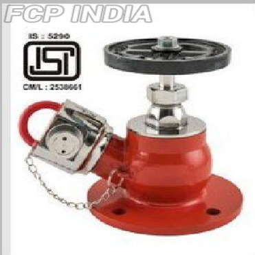
A Type Stainless Steel Single Valve