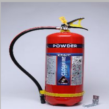
9 Kg ABC Fire Extinguisher