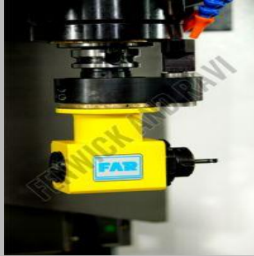
BT50 Series Angle Heads