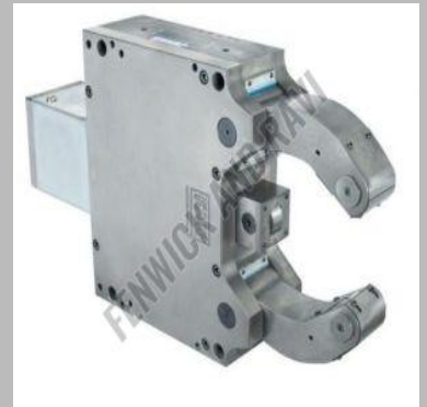
Turning HSR - FRU