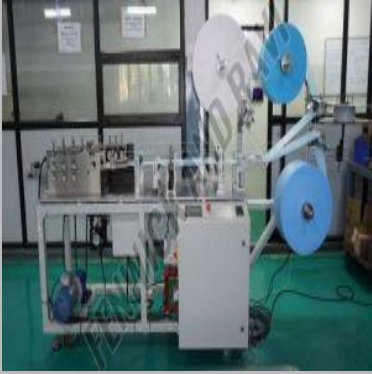
Fully Automatic Mask Making Machine