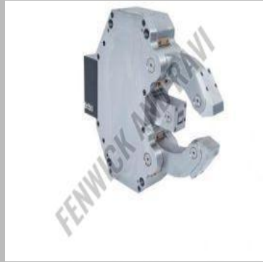
Turning HSR - FRC