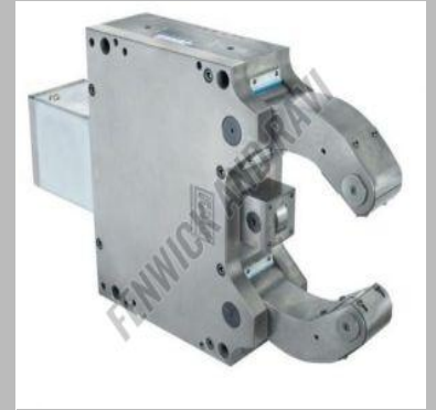
Turning HSR - FRU