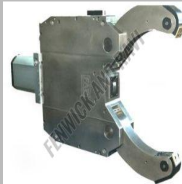
Turning HSR – FRUA