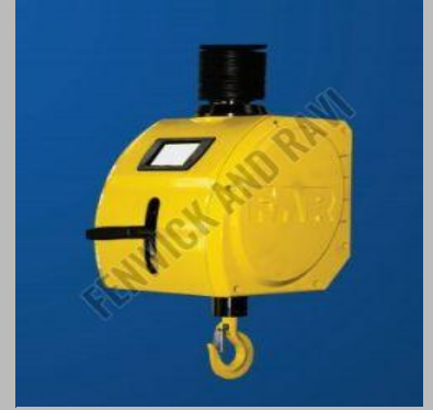
Material Handling Machine