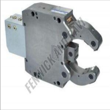
Turning HSR – FRUN