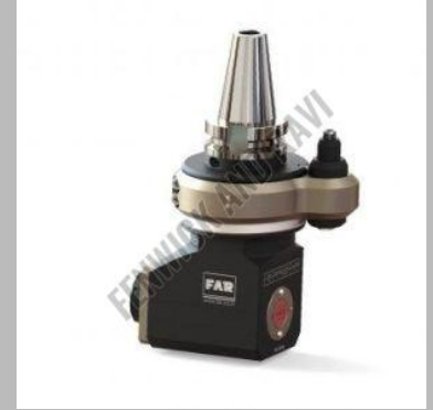
BT40 Series Angle Heads