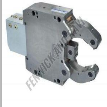
Turning HSR – FRUN