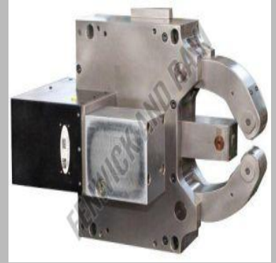
Turning HSR – FRUB