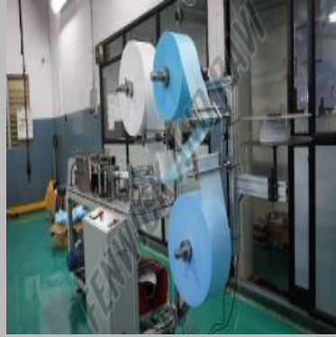
Semi-Automatic Mask Making Machine