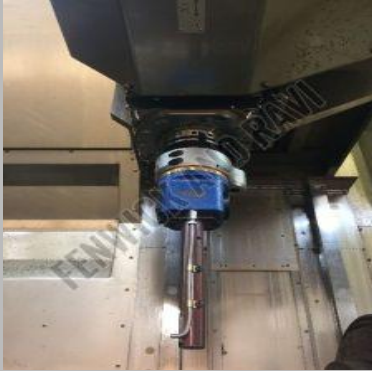
Customised Right Angle Head