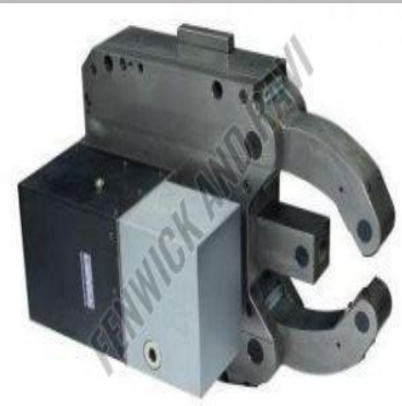
Turning HSR – FRUAB