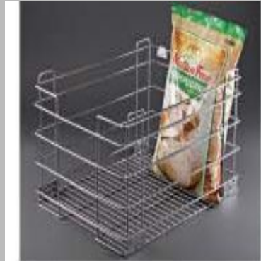
Stainless Steel Storage Solutions Series Grain Trolley Basket