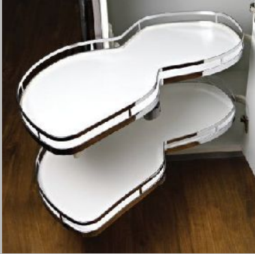
PFS-108 Soft Close Swift Corner Unit