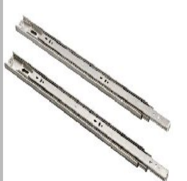
stainless steel channels