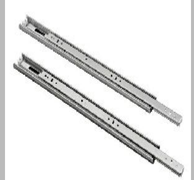
PH-303 Stainless Steel Telescopic Channel