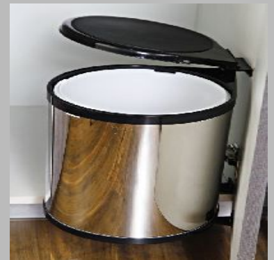
Auto Lid Dustbin