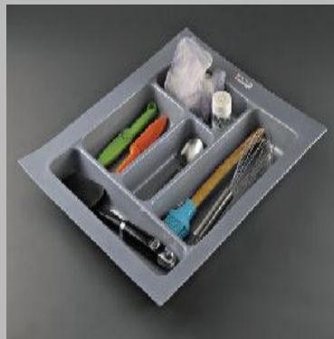
PVC Cutlery Box