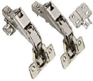
PH-309 Corner Hinges