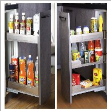
Satin Bottle Pullout