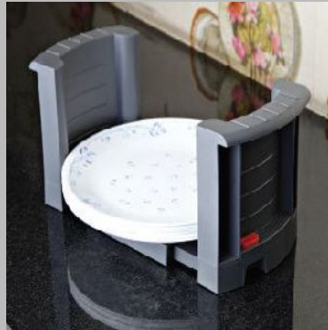
PVC Dish Holder