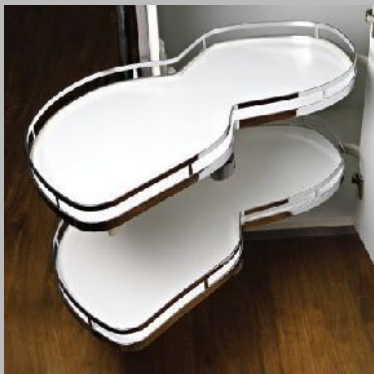
PFS-108 Soft Close Swift Corner Unit