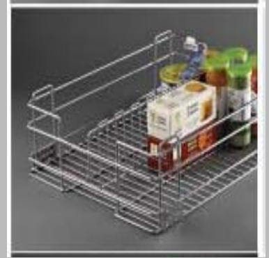
Stainless Steel Storage Solutions Series Partition Basket