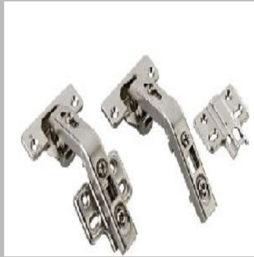
PH-308 Pie Hinges