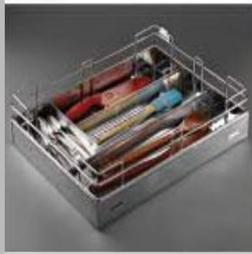
Stainless Steel Storage Solutions Series Perforated Cutlery Basket