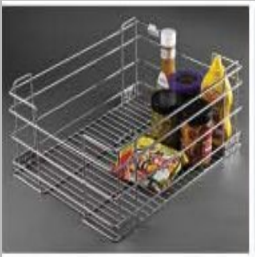
Stainless Steel Storage Solutions Series Multipurpose Kitchen Basket