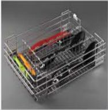
Stainless Steel Storage Solutions Series Wire Cutlery Basket