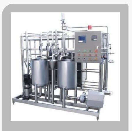
Multi-Tube Coaxial Heat Pasteurizer