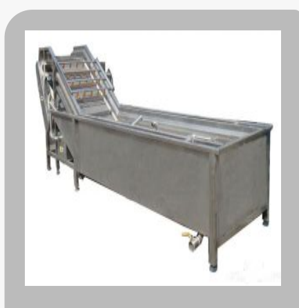
Fruits and Vegetable Washer Machine