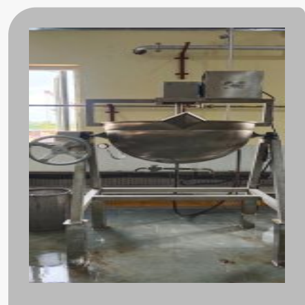
Steam Jacketed Kettles