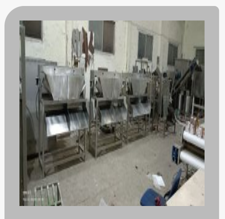
Double Head Halving Machine