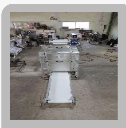
Raw Mango Cubing Machine