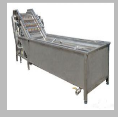
Fruits and Vegetable Washer Machine