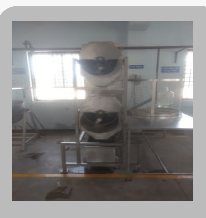
Mango Pulper Machine