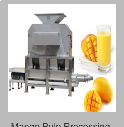
Mango Pulp Processing Machine