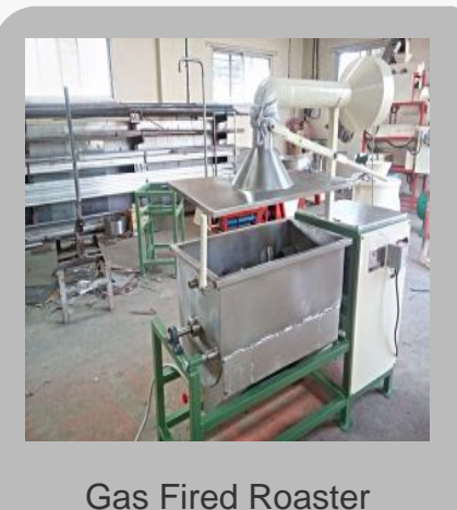
Gas Fired Roaster