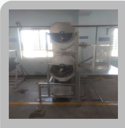
Mango Pulper Machine