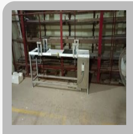
Fruit Bar Cutting Machine