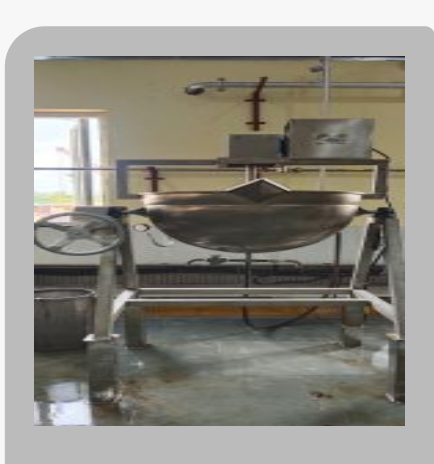
Steam Jacketed Kettles