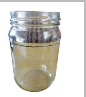
300 ml Glass Pickle Jar