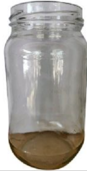
400 ml Glass Round Jar