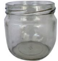
370 ml Glass Round Jar