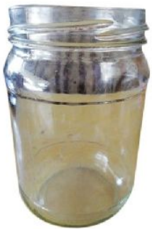
300 ml Glass Pickle Jar