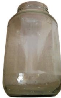
2000 ml Glass Bakery Jar