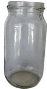
250 ml Glass Round Jar