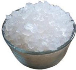
White Silica Gel