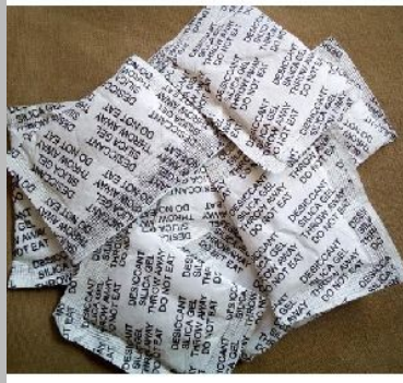
Reagent Grade Silica Gel