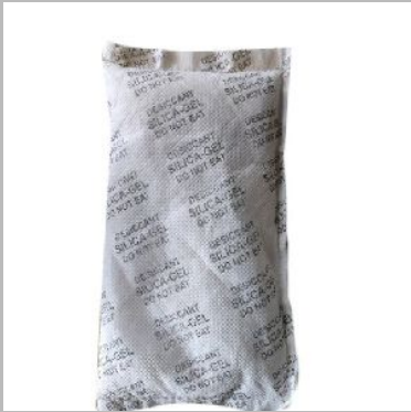
Technical Grade Silica Gel