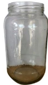
1000 ml Glass Round Jar