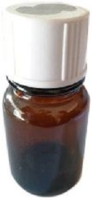
60 ml Glass Essence Jar