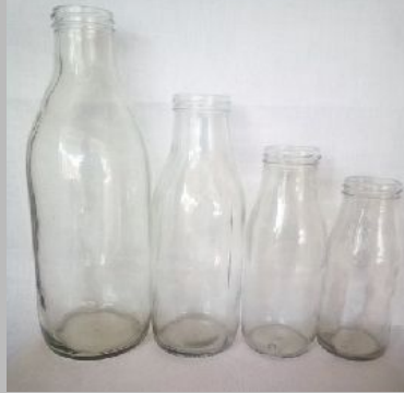
Glass Water Bottle