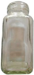
300 ml Glass Square Jar