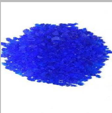
CC Grade Silica Gel