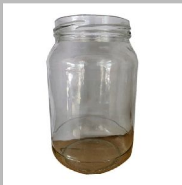
500 ml Glass Round Jar