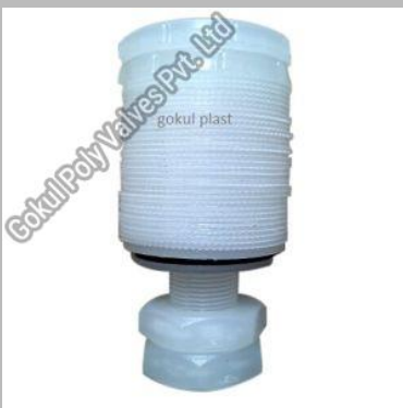
Polypropylene Disc Type Strainers