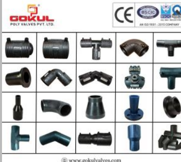
HDPE Pipe End Connection