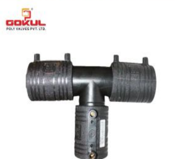
HDPE Electrofusion Reducing Tee