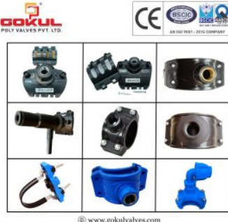
HDPE Electrofusion Fittings Saddle