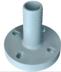
PP HOSE NIPPLE FLANGE