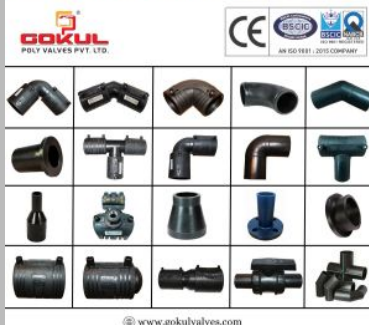
PE Spigot Elbow 22.5 Degree