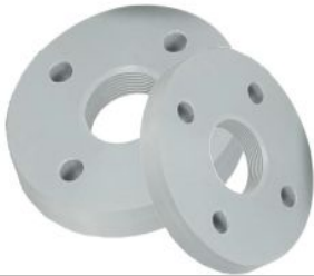
PP Threaded Flange