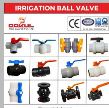
PP Union Ball Valve