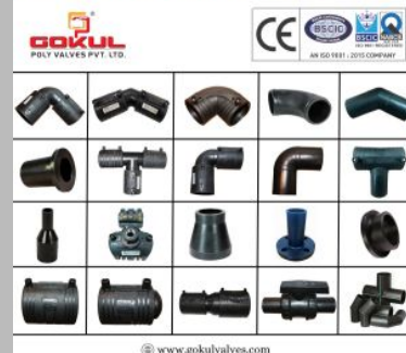
Pe Spigot Elbow