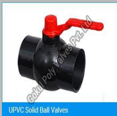
UPVC Solid Ball Valves