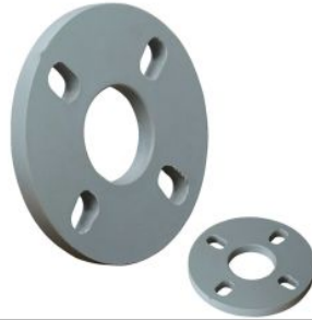
PP Slip On Flange