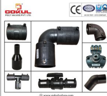
Pe Electrofusion 90 Degree Elbow