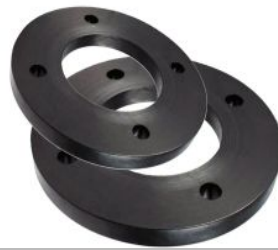
HDPE Slip On Flange