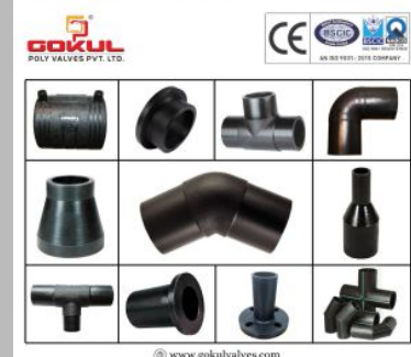
HDPE Spigot Elbow