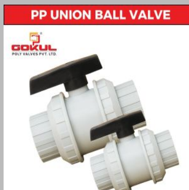
PP Union Type Ball Valve