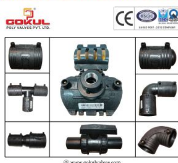
Electrofusion PIPE Fitting