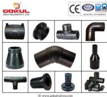
Spigot Pipe Fitting