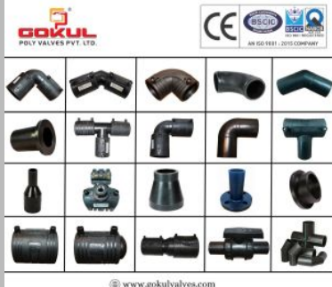
PE Elbow 45 Degree