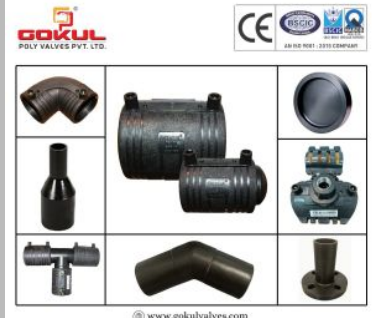
HDPE Electrofusion Fittings End Cap