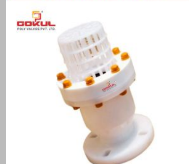
Plastic Foot Valve