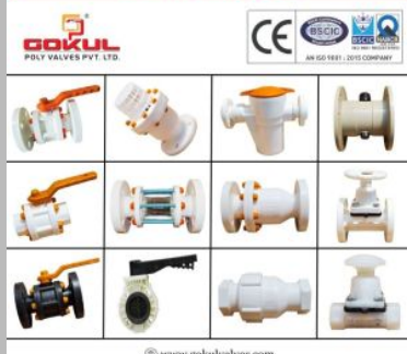
PP Foot Valve