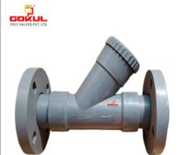
PP Y Type Strainer Flange End