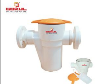
PP Basket Strainer