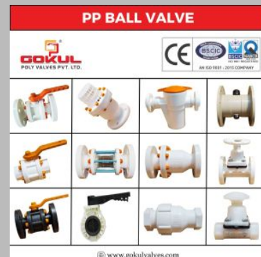
Single Piece Ball Valve