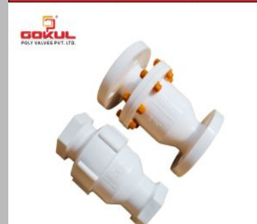
Polypropylene Non Return Screwed Valve