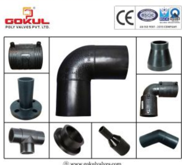
Pe Spigot 90degree Elbow