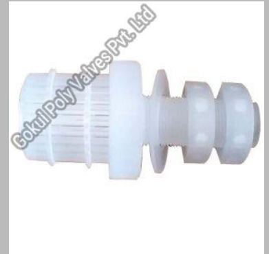
Polypropylene Double Decker Strainer