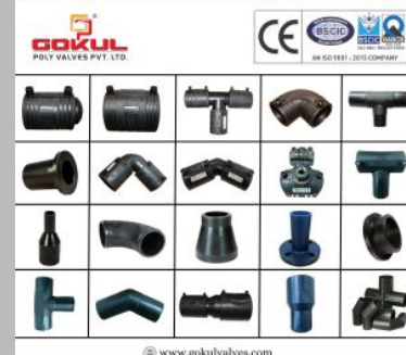
Fusion Electrofusion Fittings