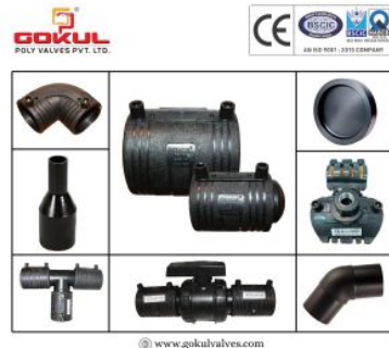
Pe End Cap