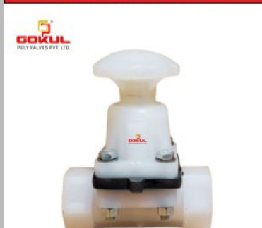
PP Diaphragm Screwed End Valve