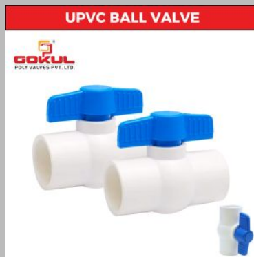
UPVC Ball Valve