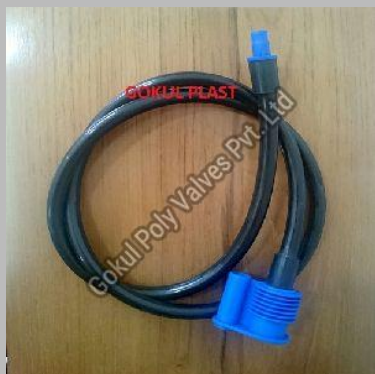
Sprinkler Tube Set