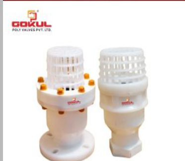
Polypropylene Foot Valve