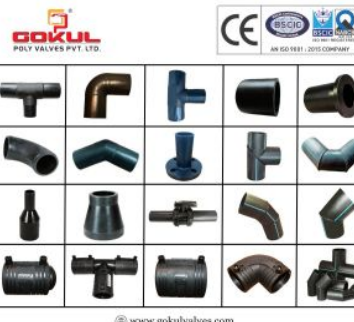
Pe Spigot Tee