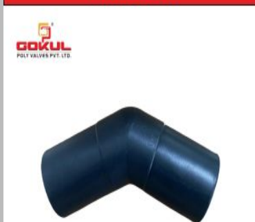
HDPE Spigot Elbow 45 Degree