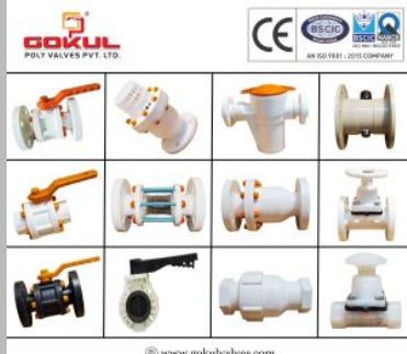
Polypropylene Ball Valves