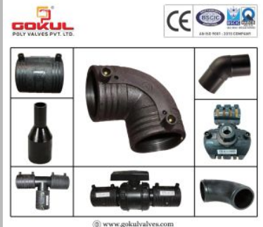
Spigot Pipe End