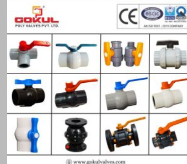
PP Solid Ball Valves