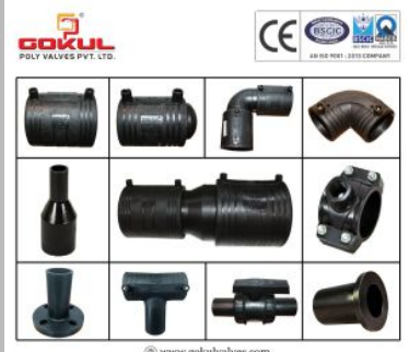
Pe Spigot Reducer