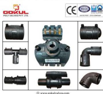
Gokul Electrofusion Fittings