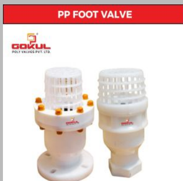
Screwed End PP Foot Valve