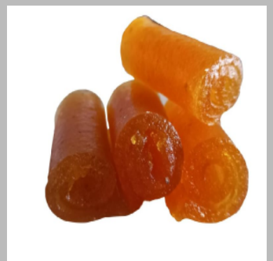
Pineapple Fruit Roll Up