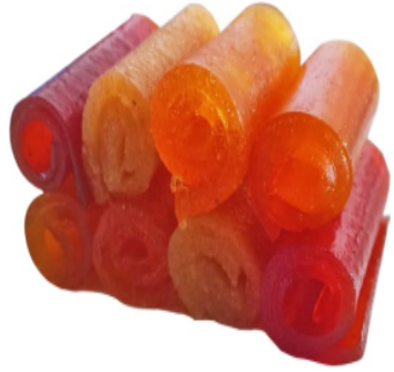
Mixed Fruit Roll Up