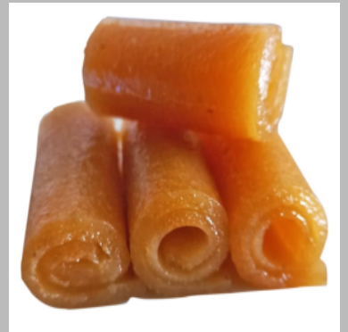
Guava Fruit Roll Up