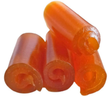
Mango Fruit Roll Up