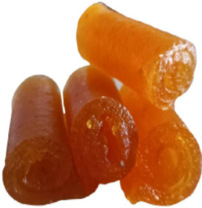
Pineapple Fruit Roll Up