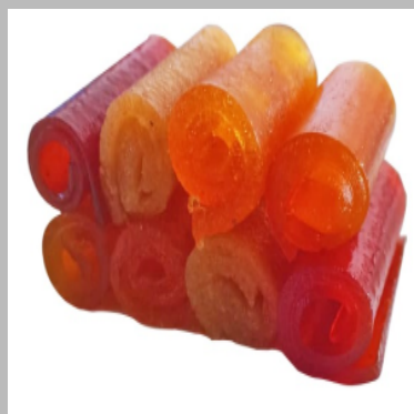
Mixed Fruit Roll Up