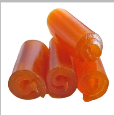
Mango Fruit Roll Up