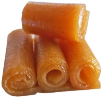
Guava Fruit Roll Up