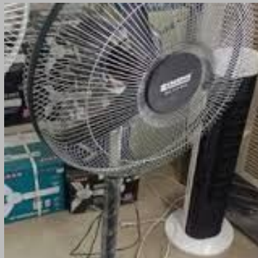
Champion Bullet Pedestal Fan,