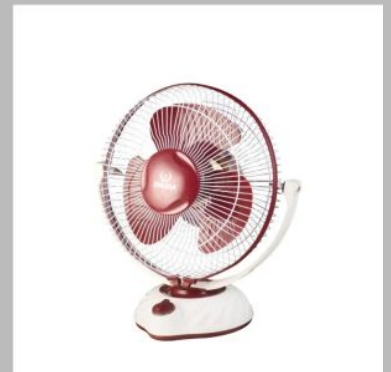
12 Inch Royal Table FAN