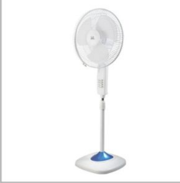
16 Inch Twister Pedestal Fan