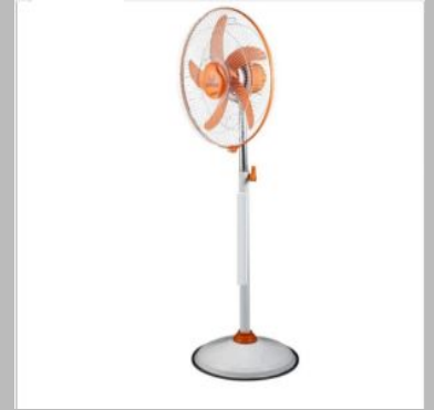
16 Inch Orange Budget Pedestal Fan