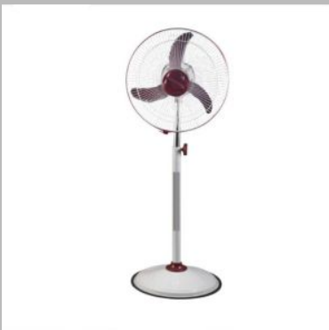
16 Inch Maroon Eco Bullet Pedestal Fan