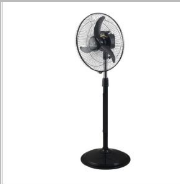
16 Inch Force Pedestal Fan