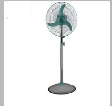
16 Inch Eco Bullet Pedestal Fan