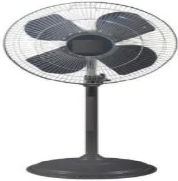
20 Inch Diamond Pedestal Fan