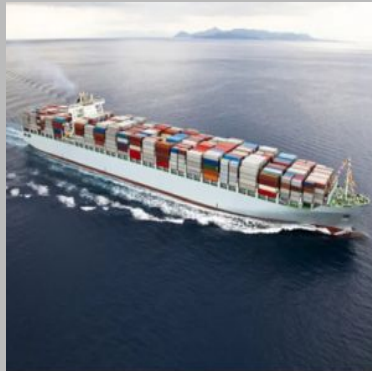
Sea Logistics Service