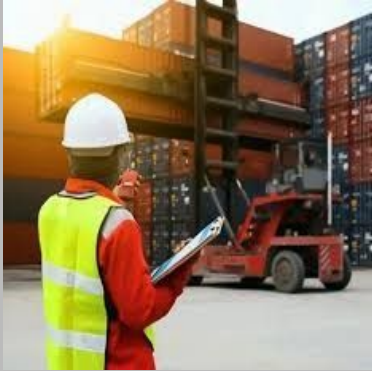
Garments Export Custom Clearance Service