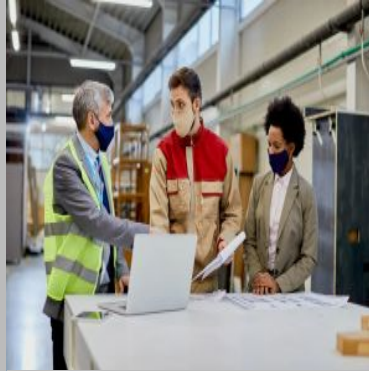
Custom Clearing Service