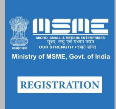
MSME Registration Service