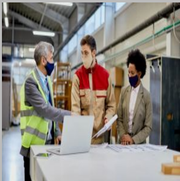
Custom Clearing Service