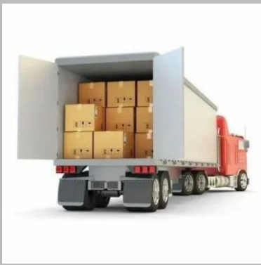
Local Logistics Service