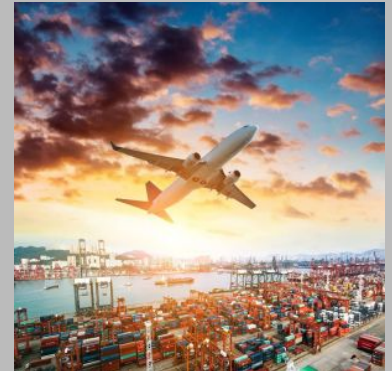
Air Freight Service