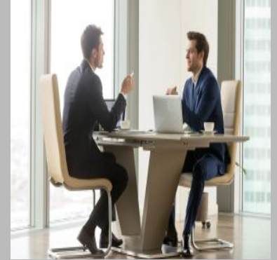
Logistics Consultancy Service