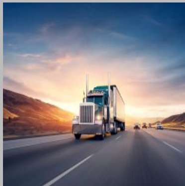
Land Freight Service