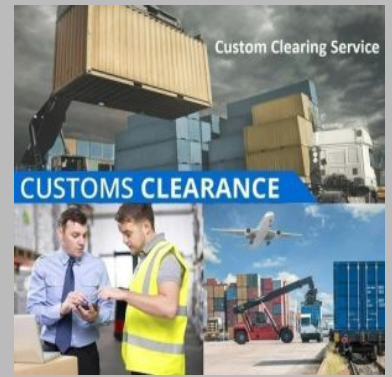
Ahmedabad Customs Clearance Services