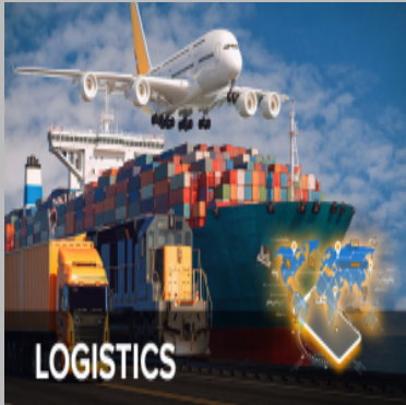
Global Logistics Service