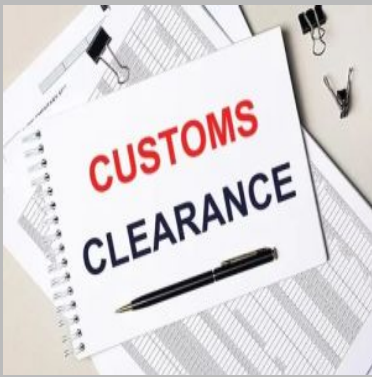
Custom Clearance Documentation Services