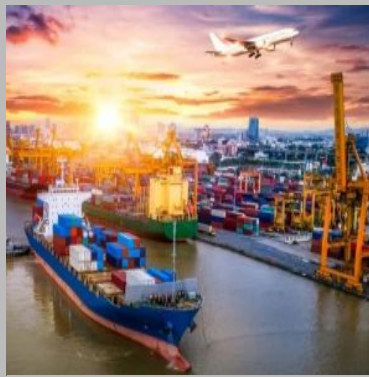
Cochin Port Customs Clearance Services