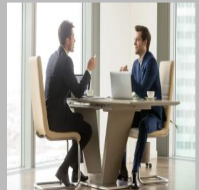
Logistics Consultancy Service