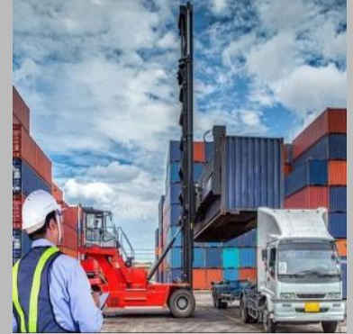
Mundra Port Custom Clearance Service