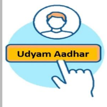
Udyam Aadhar Registration Service