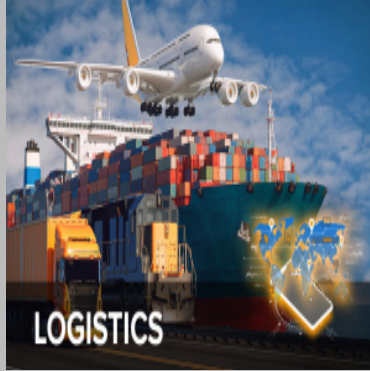
Global Logistics Service