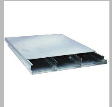
Floor Cable Raceway