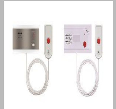
Nurse Call System