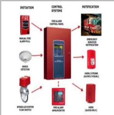
Fire Alarm System