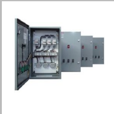
Power Distribution Control Panel