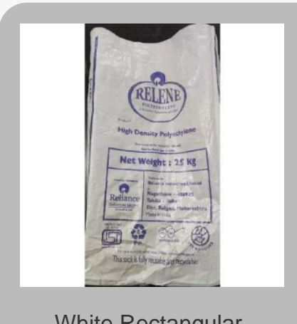
White Rectangular Polypropylene Woven Bag