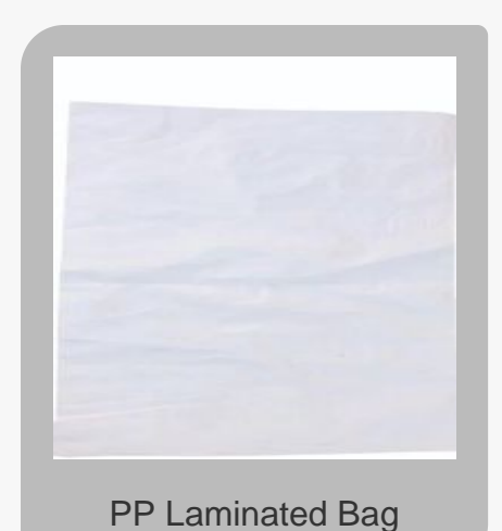
SHANTI CHEMICAL WORKS INDIA SODIUM SILICATE POWDER (GRADE: A-20) NET WT: 25 KG. BATCH NO: USE NOHOOKS PP Woven Laminated Bag

HD ENTERPRISE is known as top Manufacturer and Supplier of best BOPP Bag, Bulk Bags & Sacks, Food Packaging Supplies, Gunny Bags and Industrial Fabrics.