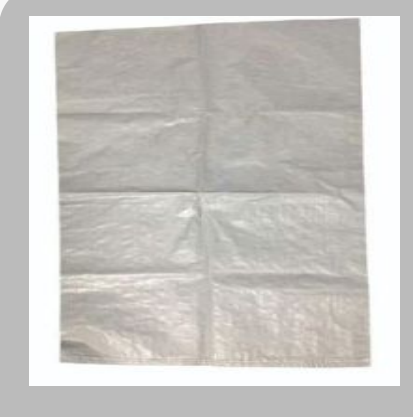
Polypropylene Plain Woven Sack Bag